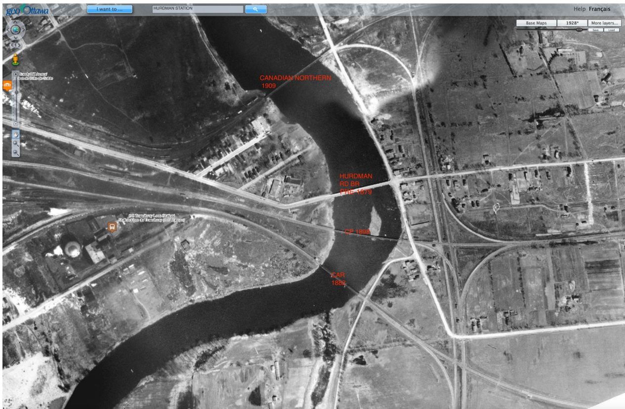
Airphoto 1928 showing the four historic bridges over the Rideau River at the “Hurdman” crossing [from north to south: Canadian Northern Railway Bridge-1909 (demolished), Hurdman Brothers Road Bridge pre-1879 (demolished), CPR Railway Bridge 1898 (existing), Canadian Atlantic Railway Bridge, 1882 (demolished)]