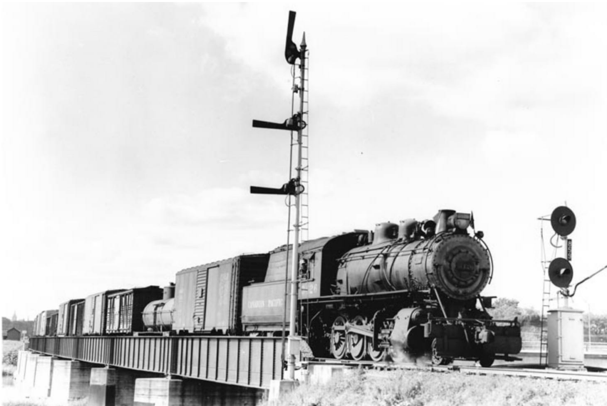
CPR (M&O Railroad) bridge across Rideau River in Ottawa, inaugurated July 17, 1898; currently serving as a pedestrian / bicycle bridge. (Photo: September 25, 1956 Paterson George Collection)

Re: Proposed Demolition of Historic Rideau River CPR Bridge, Ottawa