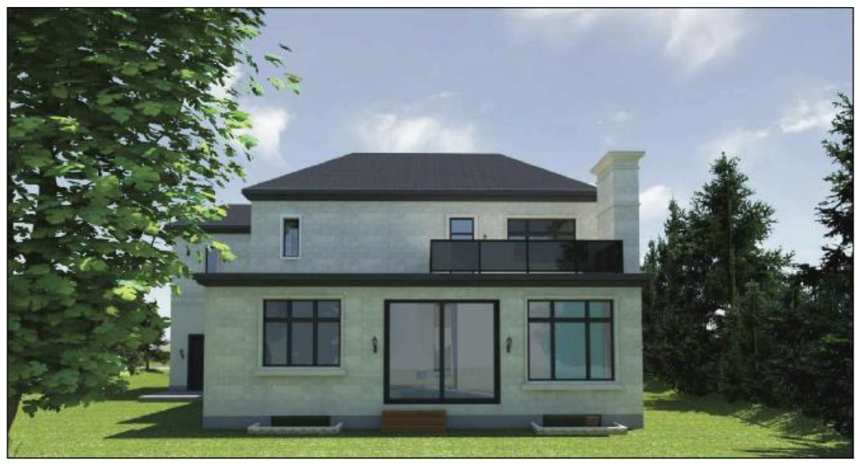
Figure 18: Rear elevation of the proposed development.