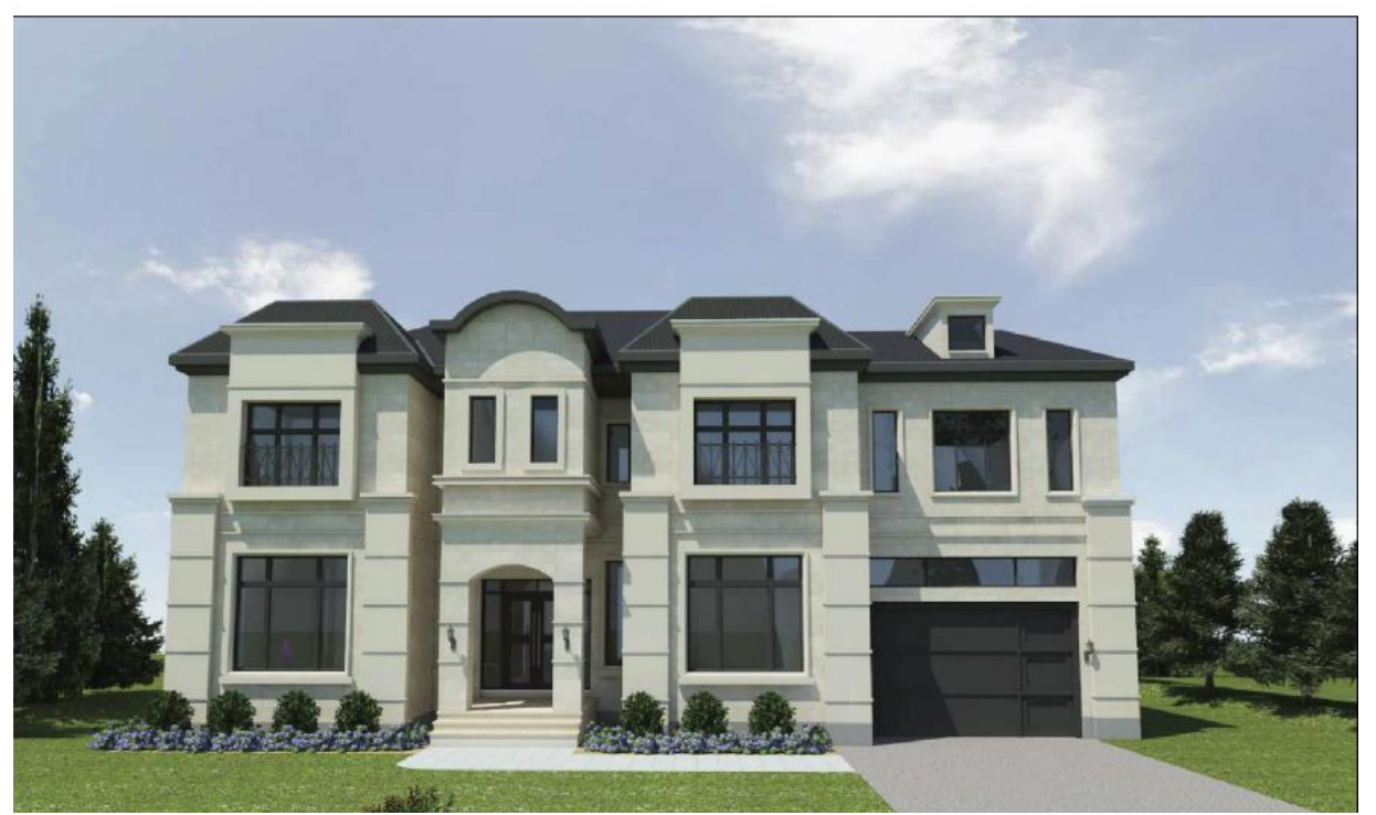
Figure 17: East front elevation of the proposed development.