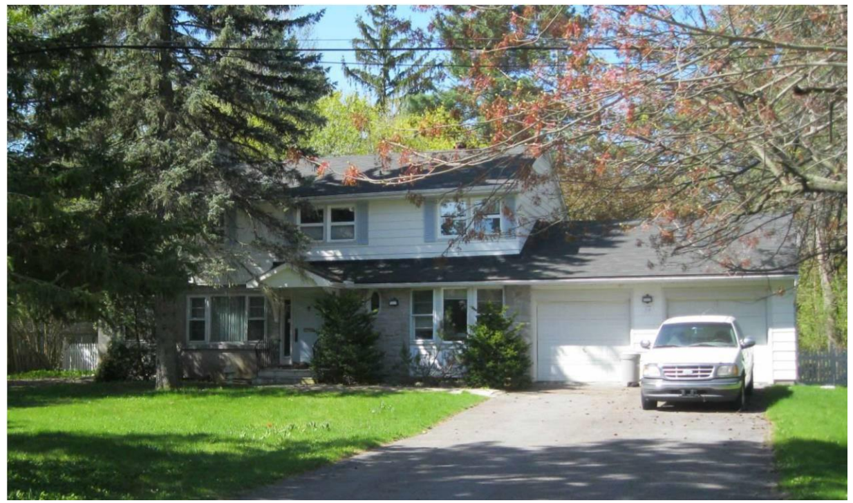
Figure 3: 2011 street view of the property. Note the double width asphalt driveway, flagstone path leading to the front door, open lawns, and the mature spruce (left) and maple tree (right).