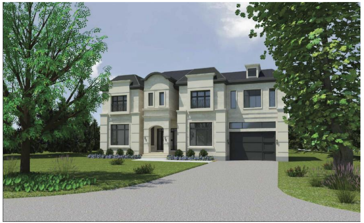
Figure 21: Rendered east front elevation as viewed from the street of the proposed development illustrating form, massing, and materials.