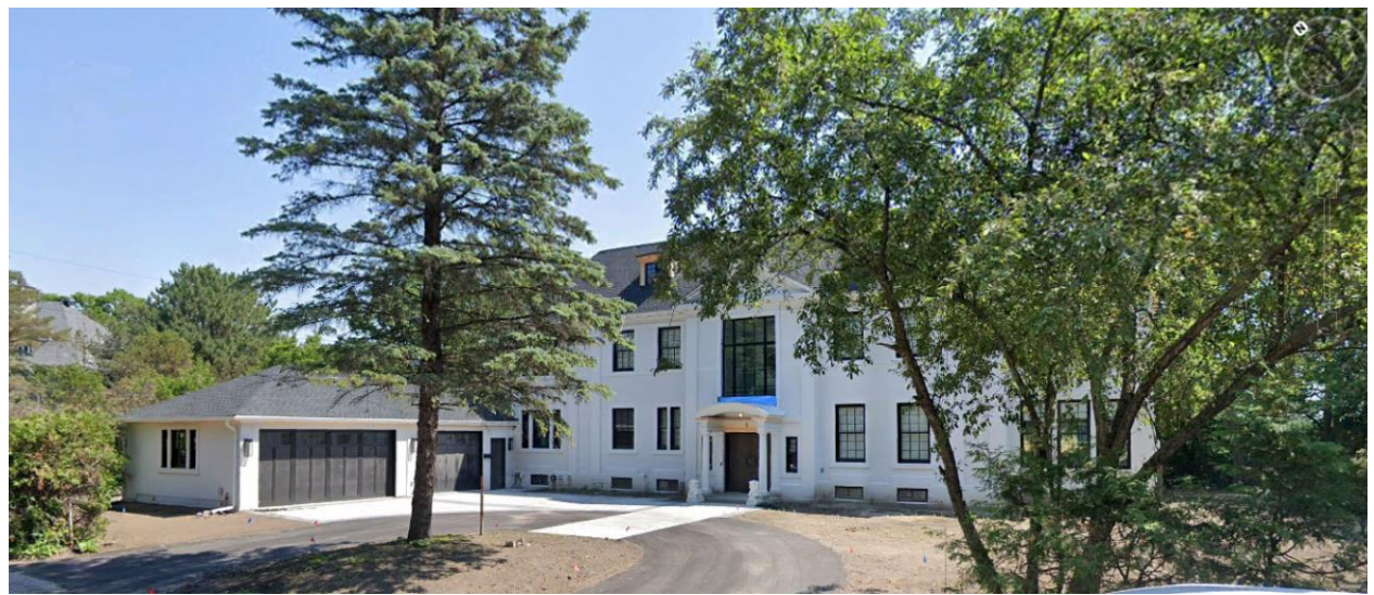
Figure 12: 2019 street view of 5 Crescent Road constructed circa 1925-27. The property is characterized as a Grade 1 heritage resource within the context of the RPHCD. The attached garage would appear to be a recent feature (HSF makes no reference to the garage as an addition and historic aerial views (1928, 1958, 1965) would appear to show a lawn with pathways in the area).

The property at 14 Crescent Road is characterized as a Grade II heritage property with Grade I properties to the south (10 Crescent Road constructed in 1950) and across the street (5 Crescent Road constructed circa 1925-27). The property at 16 Crescent Road to the north is an example of more recent infill development.