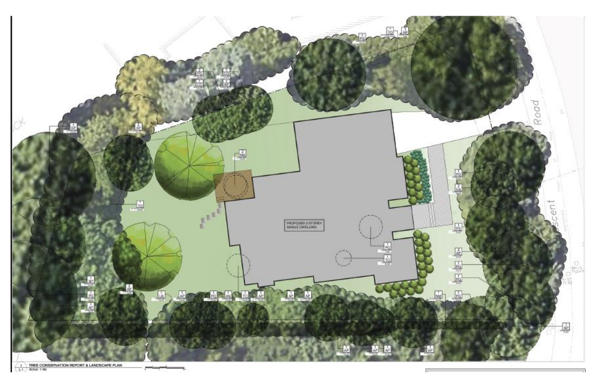
Figure 22: Rendered landscape and tree survey plan. The environmental category score is 70% for the existing streetscape. The landscape plan will retain mature trees, and the open lawn and setback consistent with neighbouring properties. Note the sense of enclosure the treed front and side yards provide and compare with the 1958 aerial (Figure 15).