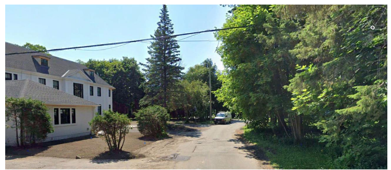
Figure 8: Street view looking south-east from the driveway of 14 Crescent Road (right). Note the informal street edge and landscape treatment at 5 Crescent Road (left) consisting of a lawn with shrubs and a mature white spruce. Overgrown trees and shrubs characterizes the lot boundaries at 14 Crescent Road (right).