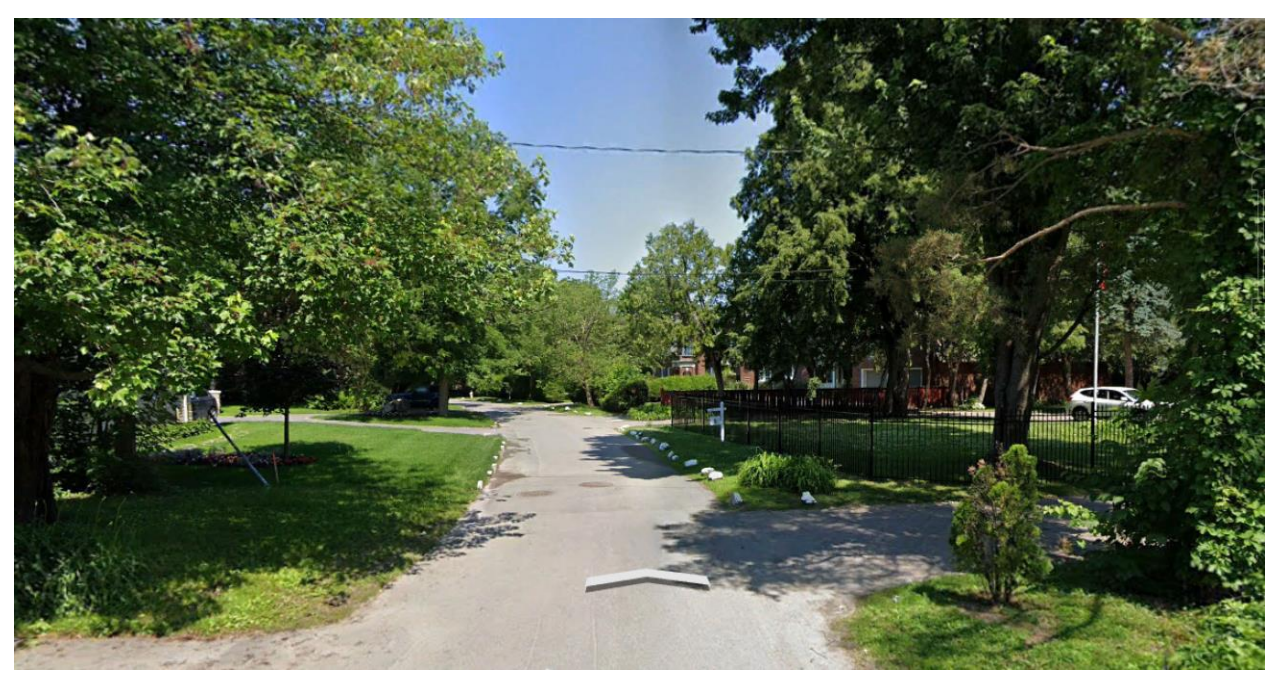
Figure 9: Street view looking north-west from 14 Crescent Road (lower left). Note the informal street edge with lawns extending to the street edge with specimen trees and shrubs.