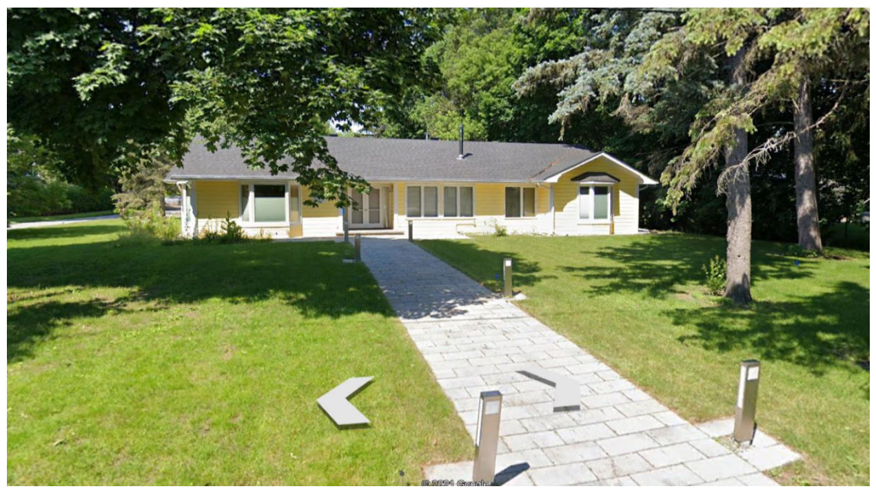
Figure 11: Street view of 10 Crescent Road to the south of the development site with a residence contemporaneous in design to 14 Crescent Road. The property is a Grade I heritage resource within the context of the Rockcliffe Park HCD. The house and landscape was rehabilitated in 1991. Compare with Figure 9.