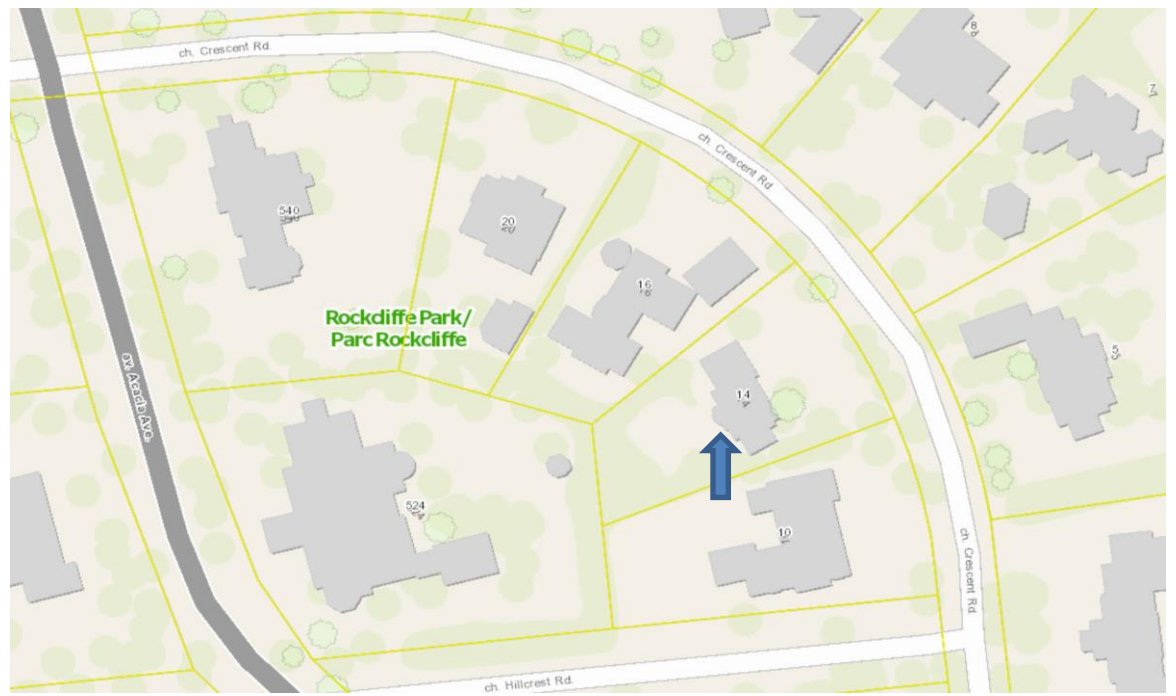
Figure 2: Block plan illustrating the built context surrounding the development site. Note the placement of the garages in the front yards of the properties at 16 Crescent Road to the north and 5 Crescent Road across the street from the development site.

Figure 1: Aerial view illustrating the built and landscape context within the block and adjacent to the development site – 14 Crescent Road. Note the overgrown, soft landscape encircling the side and rear yards of the lot. Site arrowed, north top of image.