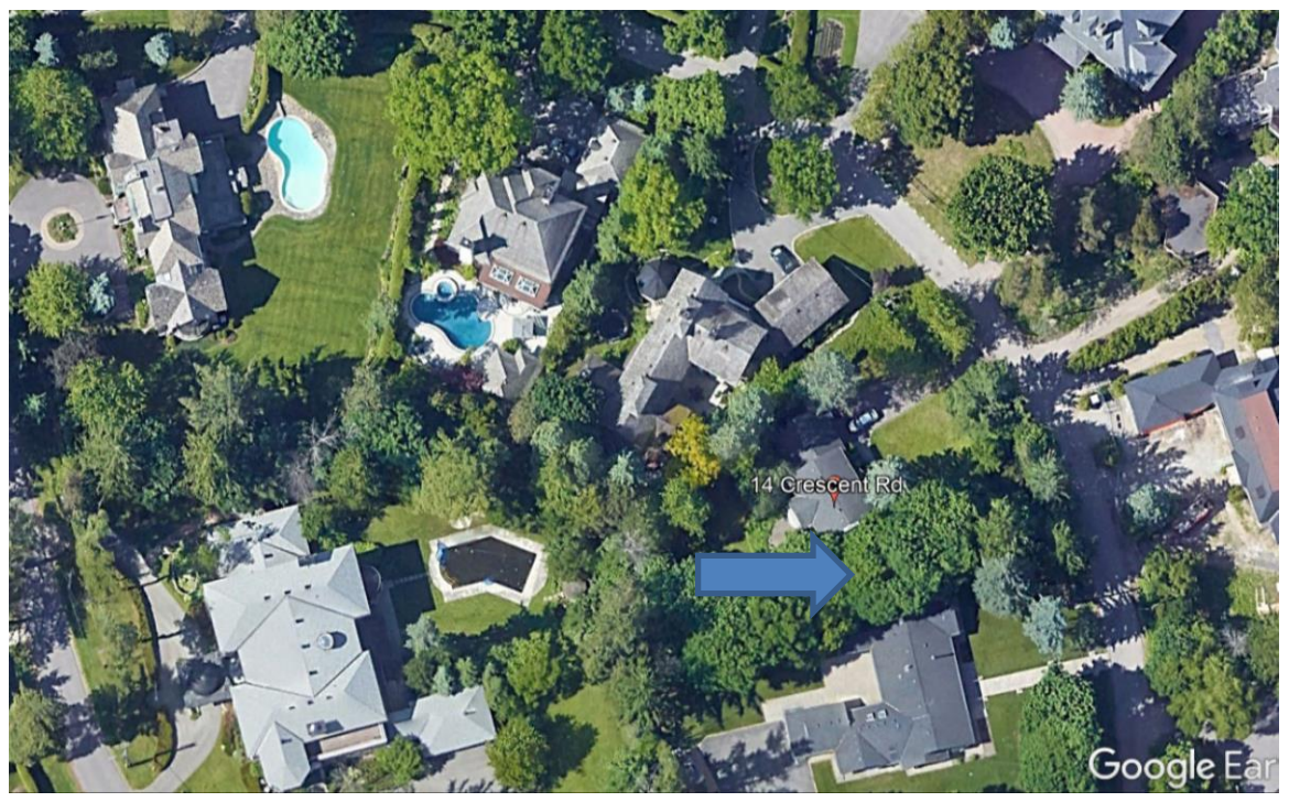
Figure 1: Aerial view illustrating the built and landscape context within the block and adjacent to the development site – 14 Crescent Road. Note the overgrown, soft landscape encircling the side and rear yards of the lot. Site arrowed, north top of image.