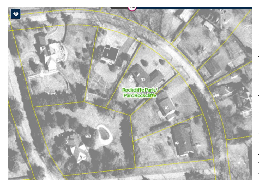
Figure 15: 1958 Aerial of the lots on the inner curve of the crescent. Note the attached garage in the front yard of 16 to the north of 14 Crescent Road a feature that remains. Note the car sitting in front of 10 Crescent Road to the south of the development site. Note the treed edge in the right-of-way in front of 10 and 14 Crescent Road featuring trees and shrubs enclosing the properties.

The heritage survey and evaluation form for 14 Crescent Road completed in 2011 and updated in 2021 provides additional information that is summarized below: