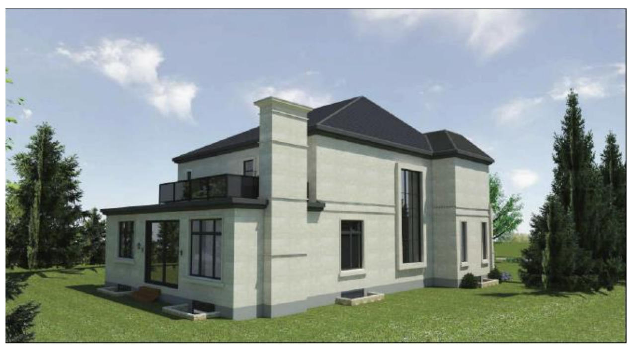
Figure 20: South side elevation (South -west Elevation) of the proposed development.