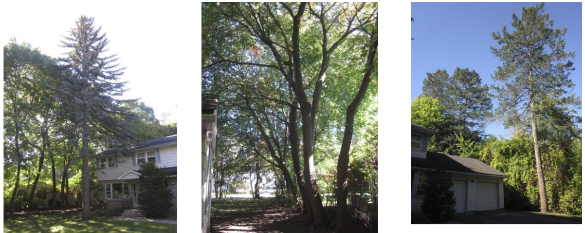
Figure 4: Tree inventory – tree #35 Colorado Spruce & trees #23-28. Source IFS Associates. 2022 Figure 5: Tree inventory – trees # 23 -32. Source IFS Associates. 2022 Figure 6: Tree inventory – trees # 2 & 3 right and upper part of 4,6,7 & 8 Source IFS Associates. 2022