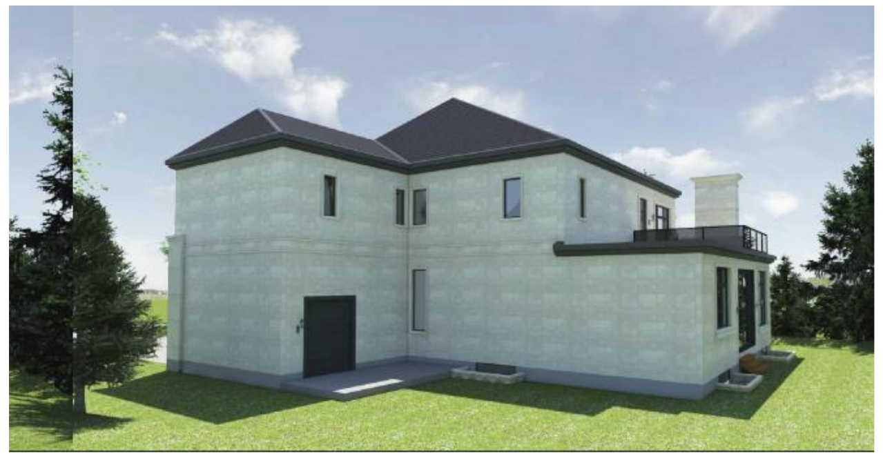
Figure 19: Side Elevation (north-west elevation) illustrating the proposed development. Source: SDG Designs August 2022.