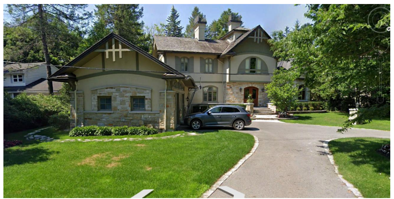
Figure 10: Street view of 16 Crescent Road next to 14 Crescent Road whose roof is visible to the left of the image. The property is an example of recent infill development. The placement of the garage in the front yard of the property and the semi-circular driveway are common features of properties along the crescent.