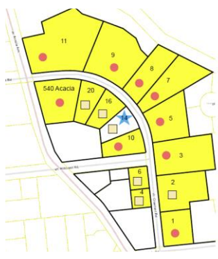
Figure 14: Grade II Buildings are noted on the key plan in beige. A blue star denotes 14 Crescent Road.