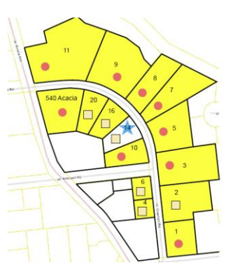
Figure 13: Grade I Buildings are noted on the key plan in red.