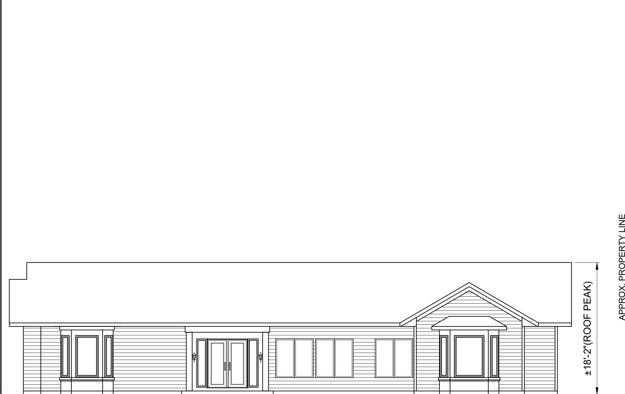
10 CRESCENT RD. EXISTING