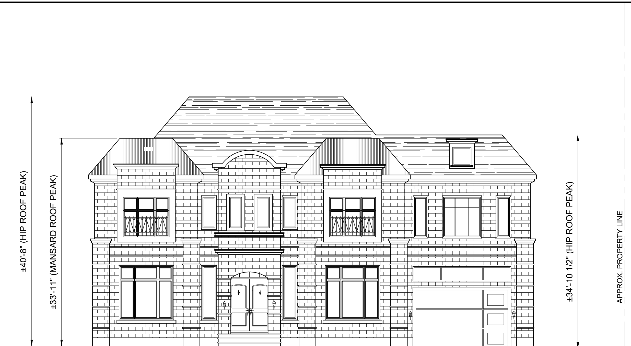
14 CRESCENT RD. PROPOSED