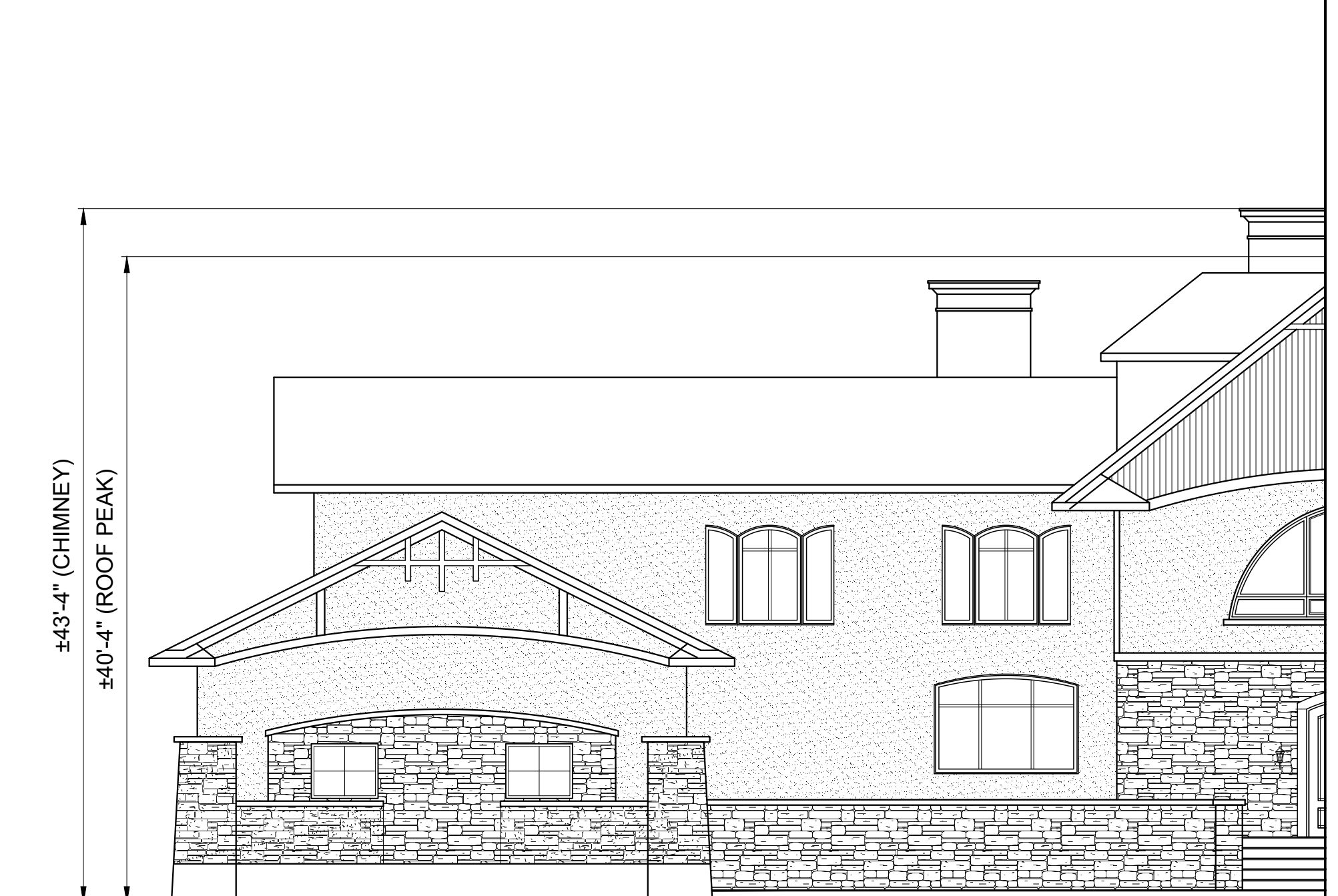
16 CRESCENT RD. EXISTING

NOTE: EXISTING WINDOWS, DOORS AND EXTERIOR FINISHES MAY NOT BE EXACTLY AS SHOWN.