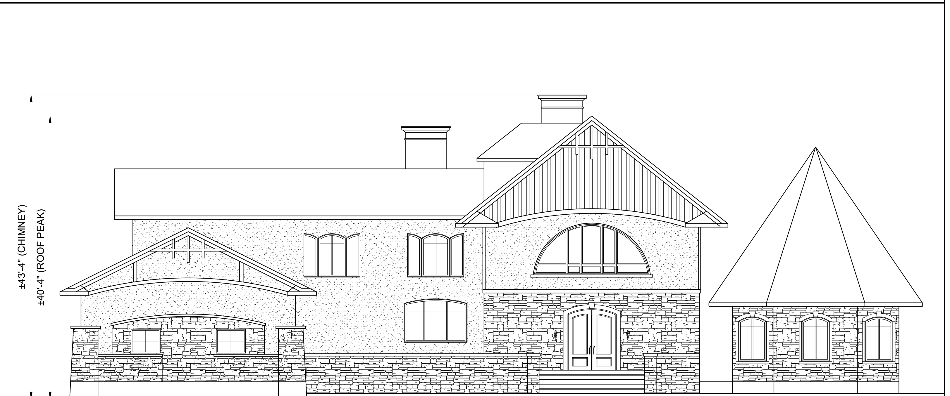
16 CRESCENT RD. EXISTING