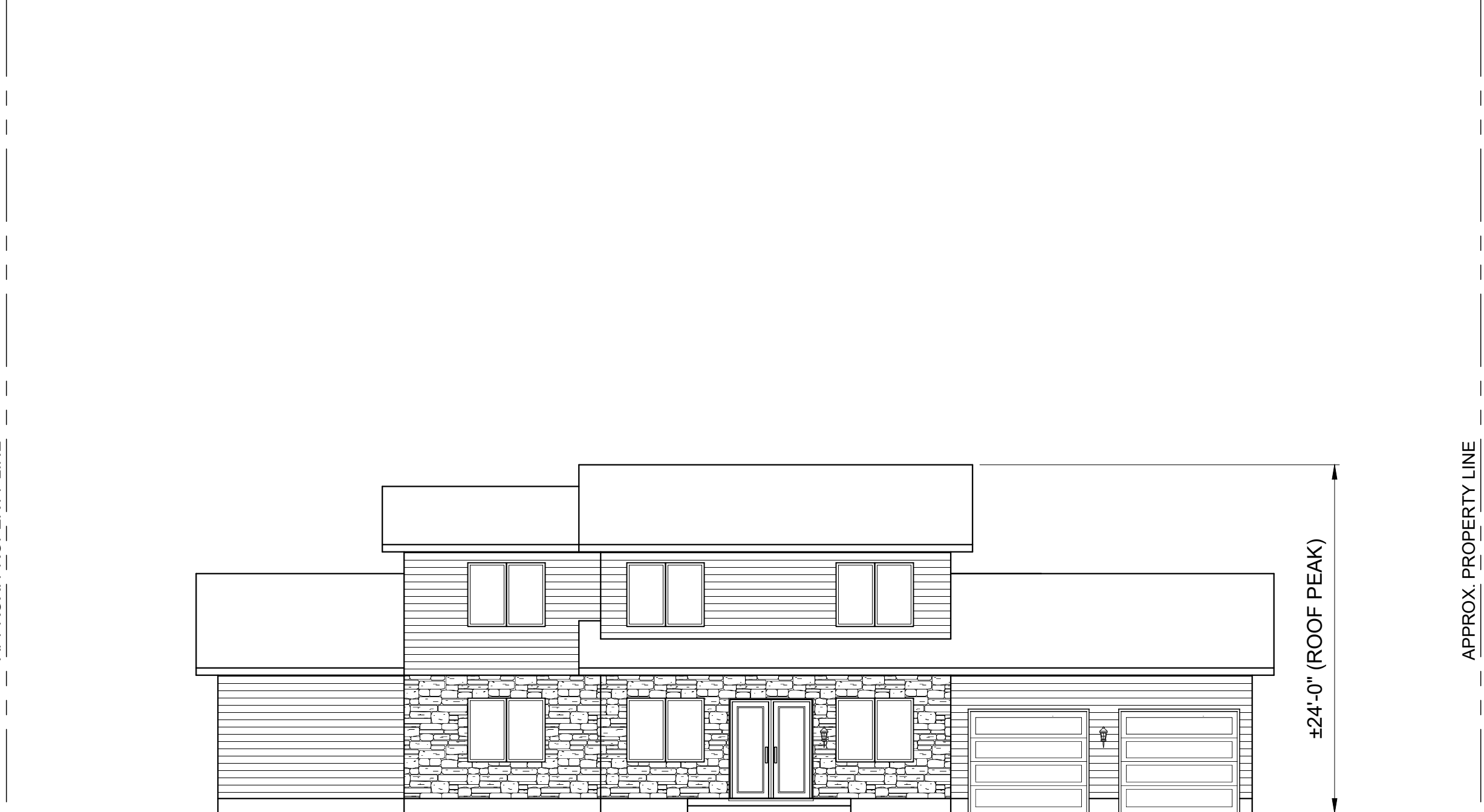
14 CRESCENT RD. EXISTING