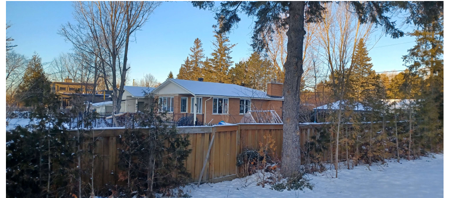
South West elevation