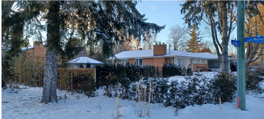
South East elevation