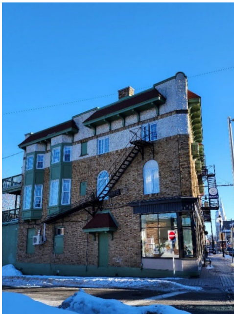
View of West facade along Carruthers Avenue