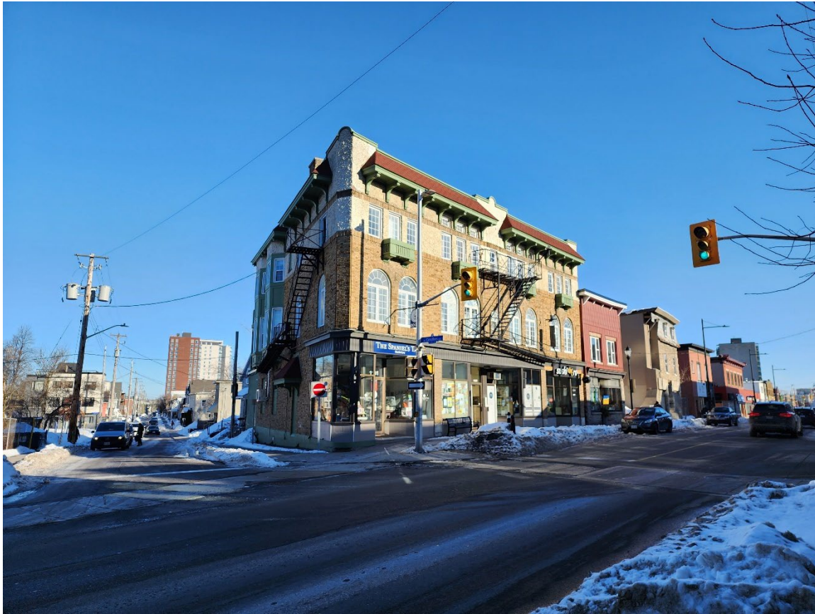
View from South side of Wellington Street West at Carruthers Avenue