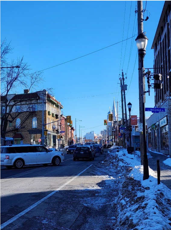
View looking East along Wellington St West