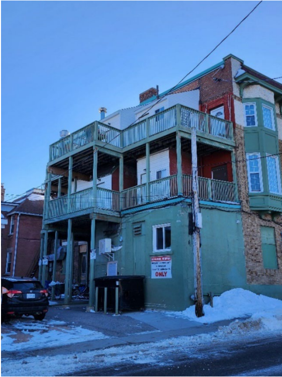
Rear (North) façade