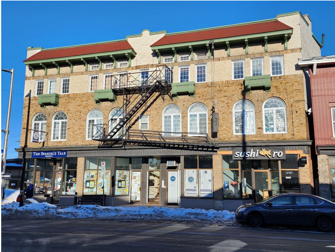
Front (South) façade