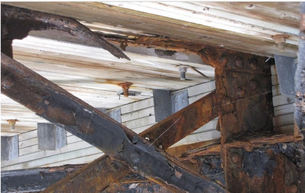
Structural steel elements below deck show medium to very severe corrosion