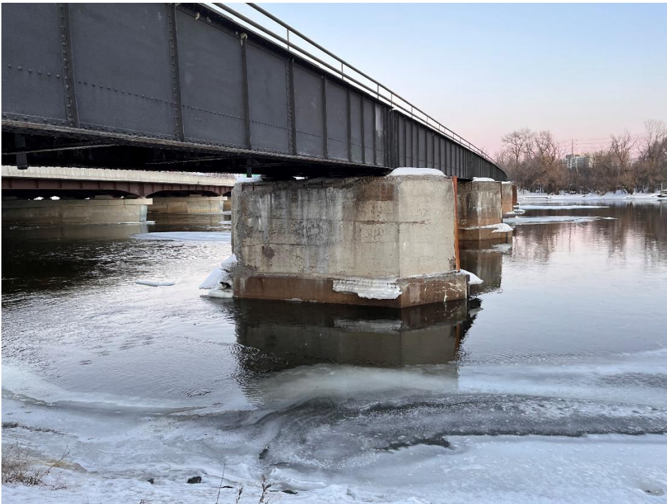
Photos of the bridge looking east