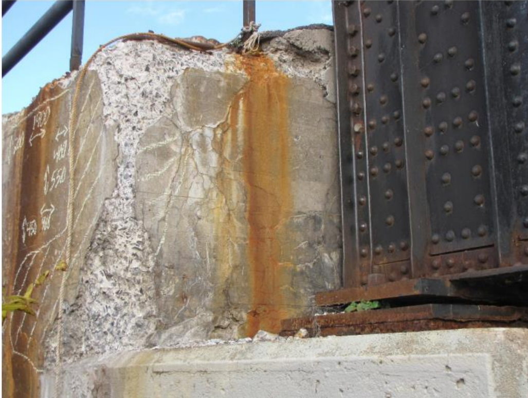
Abutments and piers exhibit severe to very severe delamination and disintegration of concrete encasement