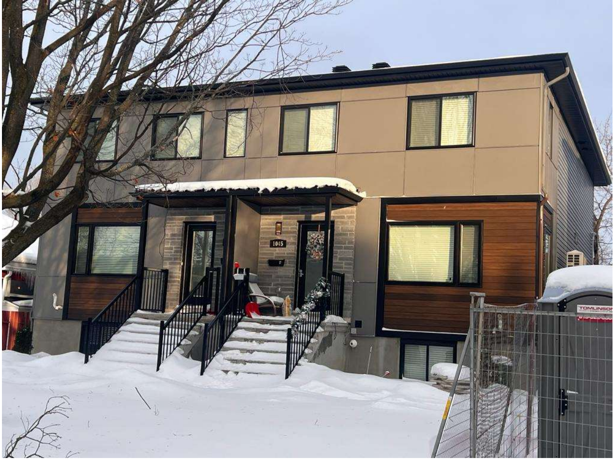
Figure 3- Recently Completed Semi-Detached Dwelling 1043/1045 Secord Avenue (R3A Zoning)