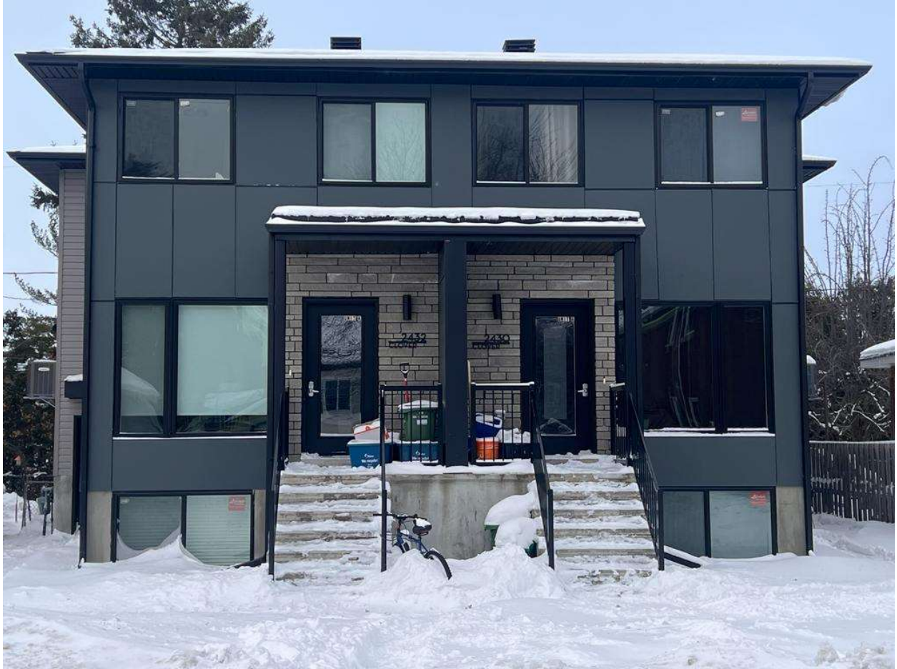
Figure 2- Recently Completed Semi-Detached Dwelling 2430/2432 Clover Street (R3A Zoning)