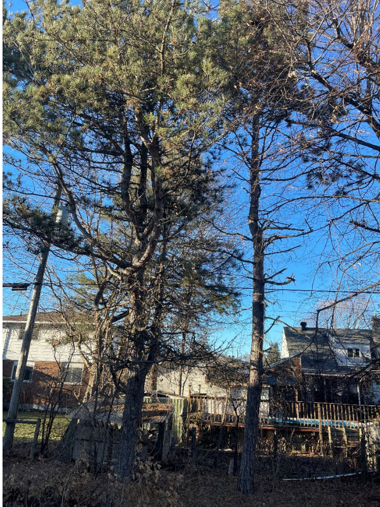
Figure 2 - Trees 4 (left) and 5 (right) – joint Austrian and Scots pine to be retained