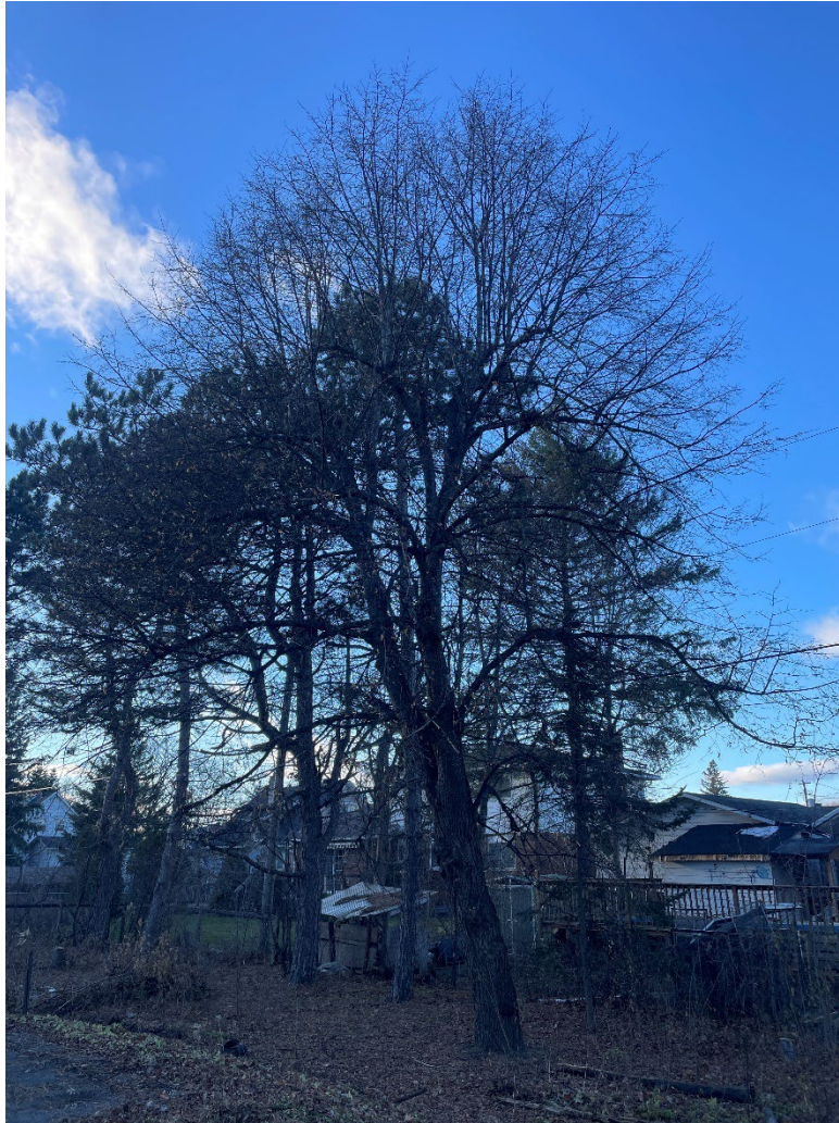
Figure 3 - Tree 6: private linden to be removed