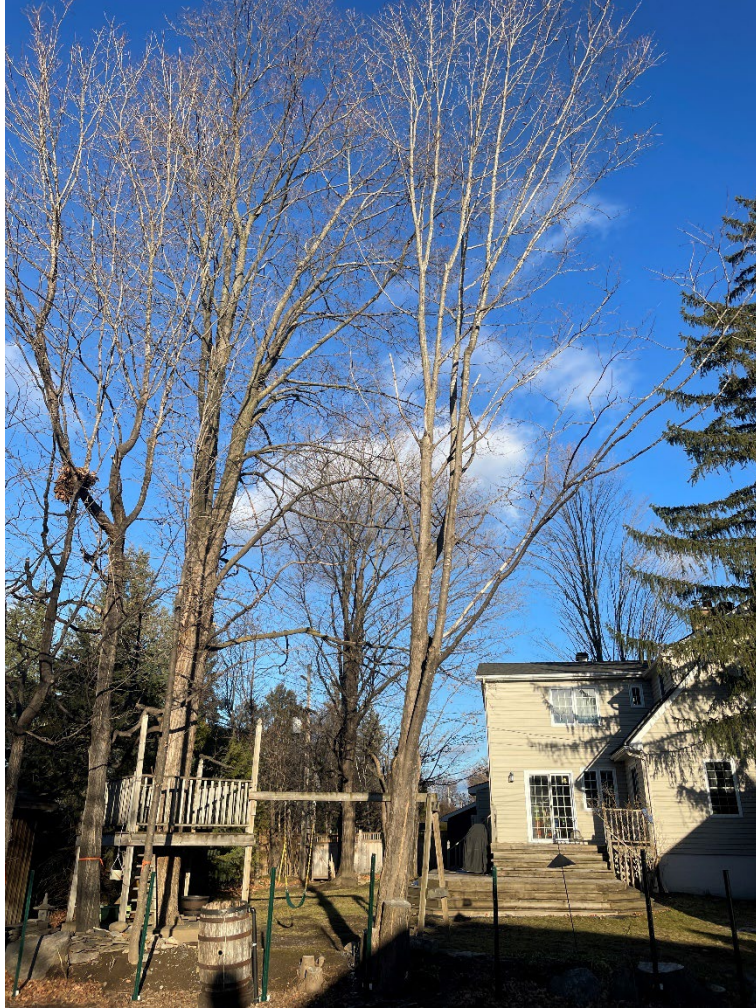
Figure 4 - Tree 7: boundary maple to be removed