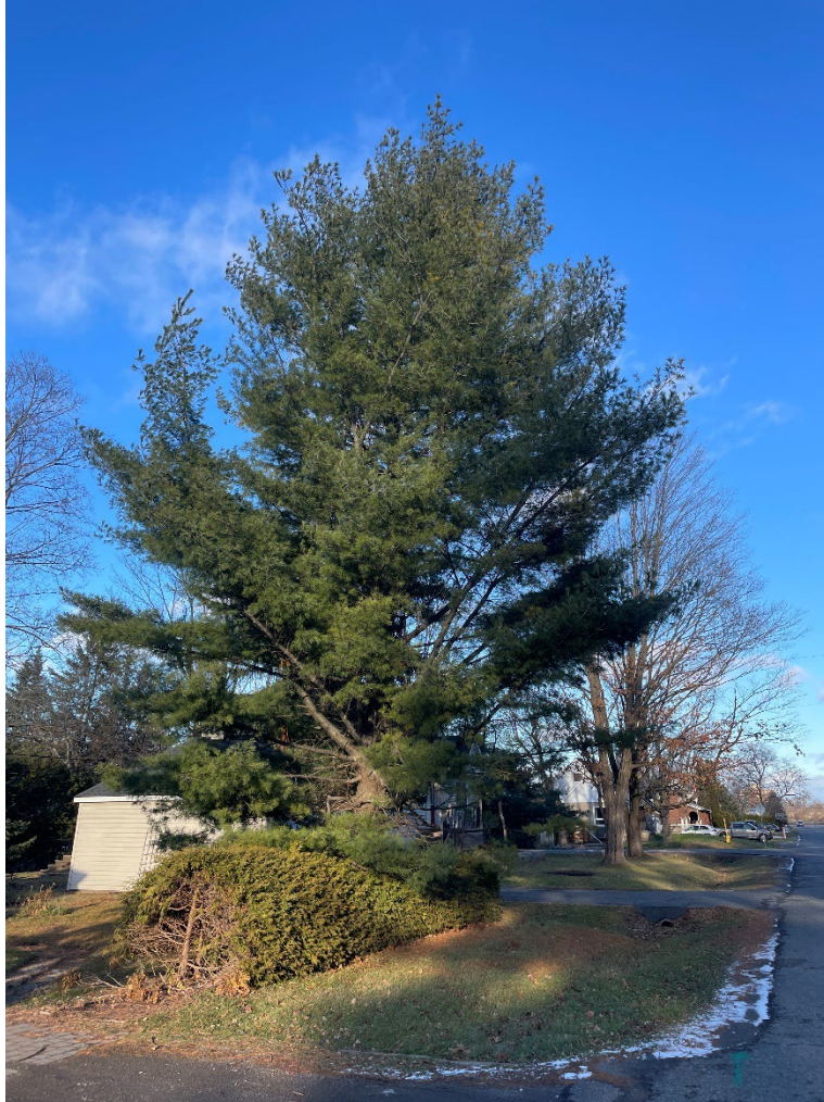
Figure 5 - Tree 8: Private white pine to be retained