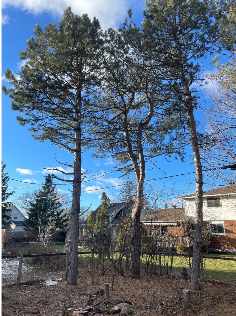
Figure 1 - Trees 1-3 (left to right), Austrian and Scots pine – to be retained