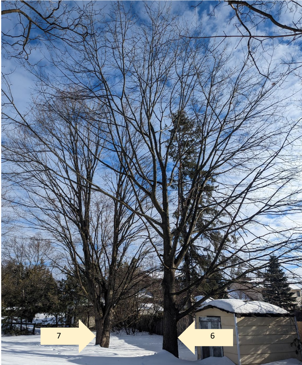
Figure 4 - Tree 6 and 7 (indicated with arrows): private oak and maple to be retained