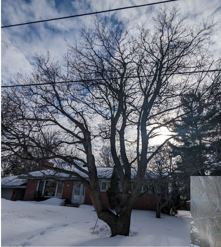
Figure 1 - (Above) Tree 1: private Norway maple to be removed (Right) Crack on main stem of Tree 1