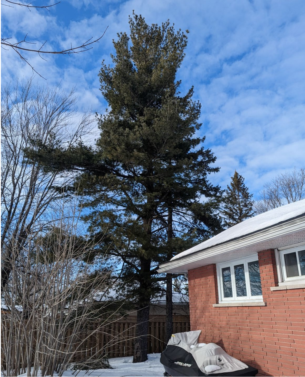
Figure 2 - Tree 3: private white pine to be removed