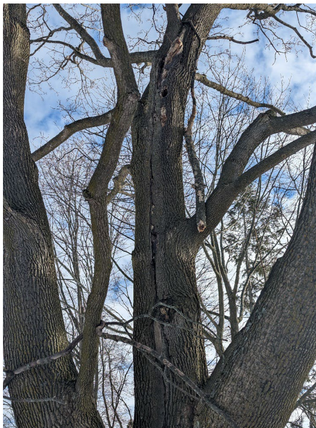
Figure 3 - Tree 4: Norway maple to be removed (Clockwise from bottom left): Decay in scaffold branch; canker at main union; crack in scaffold branch