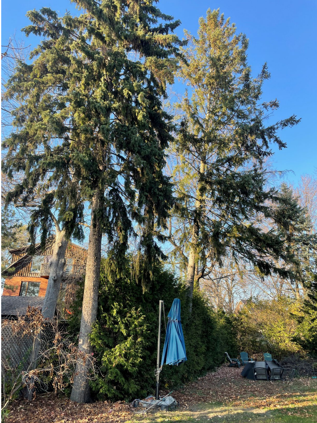
Figure 3: Trees 3 (front), white spruce to be retained, and tree 4 (behind), white spruce to be removed