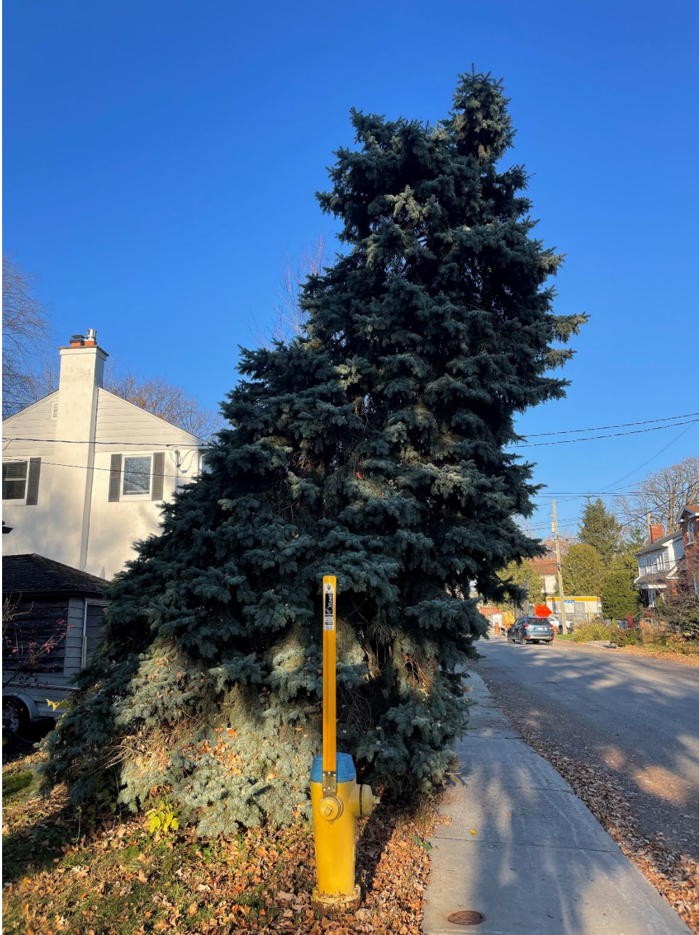
Figure 5: Tree 9, Colorado blue spruce to be removed