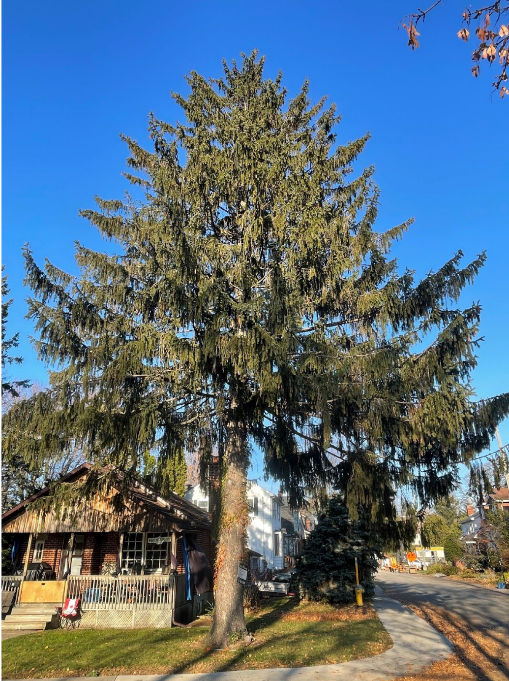
Figure 1: Tree 1, Norway spruce to be retained