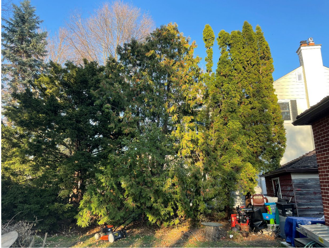
Figure 4: row of cedars at rear of property to be removed, trees 6-8 (from right to left)