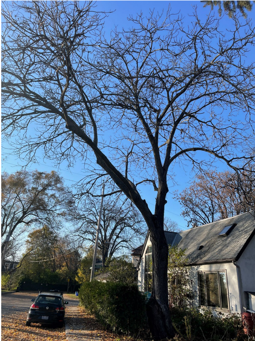
Figure 2: Tree 2, butternut tree on adjacent property at 35 Wendover