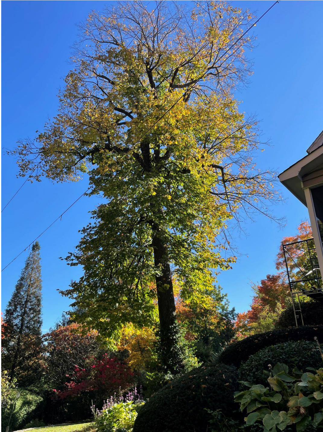
Figure 2: Tree 22, large basswood tree in the rear yard, pruning and aerial inspection recommended