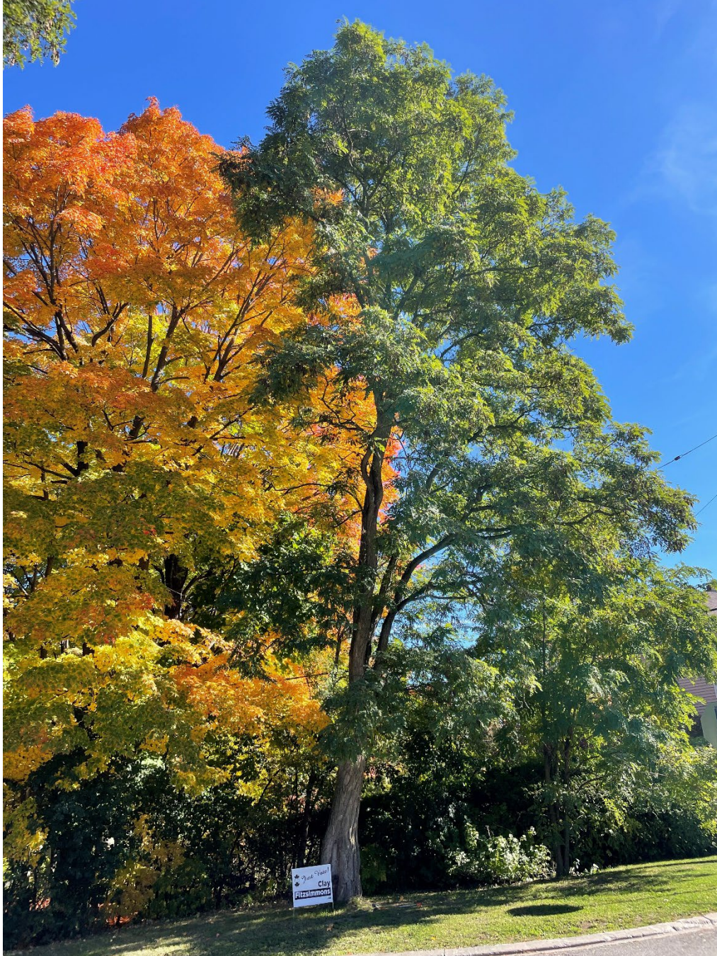
Figure 1: Tree 1, city owned black locust with a slight lean towards the road