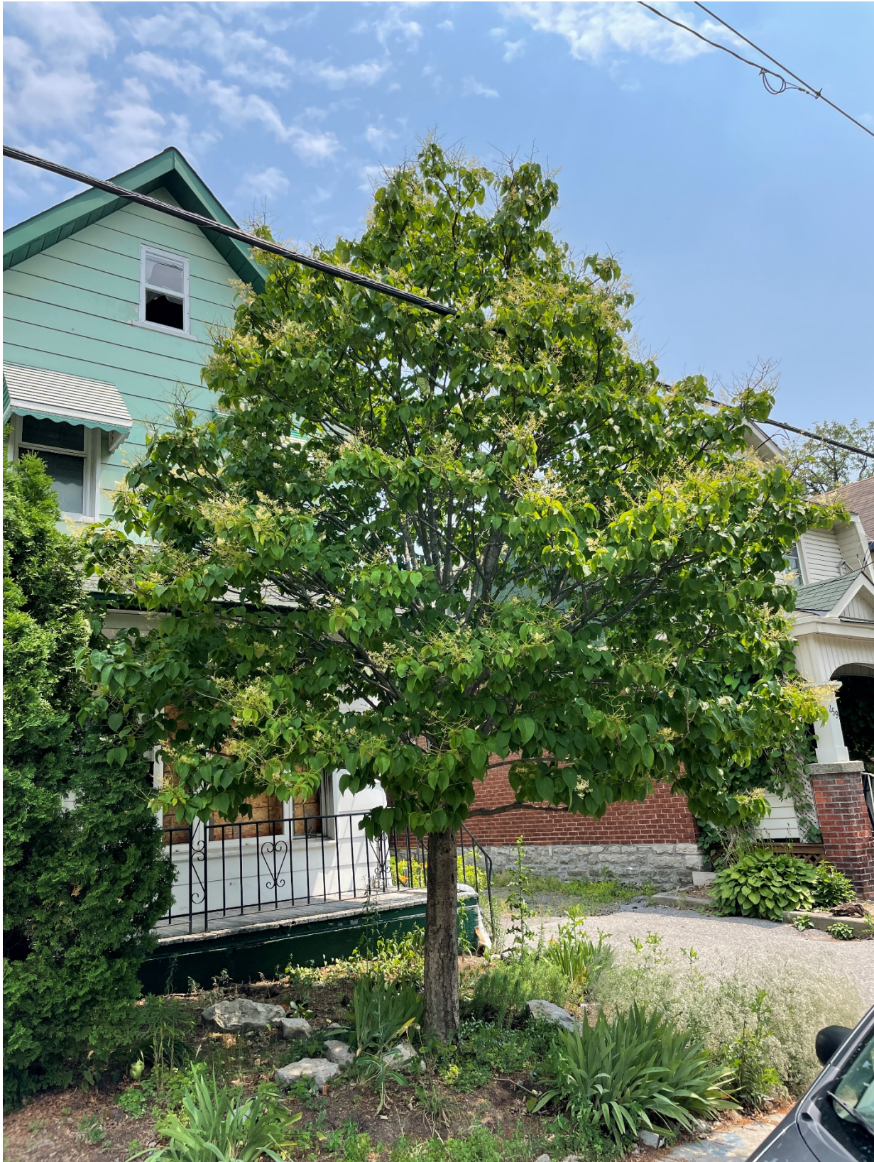
Figure 1: City owned Japanese lilac to be removed