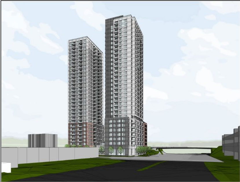
VIEW SOUTH FROM ST LAURENT