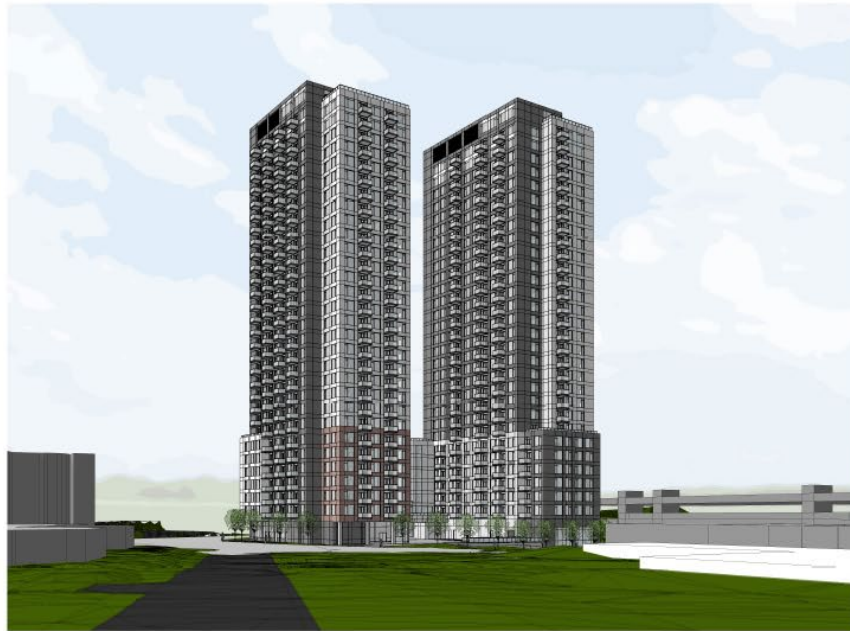
VIEW SOUTH FROM JOSEPH CYR