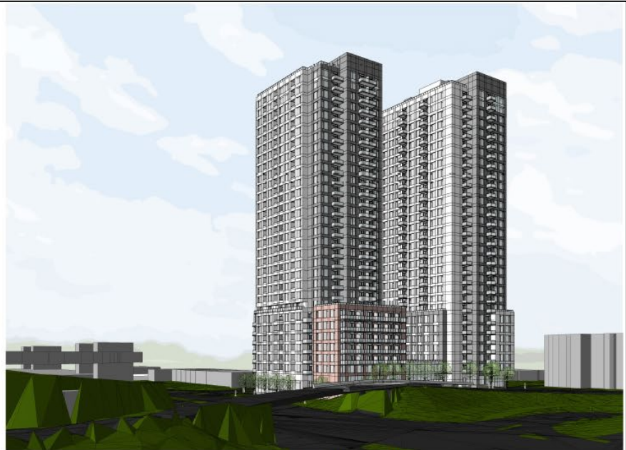
VIEW NORTH FROM THE QUEENSWAY