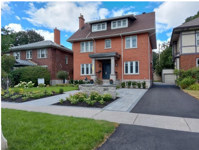
Figure 2 Site review by Planning Staff on September 3, 2021

Staff site visits of September, 2021 and June 1, 2023 confirmed that the parked vehicle will be visible from the street, which is contrary to the intent of the Zoning By-law. (see Figure 2).