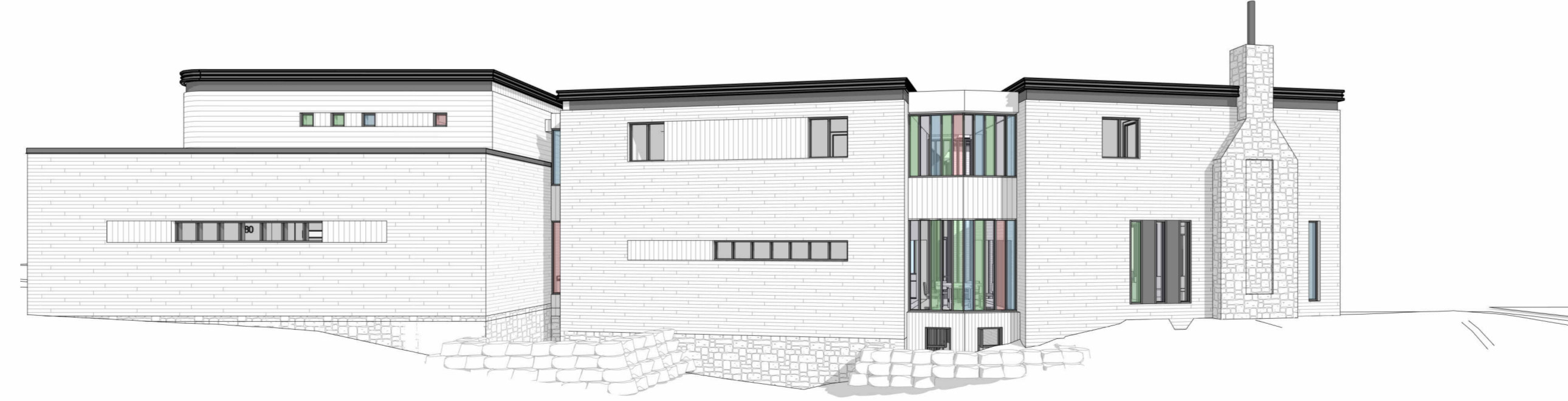
SOUTH ELEVATION PERSPECTIVE - MIDDLE