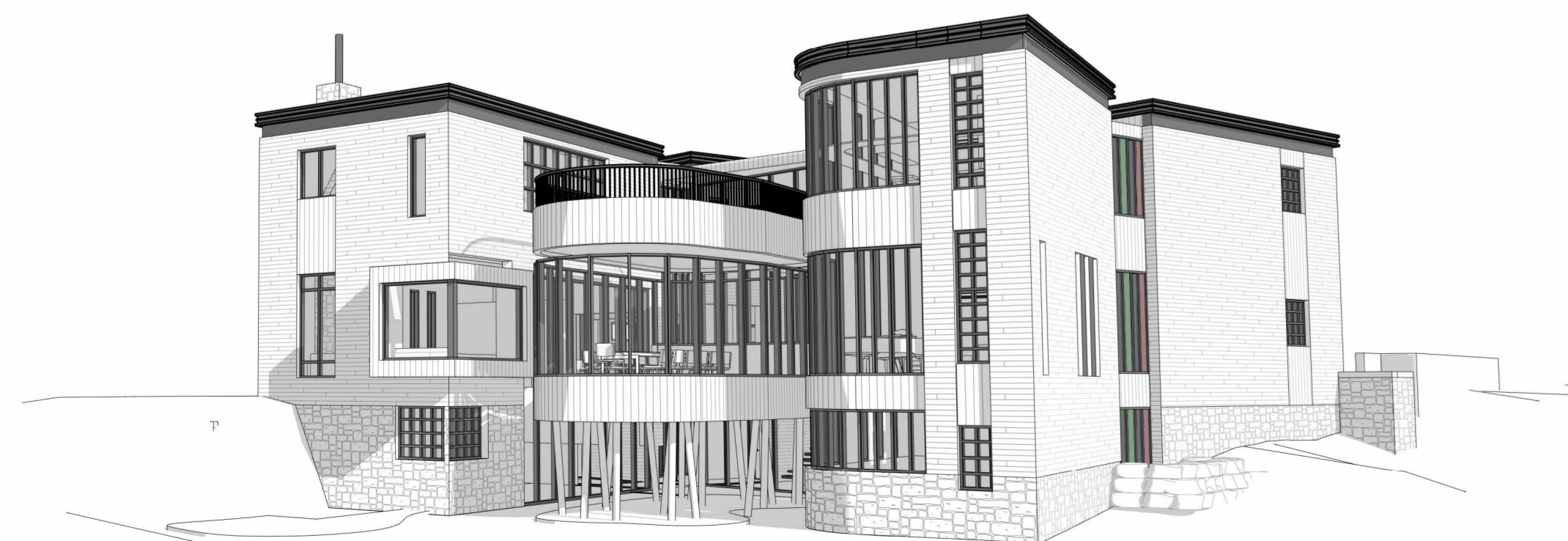
NORTH ELEVATION PERSPECTIVE - LEFT