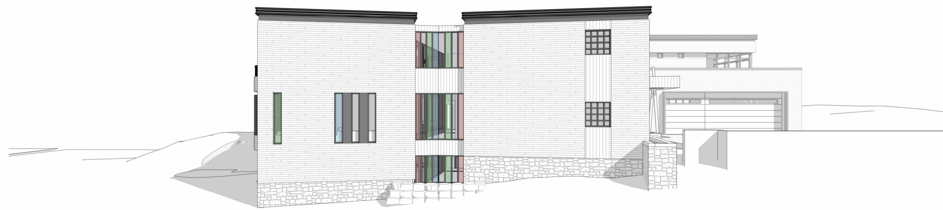
NORTH ELEVATION PERSPECTIVE - MIDDLE