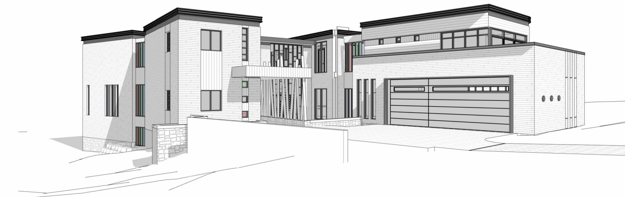
NORTH ELEVATION PERSPECTIVE - RIGHT