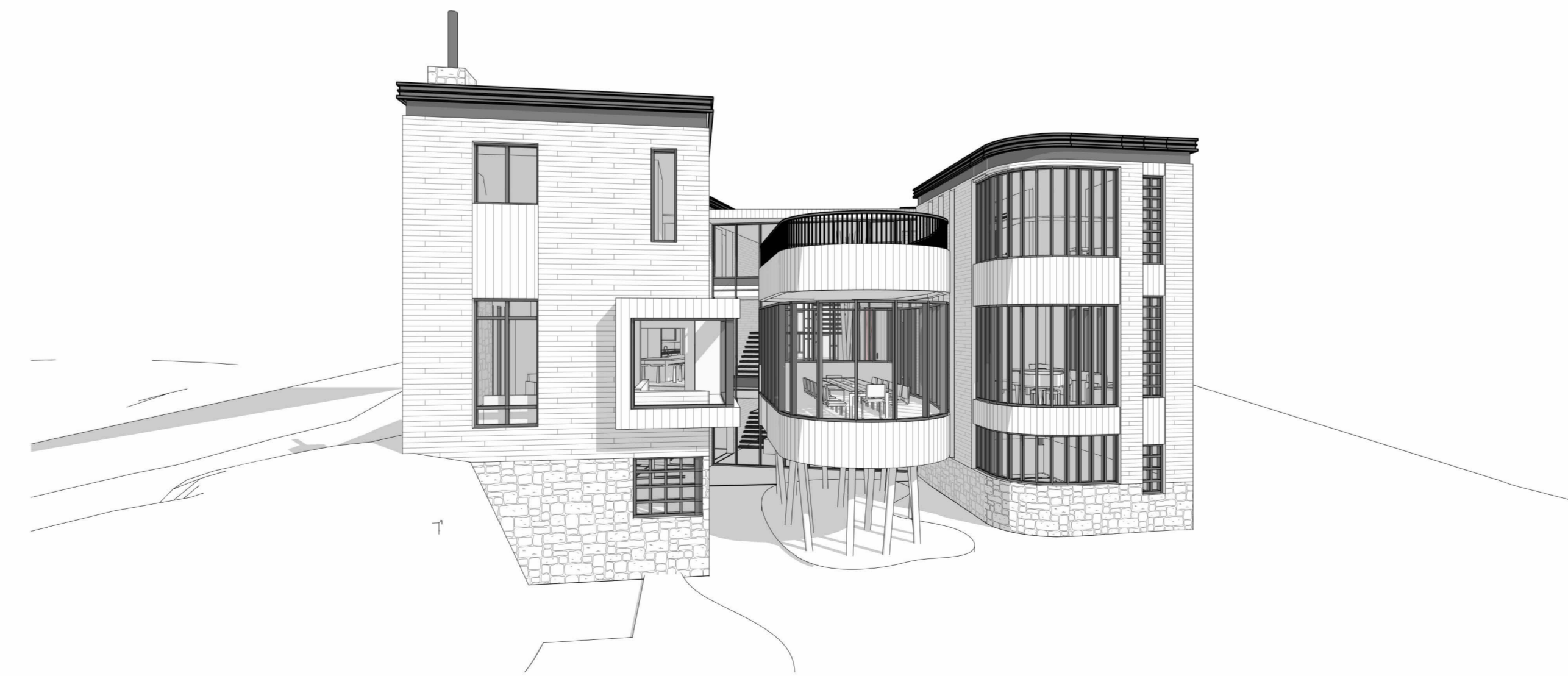
EAST ELEVATION PERSPECTIVE - MIDDLE