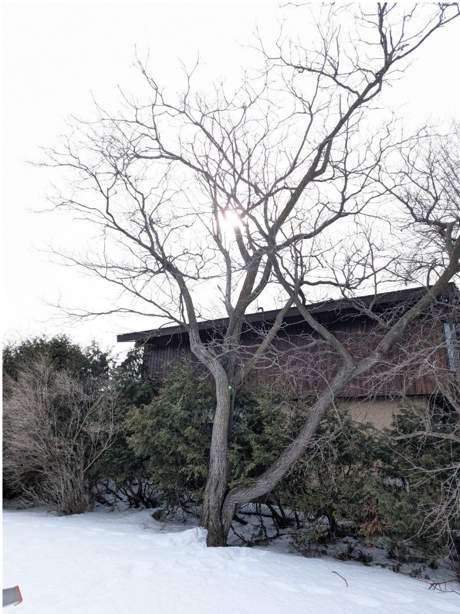
Figure 3 - Tree 4: private butternut to be removed.