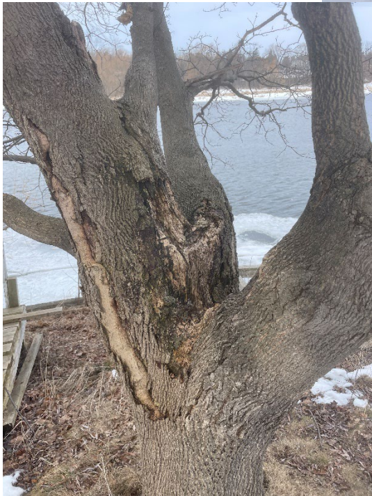
Figure 1 - (Above) Tree 2: private Norway maple to be retained. (Left) Canker on Tree 2