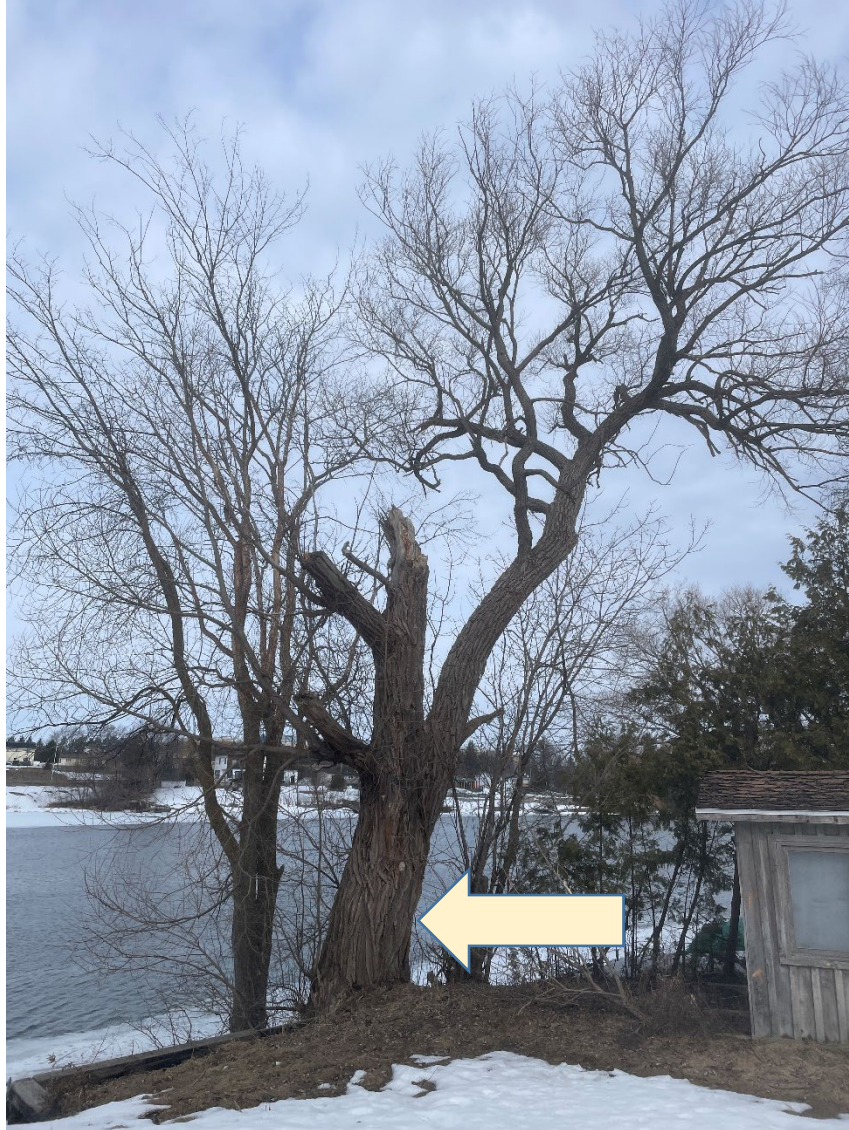
Figure 2 - Tree 5 (Right): private willow to be retained.