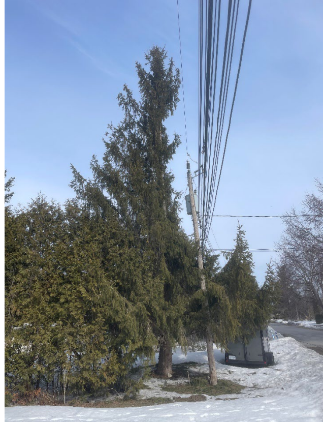
Figure 4 - Tree 8: Adjacent Norway spruce to be retained and protected.