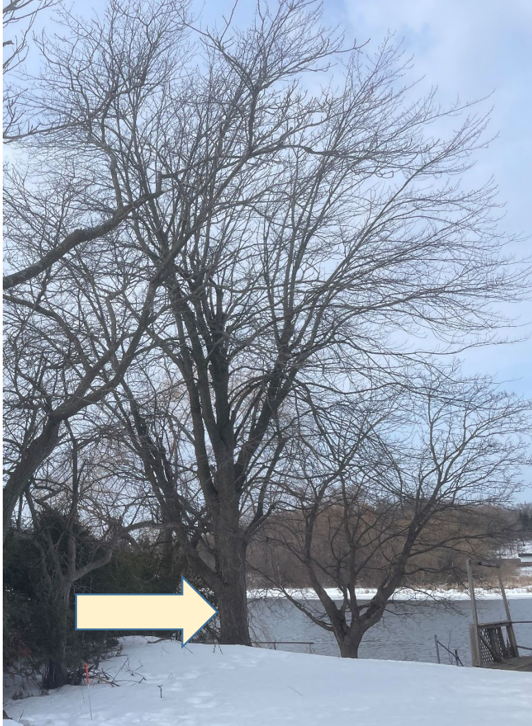
Figure 6 - Tree 3: private maple to be retained and protected.