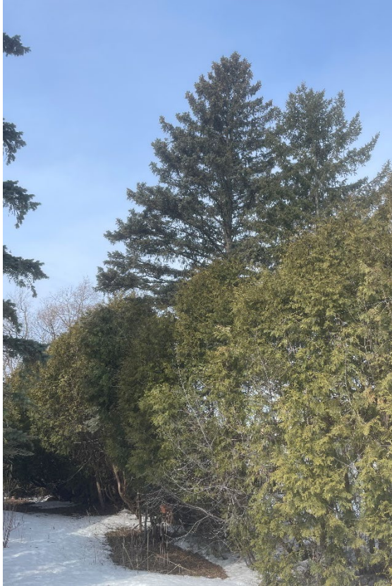
Figure 5 - Tree 7: adjacent Colorado spruce to be retained and protected.