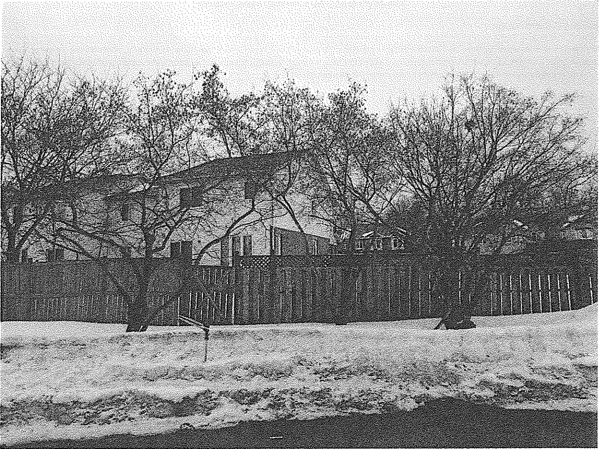
Figure 3 (From Left to Right) - Tree 7: city amur maple to be retained. Tree 6: City Amur maple to be retained. Tree 5: City Amur maple to be removed.