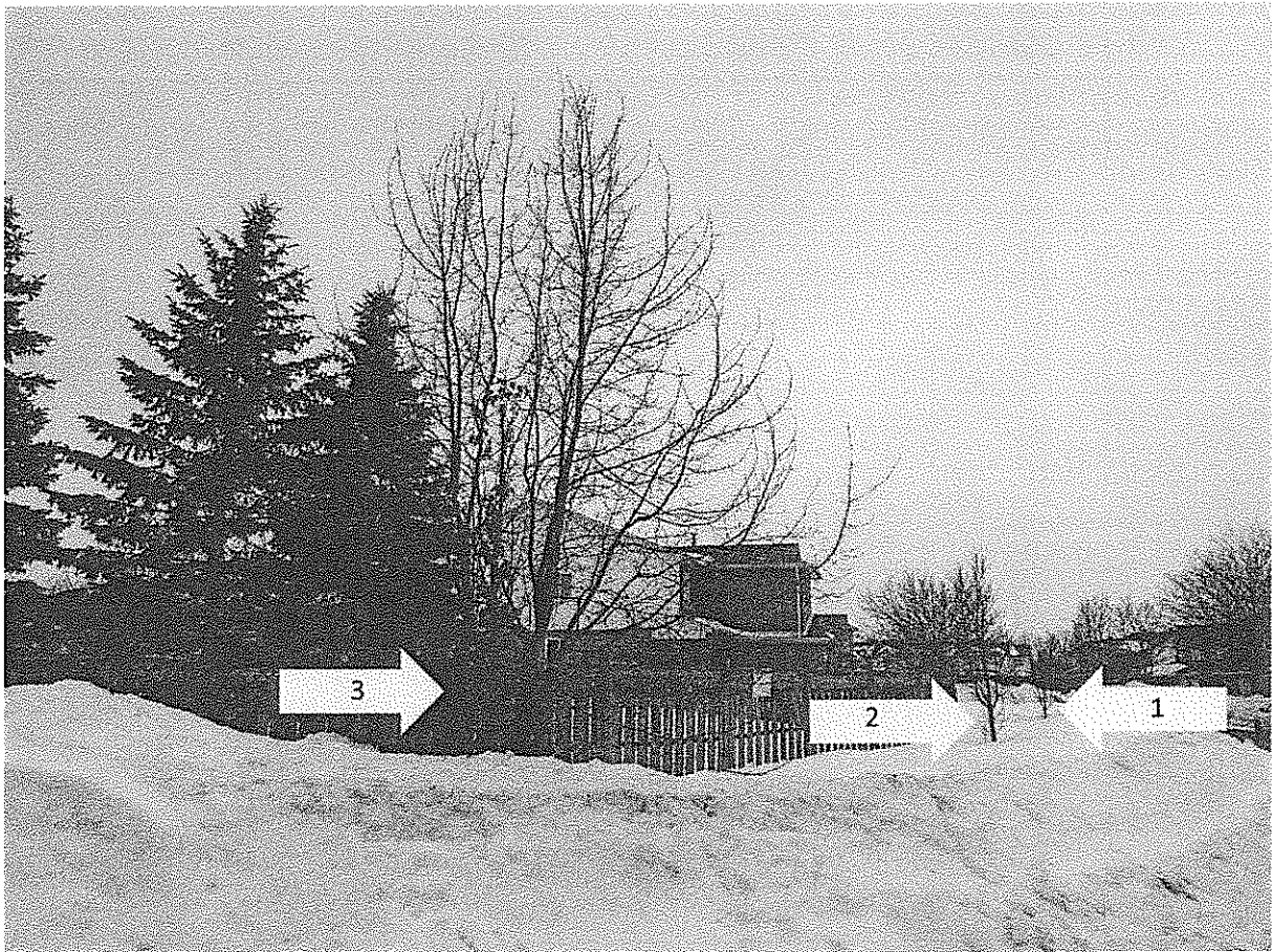
Figure 1 - (indicated with arrows) Tree 1: city lilac to be retained. Tree 2: city pear to be removed. Tree 3: city English oak to be retained.