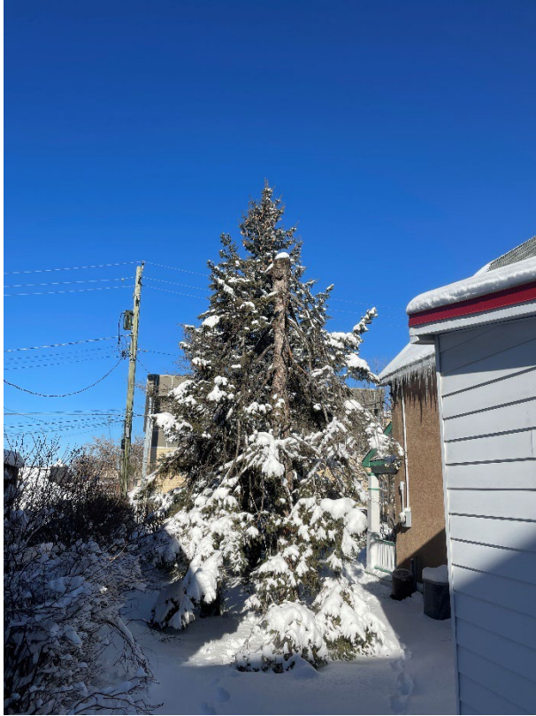
Figure 1; tree 1 (behind) and tree 1 (front), Colorado spruce to be removed