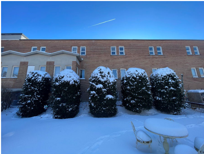
Figure 2: Line of cedar bushes that are well maintained and retainable.