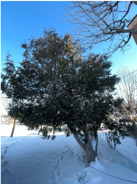
Figure 4: Tree 4, eastern white cedar to be removed.