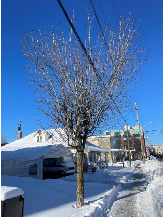
Figure 3: City owned sugar maple to be removed