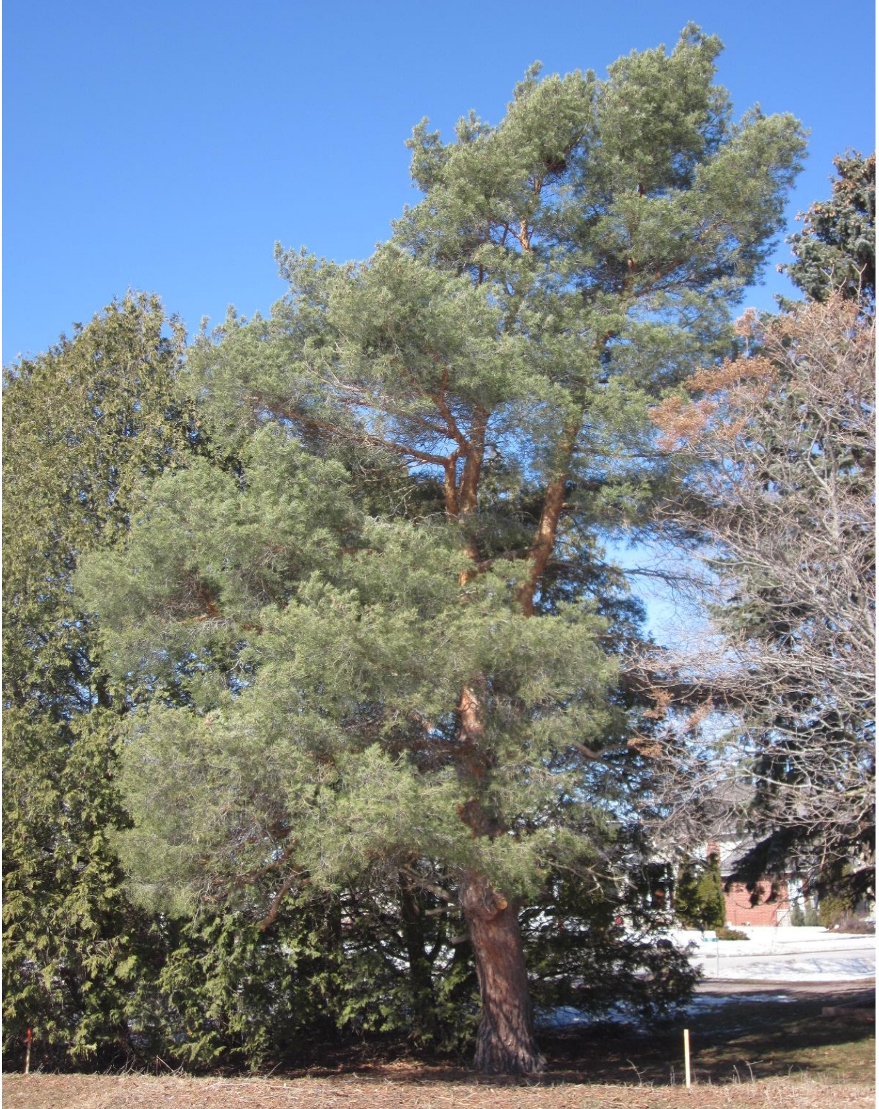
Picture 2. Scots pine (tree #3) on neighbouring private property adjacent to 131 Winding Way (photograph taken March 2021)