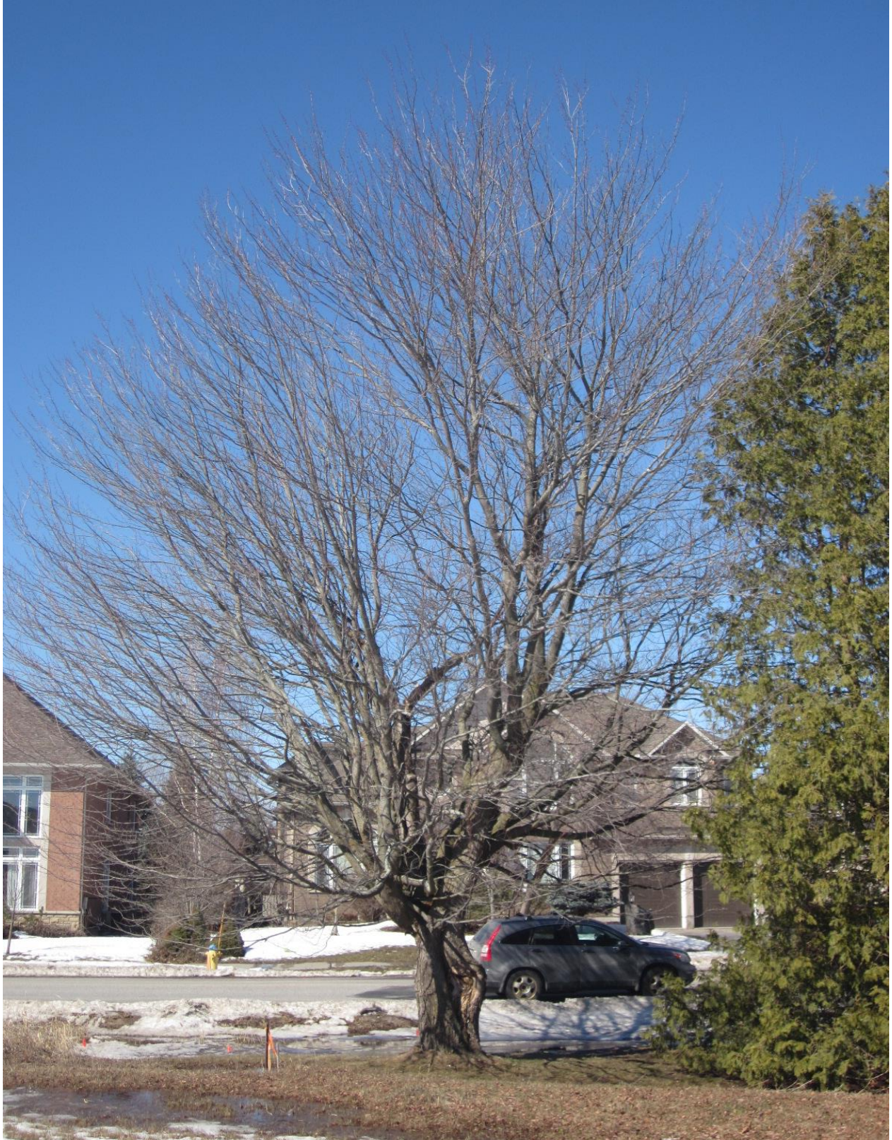
Picture 1. Red maple (tree #2) on City property adjacent to 131 Winding Way (photograph taken March 2021)