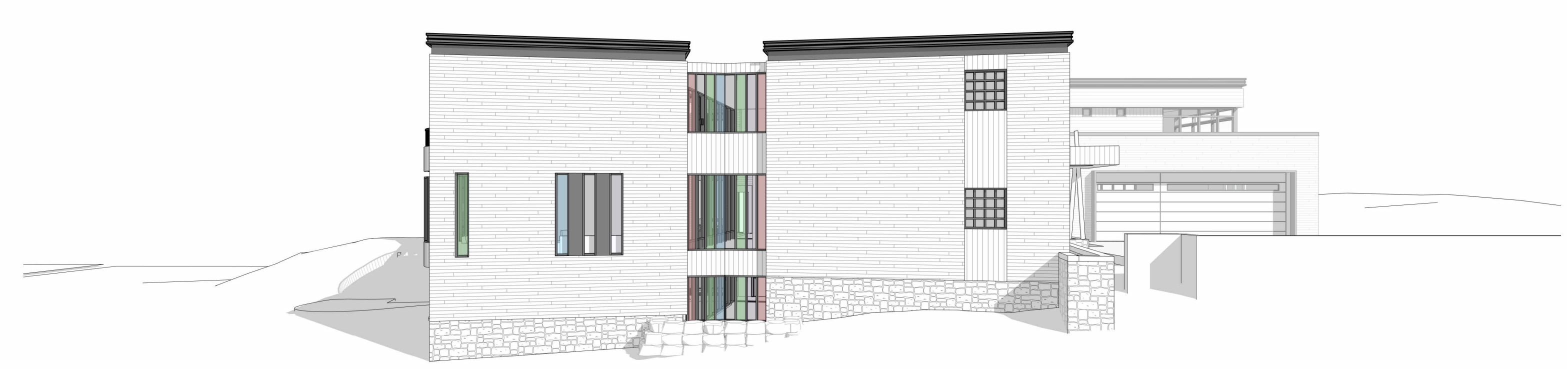
NORTH ELEVATION PERSPECTIVE - MIDDLE