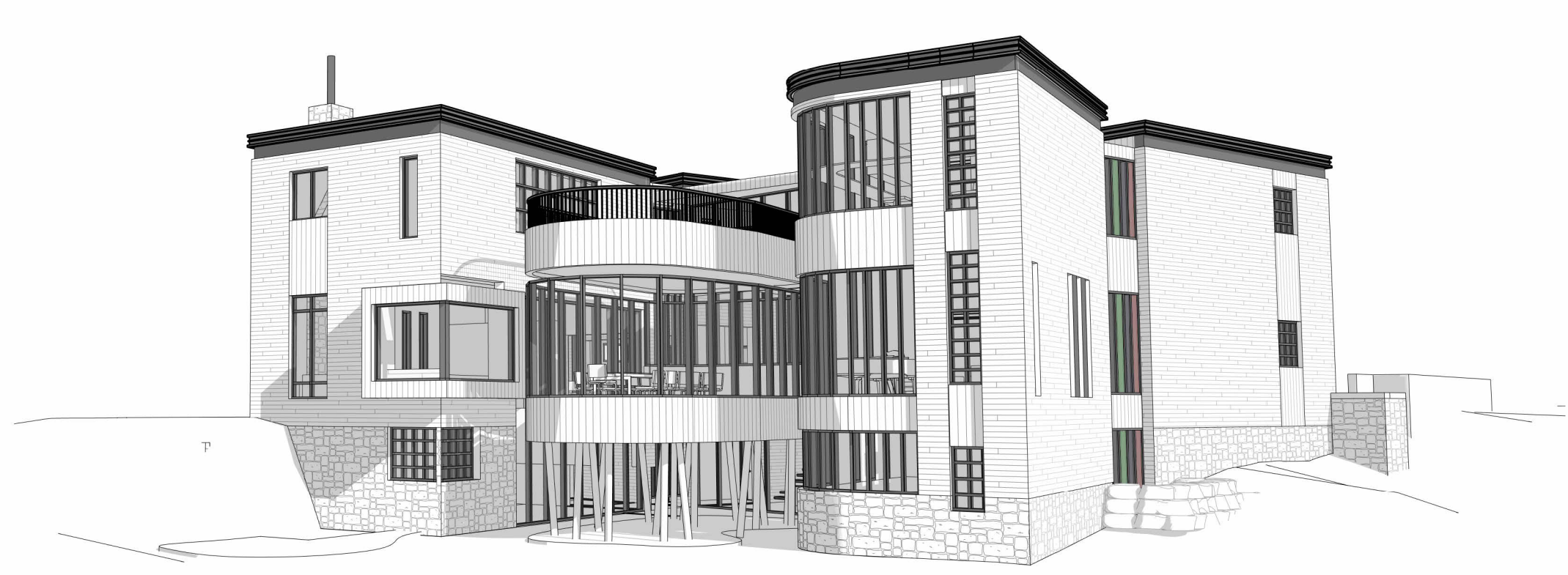
NORTH ELEVATION PERSPECTIVE - LEFT