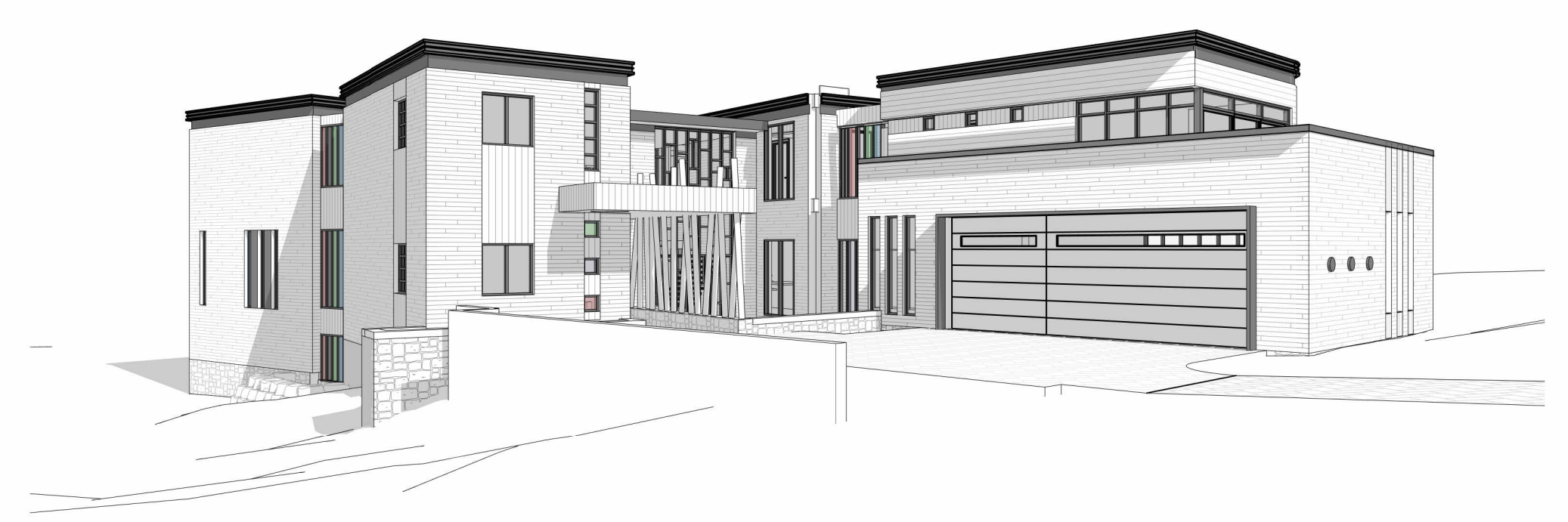
NORTH ELEVATION PERSPECTIVE - RIGHT