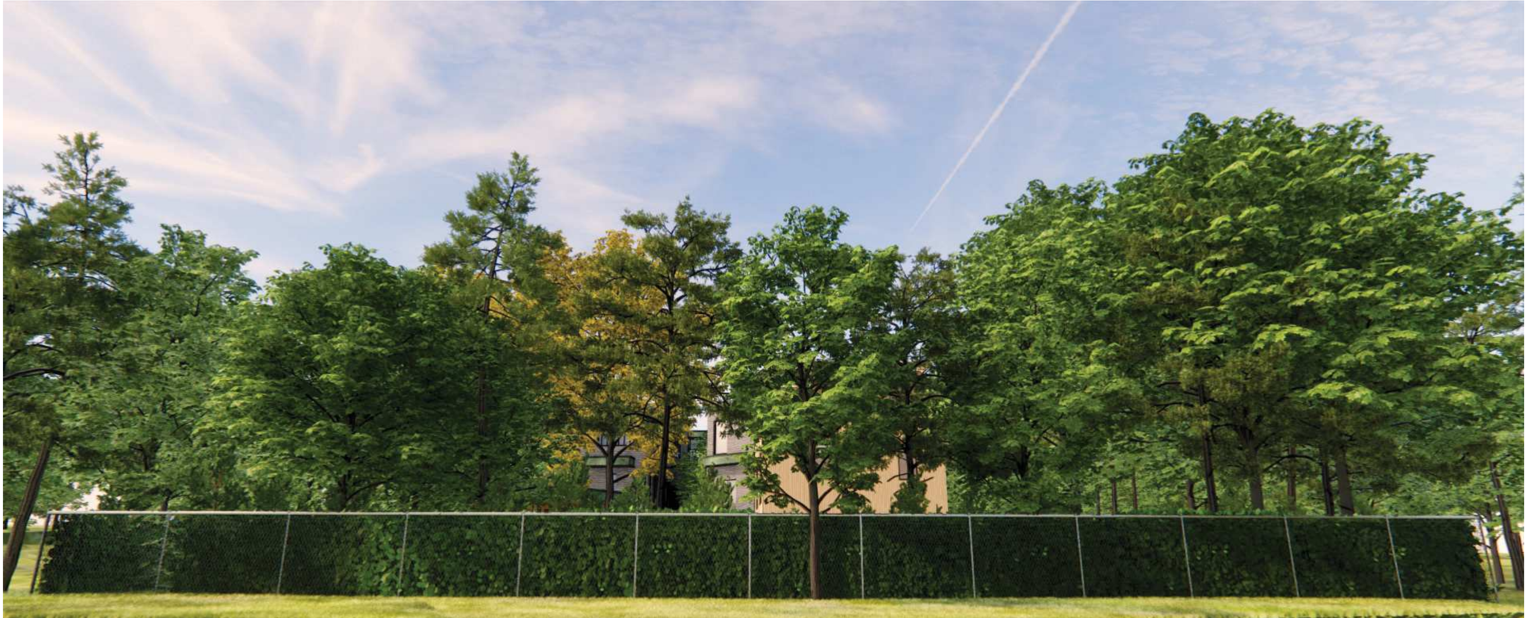
VIEW FROM TENNIS COURT