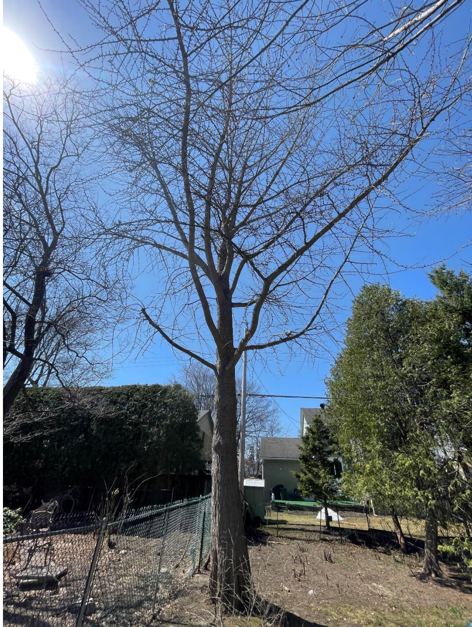
Figure 1 - Tree 5 private ginkgo to be retained.