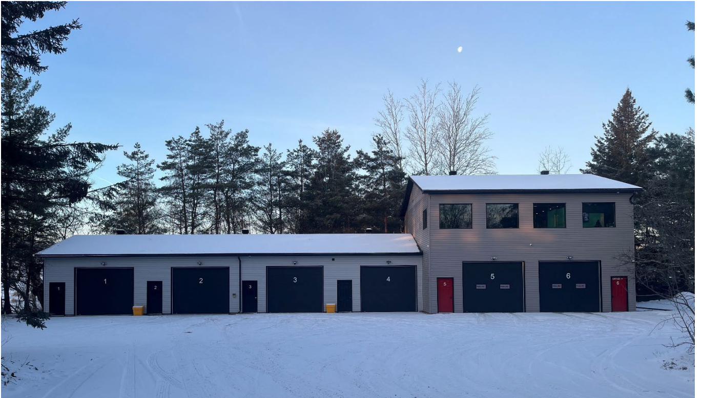
Image 2: Photograph of front façade of the existing warehouse and office building.