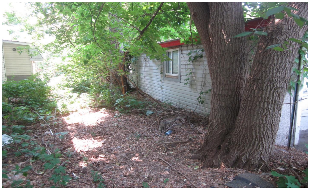
Picture 1. Trees #1 and 2 (left to right), lower boles of private spruce and maple trees at 598 Kirkwood Avenue