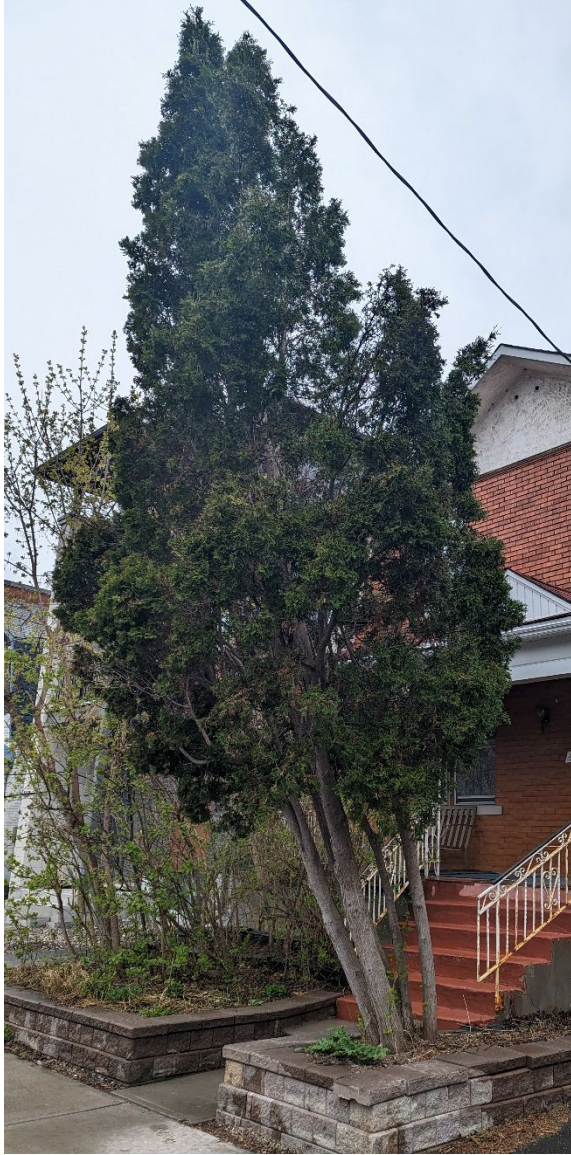
Above: Tree 1 - City cedar to be removed.