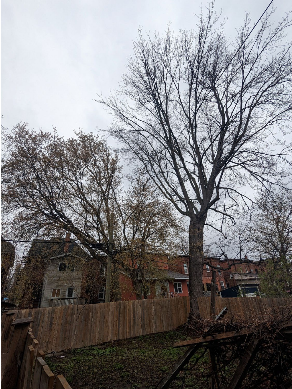
(Left): Tree 3 - Adjacent Manitoba maple to be retained. (Right) Tree 4: Boundary red maple to be retained.