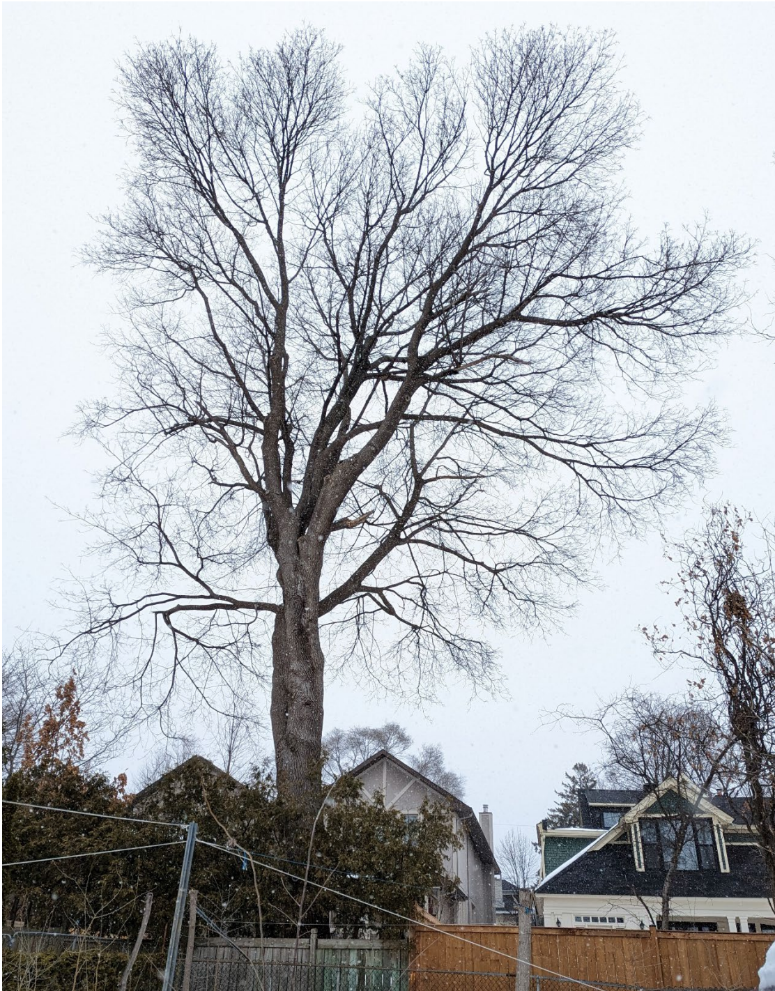
Figure 4 - Tree 6: Adjacent sugar maple to be retained.