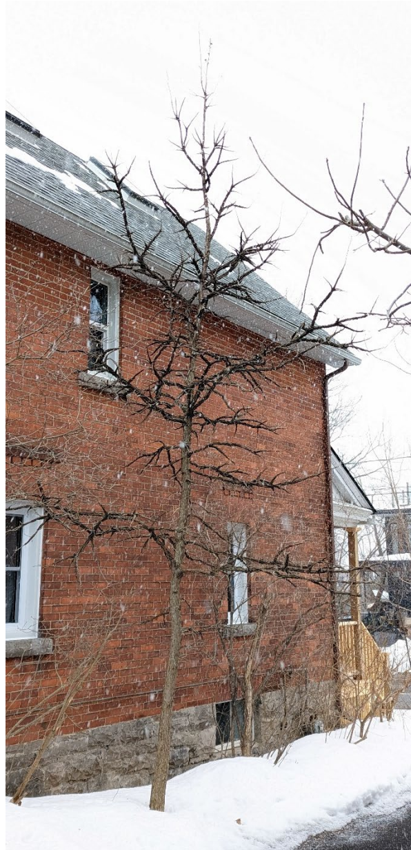
Figure 2 - Tree 3: private bur oak. Good candidate for transplanting