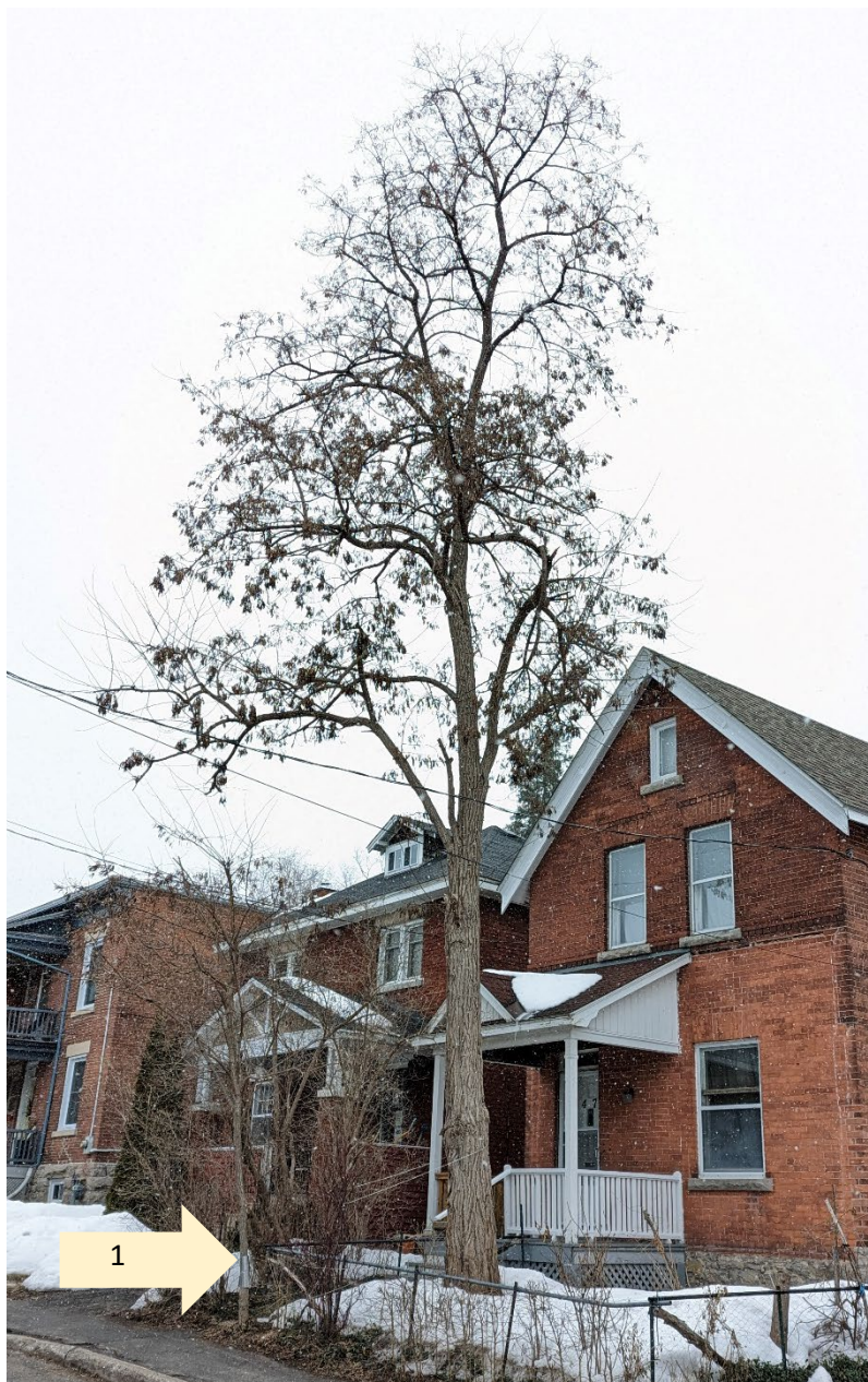
Figure 1 - Tree 1 (indicated with arrow): city black locust to be removed. Tree 2: private black locust to be removed.