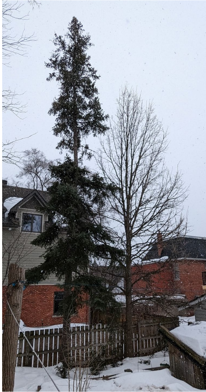
Figure 3 - Trees 4 and 5: private bur oak and spruce to be retained.