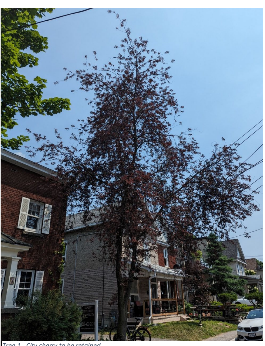
Tree 1 - City cherry to be retained.