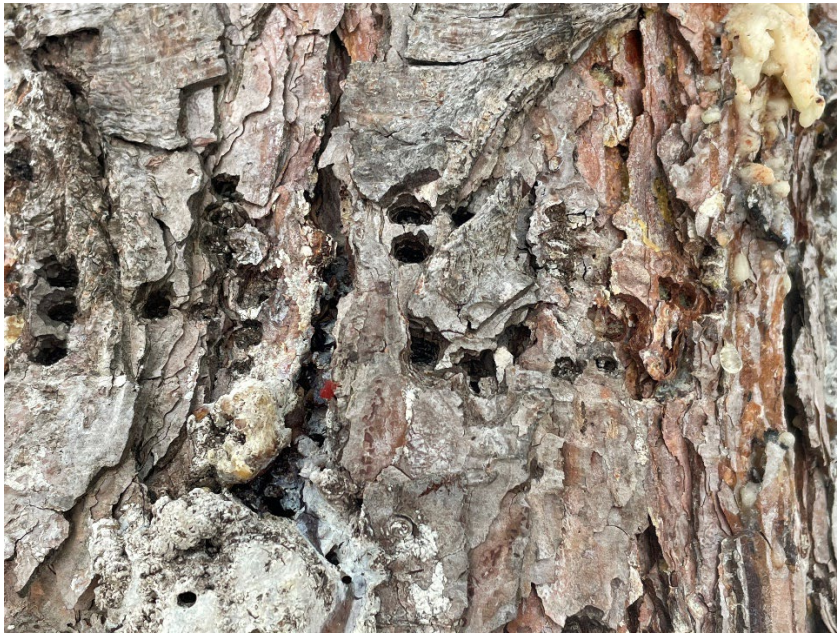
Figure 4: Photo showing sapsucker holes and possible insect exit holes