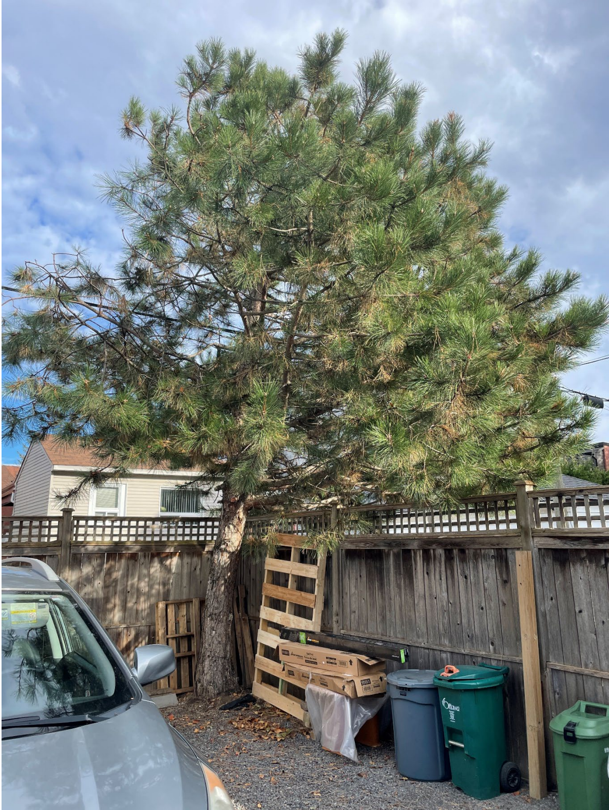
Figure 2: Picture of pine taken on October 26, 2022, showing signs of needle browning