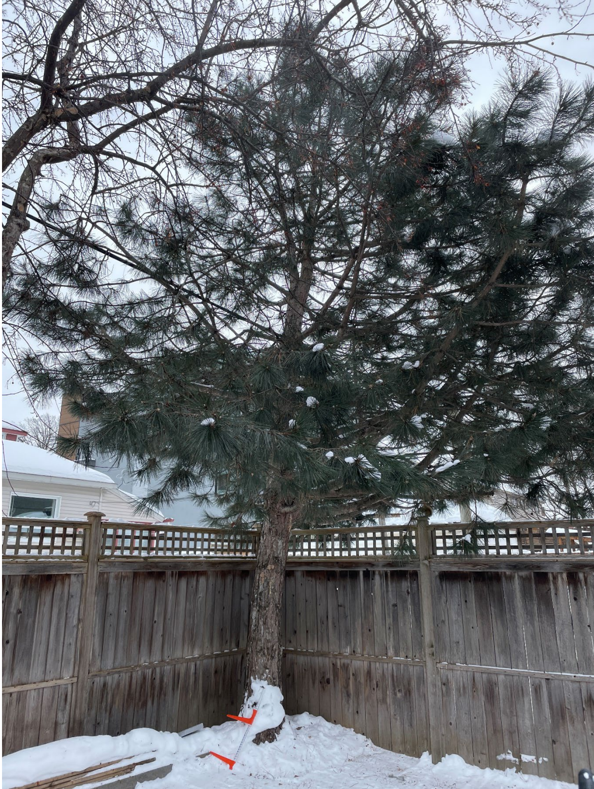
Figure 1: Privately owned Austrian pine at the rear of the property, taken on January 31, 2022