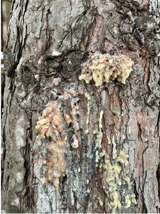
Figure 3: Photo showing resin pitch