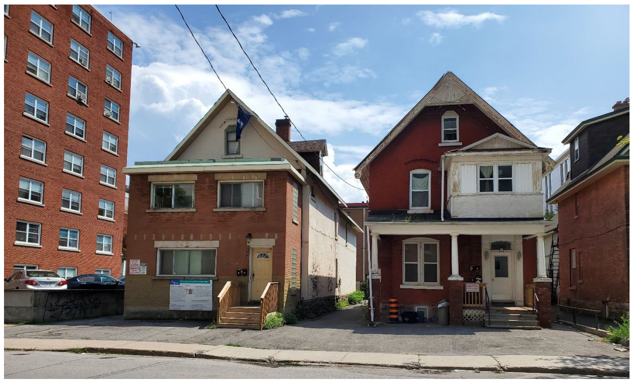
The existing houses on 230 Lisgar Street (left) and 232 Lisgar Street (right) (City of Ottawa, 2023).