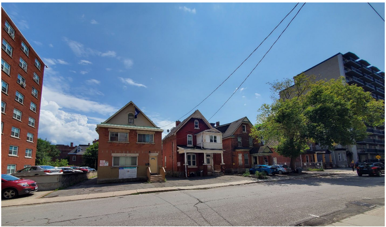
The streetscape along the south side of Lisgar Street, with the two subject properties in the middle (City of Ottawa, 2023).