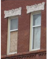
Existing windows and terracotta lintels at 3rd level.

All existing windows at Level 2 and Level 3 to be replaced as per original window frame colour or white in aluminum. Existing window colours are not original. Window sill flashing to be added to avoid water infiltration. All existing decorative terracotta lintels to be restored and repainted as per historical record intent or white. Refer to HIA by John Stewart.