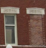
Existing windows and terracotta lintels at 2nd level. Existing window masonry brick infill to be removed and replace with new window.