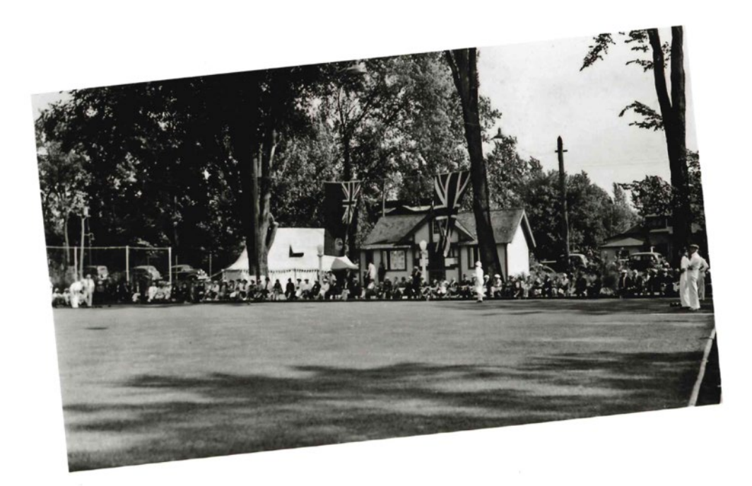
Activities at HPLBC, HPLBC Archives