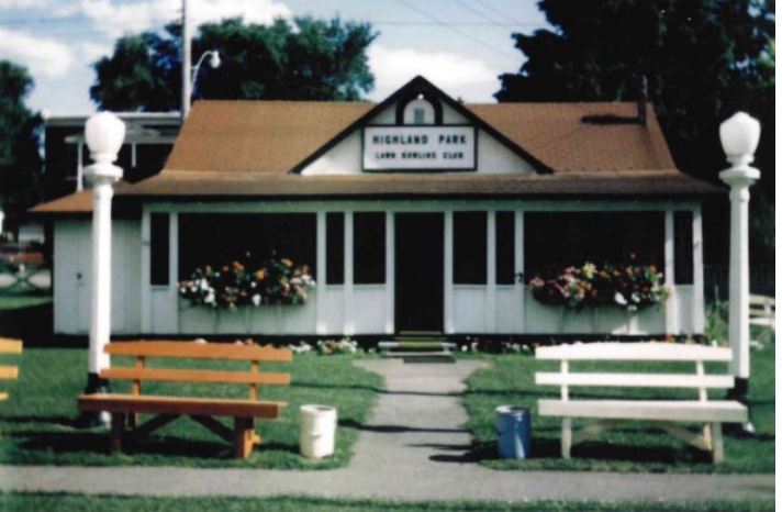
Highland Park Lawn Bowling Club, HPLBC Archives

cottage. The building's design is typical of lawn bowling clubhouses from the early 1900s, featuring a modest form, white siding with green accent details, side gable and small cross gable. The architect is unknown, but the original structure was simple in design, stucco over frame, and consisted of a central room, kitchen, locker room, and washrooms.<sup>1</sup> This simplicity was derived from its function.