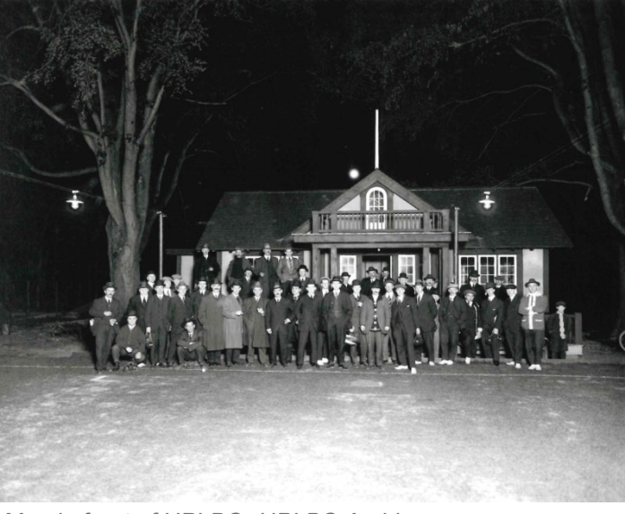
Men in front of HPLBC

history of lawn bowling in Canada and the development of Highland Park.<sup>5</sup> Dating back to 1914, the property has served as a sports club, community gathering place, and event centre in the Westboro area for over a century, contributing to the area's social life and development.<sup>4</sup> It stands as a remnant of the early 20<sup>th</sup> century middle class lifestyle when sports and recreational clubs gained immense popularity, coinciding with the increasing leisure time of the emerging middle class.<sup>6</sup>