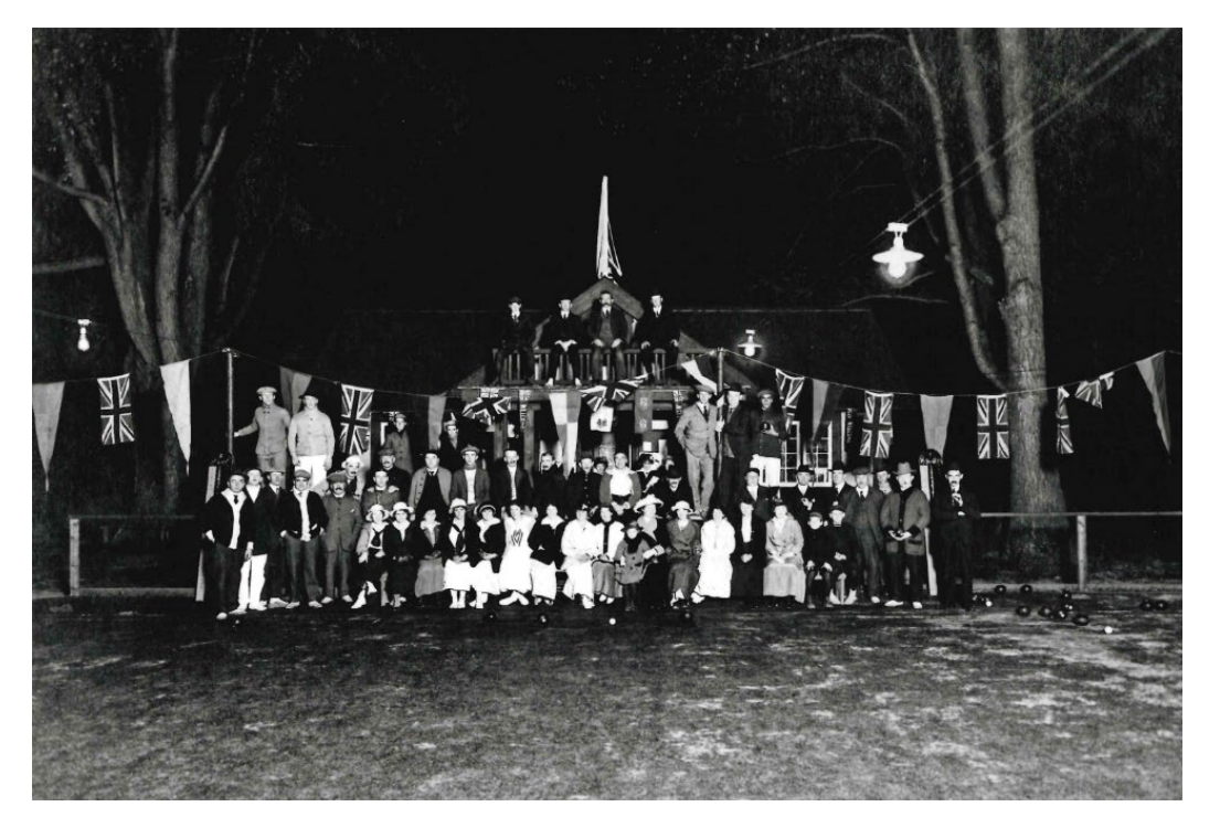
Men in front of HPLBC