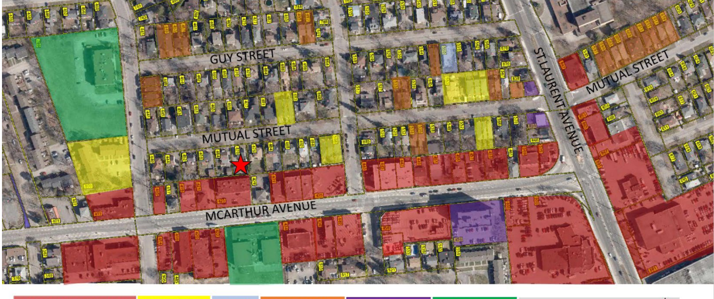
Figure 4: Land Use Map

The Official Plan provides direction that neighbourhoods located in the Inner Urban area and within a short walking distance to Hubs and Corridors shall accommodate residential growth to meet the Growth Management Framework. This is to be implemented through the Zoning By-law by supporting a wide variety of housing types with a focus on missing-middle housing and higher-density low rise residential development. The intent of the Evolving area is to signal a gradual shift towards a more urban built form.