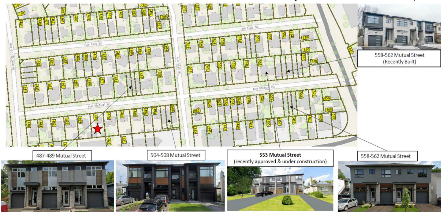
Figure 6: Similar Townhome Developments

While consideration was given to an alternative driveway configuration that could provide a larger aggregate area of soft landscaping in the front yard, the design of these townhomes includes secondary dwelling units in the basement, and the proposed garage location is necessary to facilitate the side entrances for these units. These secondary units are highly desirable in this neighbourhood to help facilitate more affordable living. We feel that these variances are minor as the majority of the lot width is softly landscaped, just separated with the driveway, and since no trees are impacted, there is no adverse impact to the streetscape.