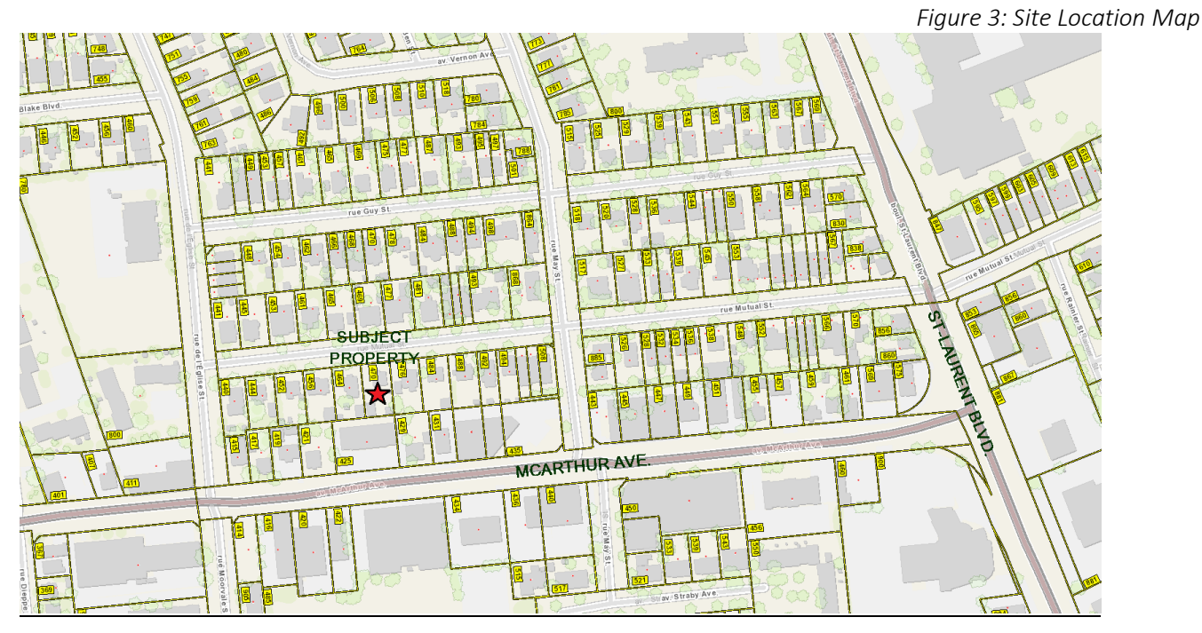
470 Mutual Street - Application for Consents to Sever and Minor Variances

Vanier-South is an old neighbourhood with mixed and suburban characteristics, presently undergoing significant revitalization and transition. The majority of the existing housing stock was built from the early 1900s through the 1970s. Housing along Mutual Street is mixed with older 1 and 2-storey single and semi-detached homes, and newer 2-storey townhomes. The replacement of the existing homes by larger 2-storey semi-detached and townhouse dwellings on smaller severed lots has occurred throughout this area in the last 5 to 10 years to maximize residential development on these lots.