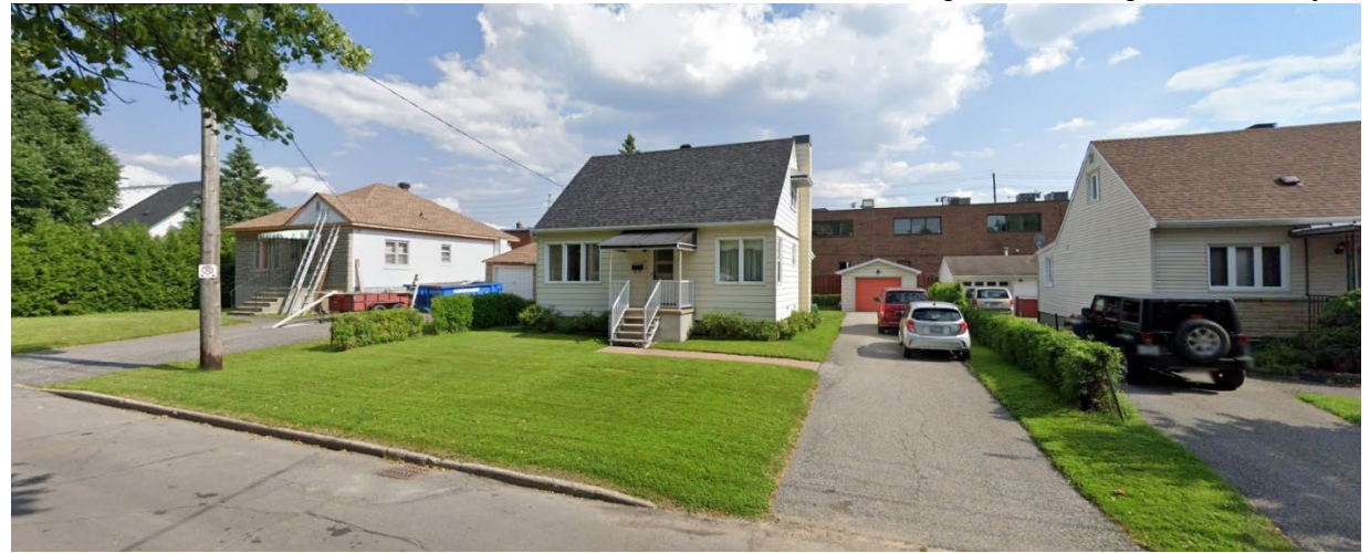
Figure 2: Existing home on Subject Property

There is a 1.5-storey dwelling and detached garage on the property which was constructed in the 1940s/50s, and has a floor area of approximately 1,000sq.ft. Access to the property is provided from Mutual Street, which is a neighbourhood street. Transit service is provided along McArthur Avenue to the South and St-Laurent Blvd to the East. The area is well served by a range of commercial and community amenities, principally along McArthur Avenue to the South and St-Laurent Blvd to the East. St-Laurent Mall can be found to the South, along with St-Laurent Complex and Ottawa Public Library nearby to the North.