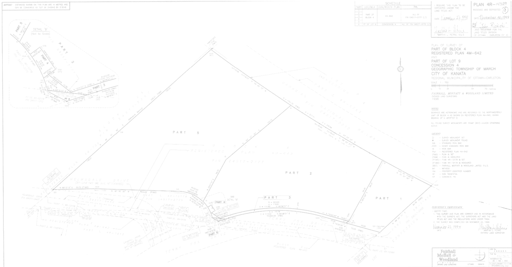
Figure 3: Excerpt of Plan 4R-14329 (full version enclosed with the application)