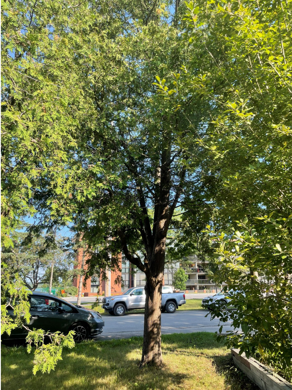
Figure 2: Tree 2, eastern white cedar to be retained