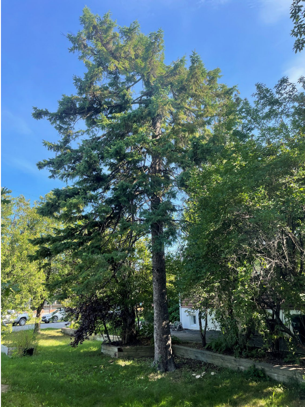
Figure 3: Tree 4, white spruce to be removed