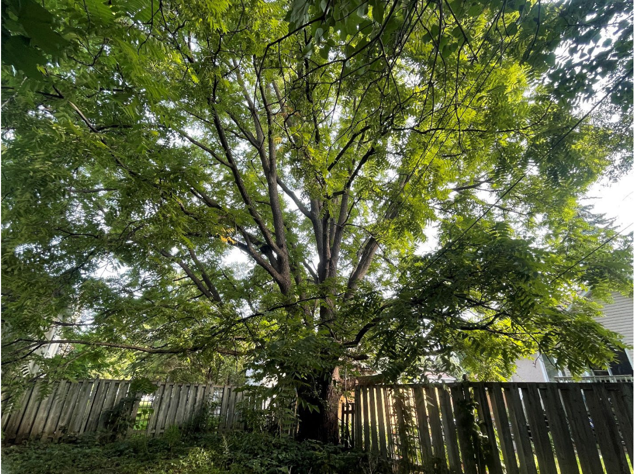
Figure 4: Tree 5, large black walnut to be removed