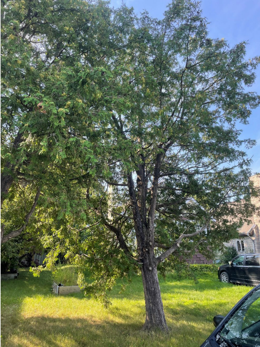
Figure 1: Tree 1, eastern white cedar to be removed