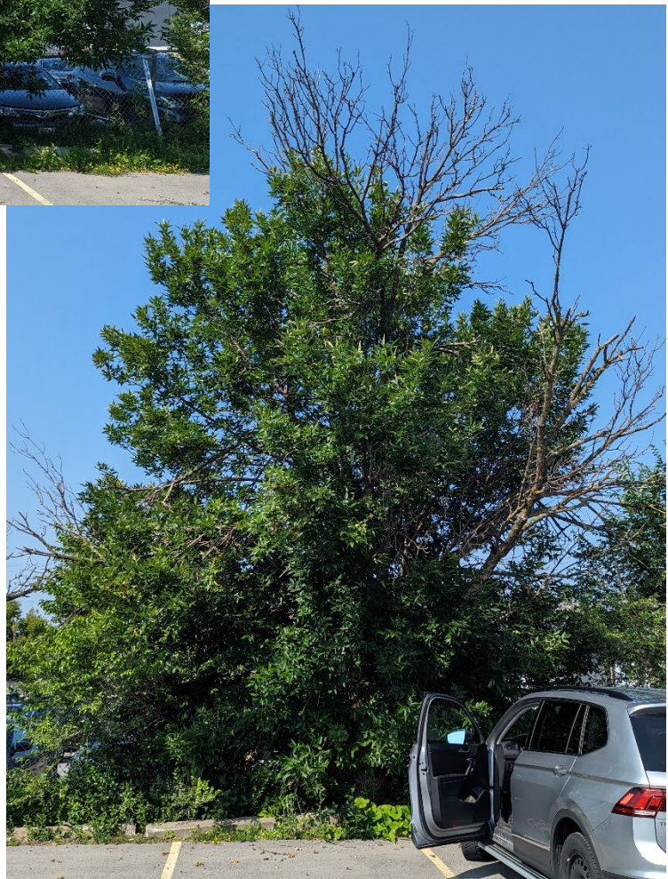
Right: Tree 2 - private ash to be retained.