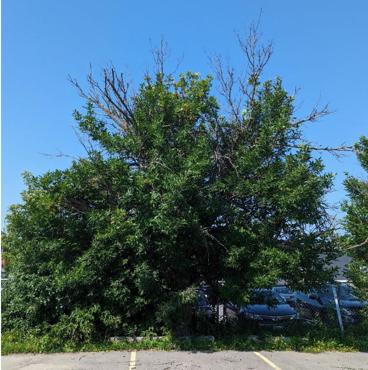
Above: Tree 1 - private ash to be retained.