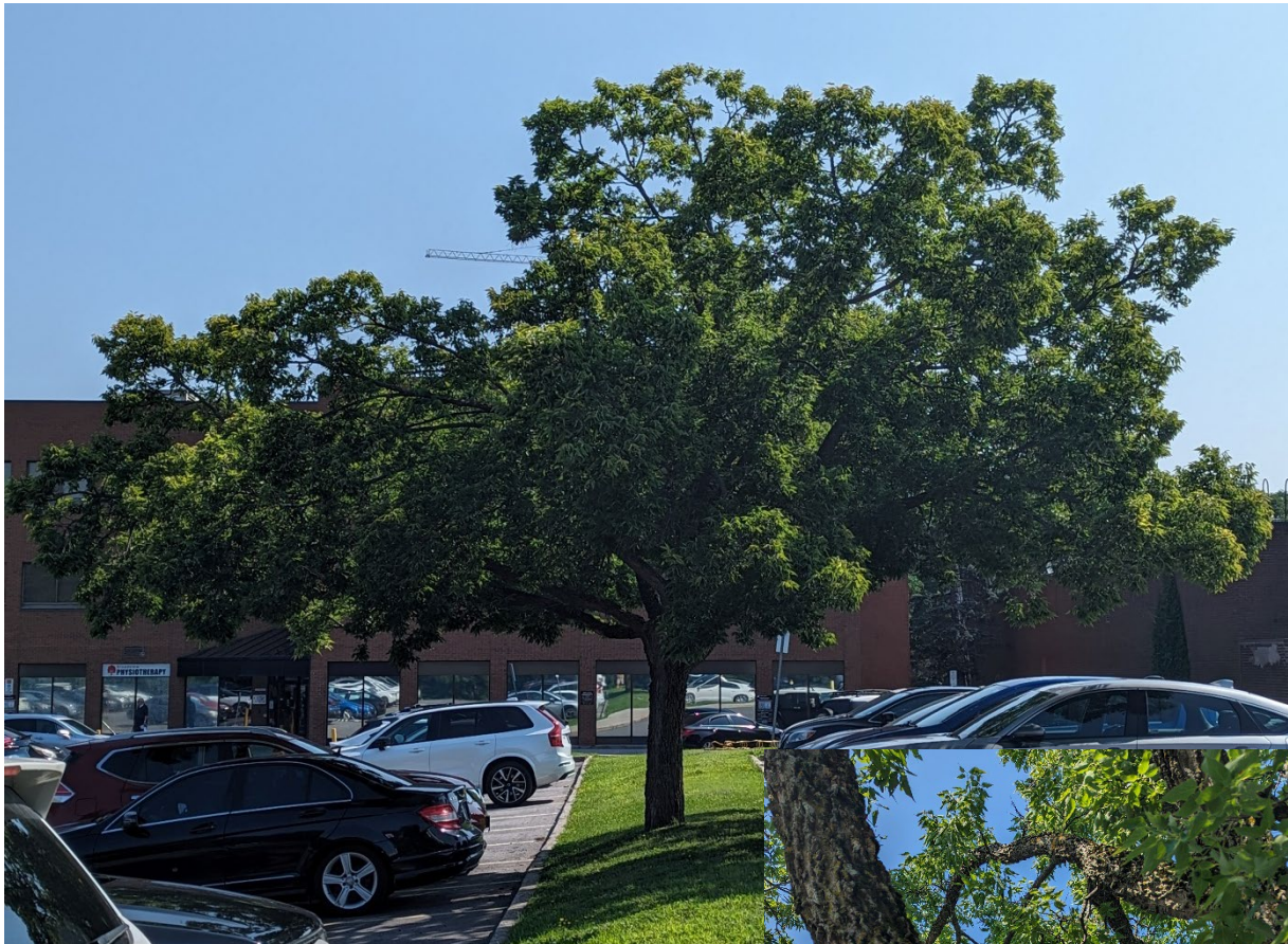
Above: Tree 3 - private hackberry to be retained.