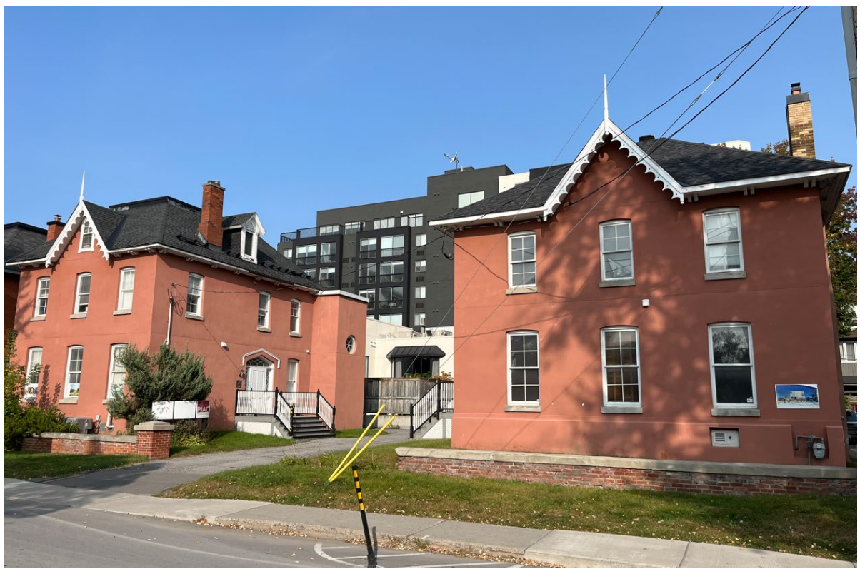
283 and 285 McLeod Street