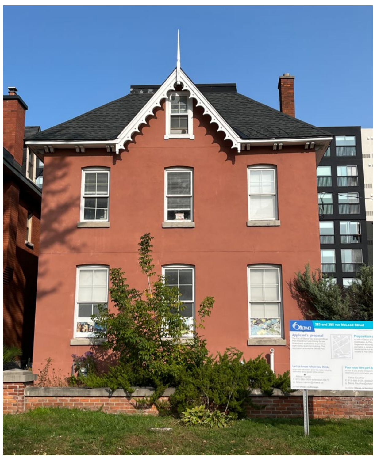
285 McLeod Street, front façade