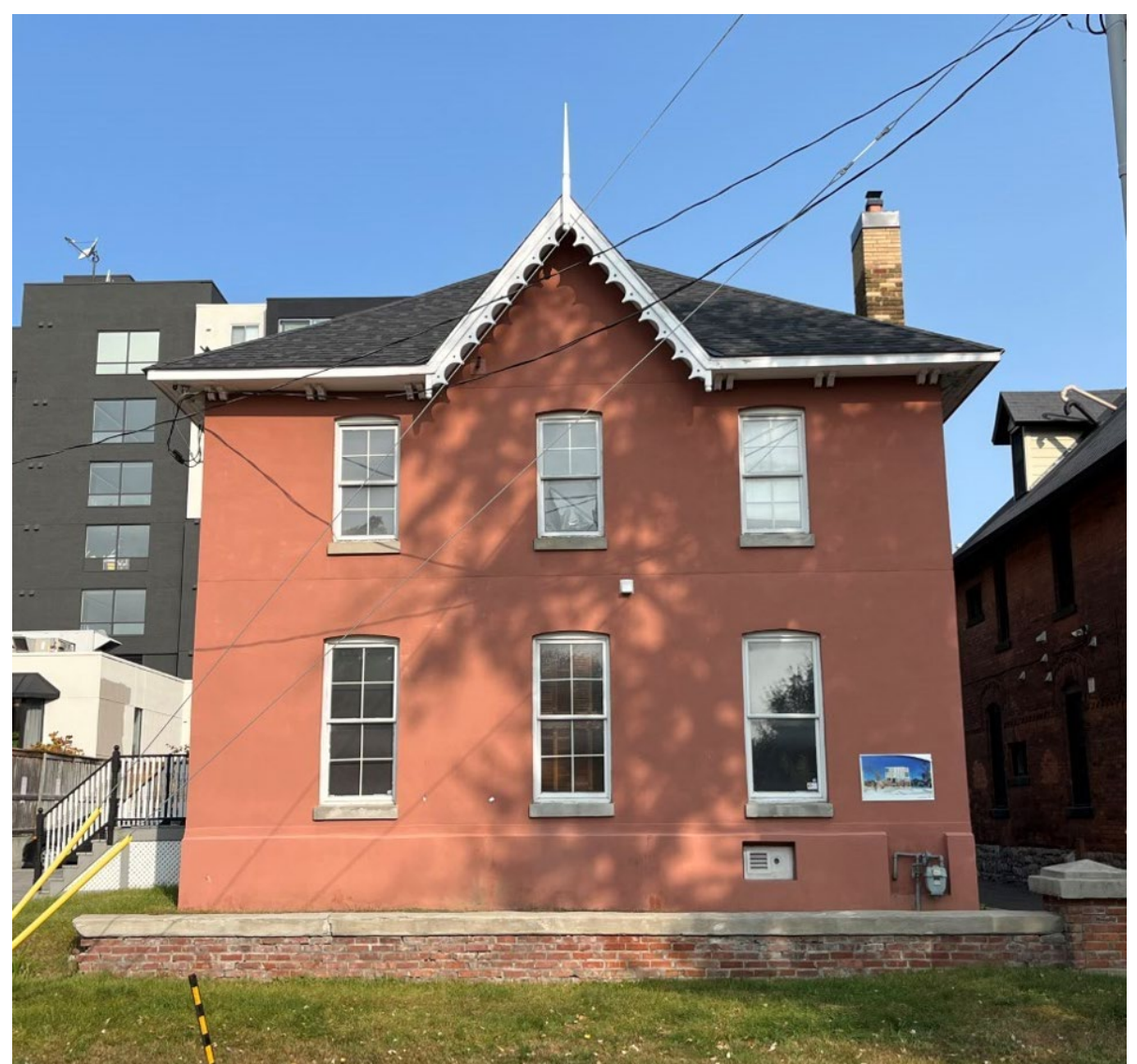
283 McLeod Street, front façade