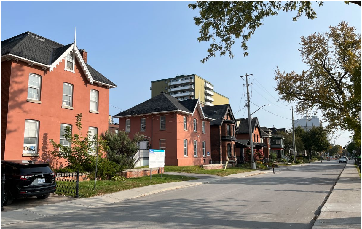
North side of McLeod Street looking east