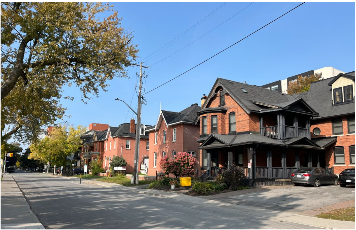
North side of McLeod Street looking west