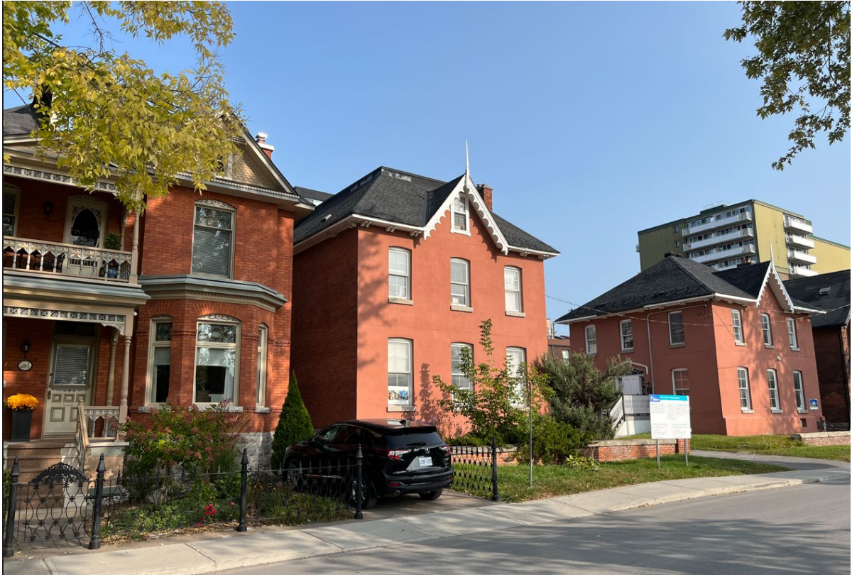
283 and 285 McLeod Street