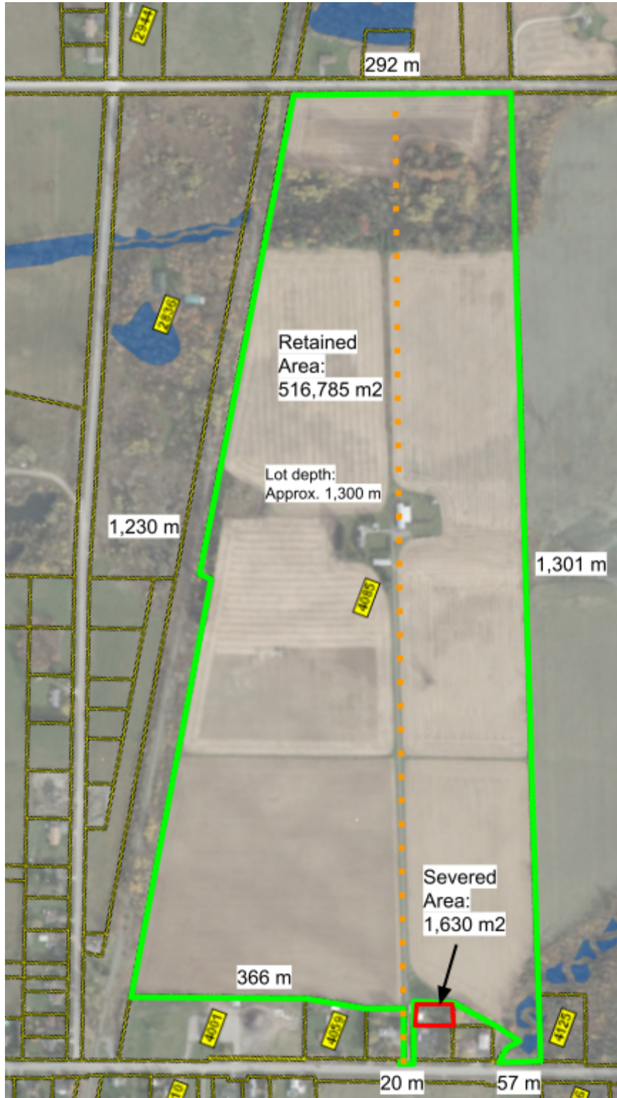
4085 Dunning Rd - Lot Line Adjustment Sketch August 18th, 2023 P H Robinson Consulting

Committee of Adjustment Received | Reçu le 2023-08-21 City of Ottawa | Ville d'Ottawa Comité de dérogation