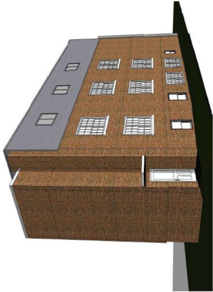
02 | REAR VIEW