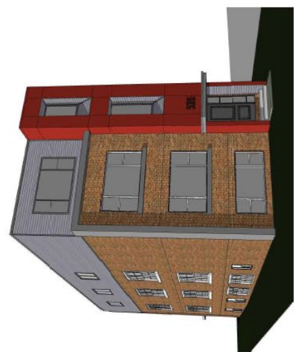
01 | FRONT VIEW