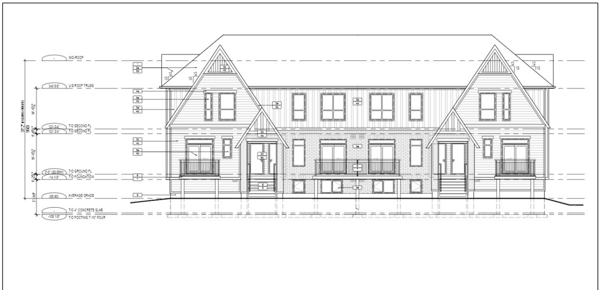
Elevation on Trailsedge Way