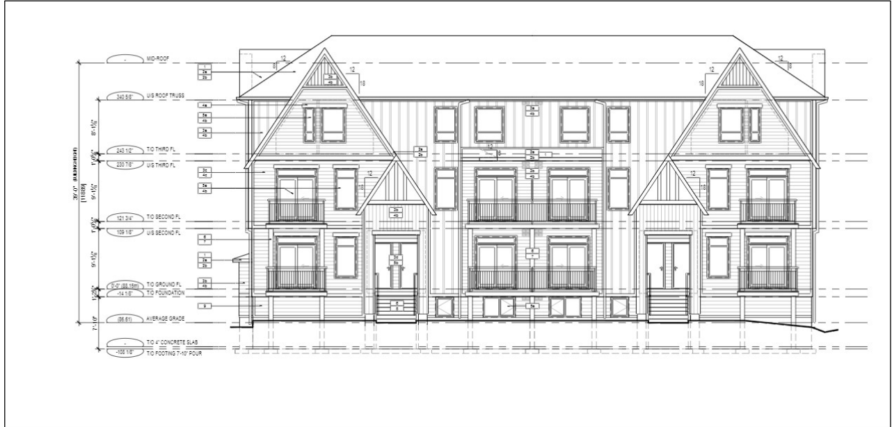
Elevation on Renaud Road