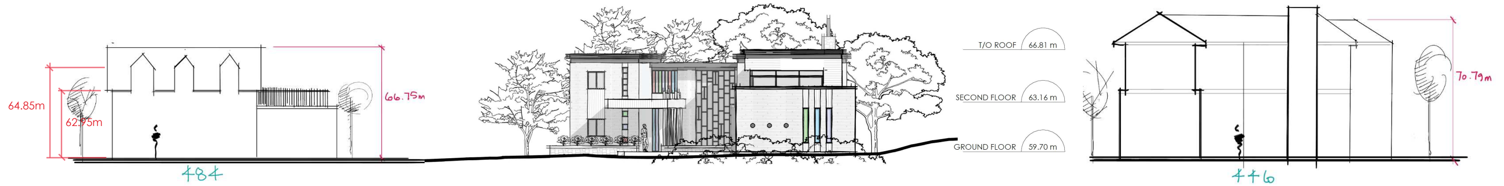
West side of Cloverdale Road depicted above. (South to North)