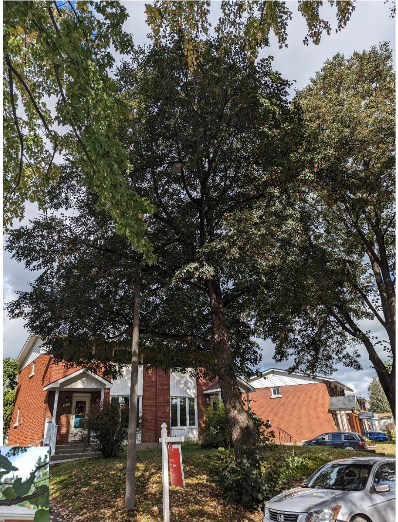
Above: Tree 2 - City linden.