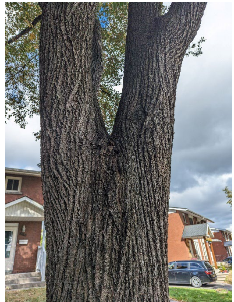
Right: bulge at main union of Tree 1