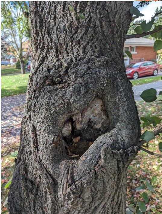
Left: cavity on stem of Tree 2