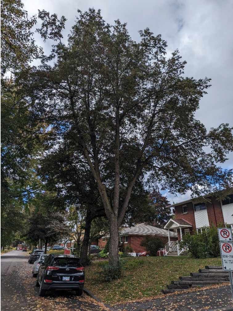
Above: Tree 1 - City linden.