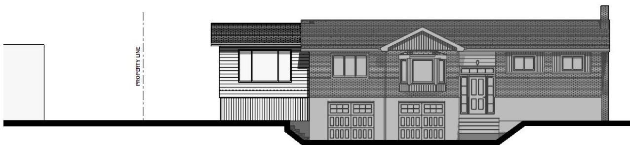
Figure 3 – Site Context along Arizona

Under the R10 zoning design for single-detached dwellings, the building is permitted to be constructed up to 8m in height. The following figure has been created to evaluate the impact of the proposed development to adjacent neighboring properties.