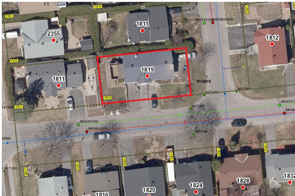
Figure 1 – Site Location

The lot is zoned First Density under the current zoning by-law 2008-250, with a zone designation R10 which offers a wide range of residential uses, in which an accessory structure that contributes to the principal use is permitted.