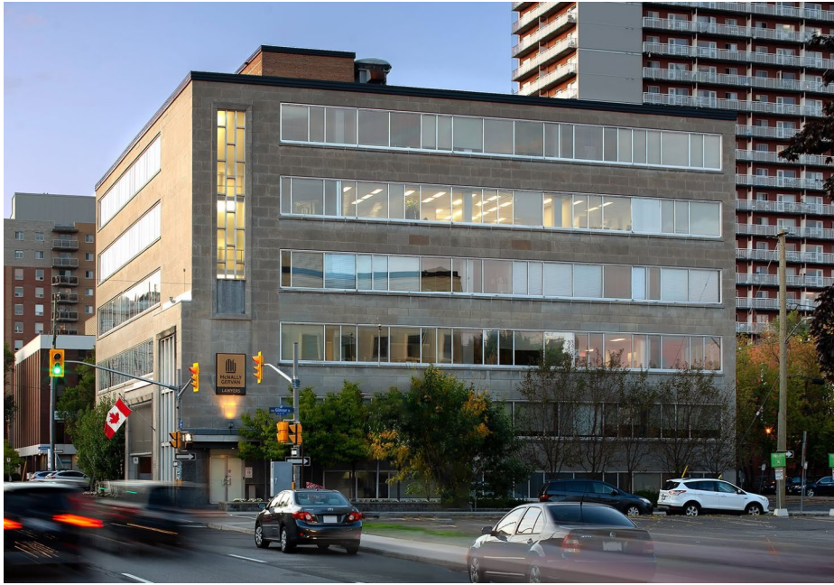
Figure 2 - Current condition, 2022, of Legion House

The notable south and west building facades are punctuated by long horizontal linear windows. This linear limestone expression is interrupted at the southwest corner by a vertical gesture, highlighting the main entrance. It is important to note that level one is depressed by roughly five feet, requiring an elevator to provide barrier-free access. This issue of accessibility will be addressed in the new proposal. The north and east elevations are clad with brick masonry and will not be retained.