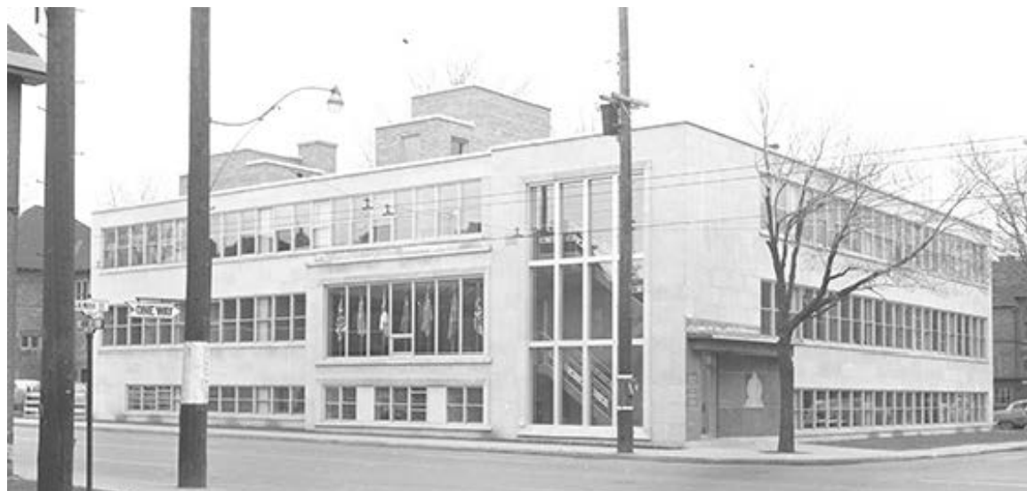
Figure 1 - Original 3 storey Legion House

The heritage survey and evaluation report, dated January 2022, prepared by the City of Ottawa, highlights the significant community value the national headquarters brought to the community. While the international architectural style of the building used quality materials such as limestone for its main facades, it “does not display a particularly high degree of craftsmanship or artistic merit in its expression”, according to the City’s heritage survey and evaluation report. In its context, the building provides a strong corner presence.