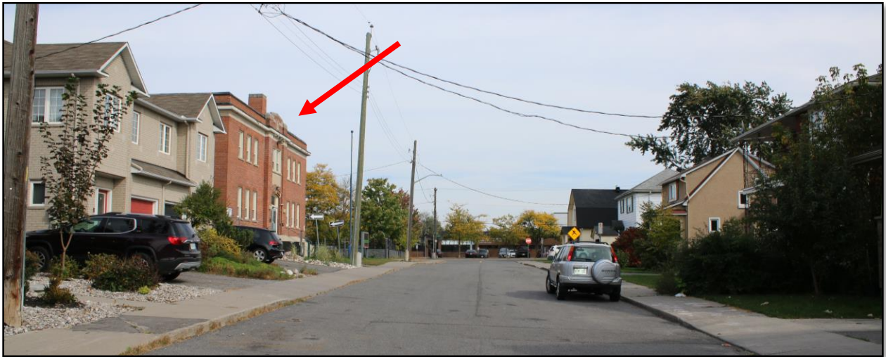
Figure 12. View of the former Overbrook Public School streetscape, looking east on King George Street, 6 Oct. 2023.