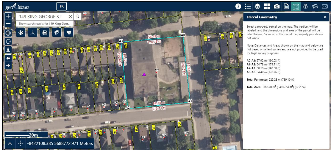
Figure 5. 149 King George Street aerial view and lot geometry.