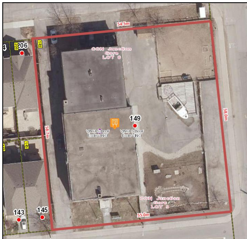
Figure 2. Former Overbrook Public School property boundaries for the Designated Property.