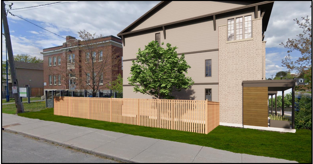
Figure 15. Rendering, south face of proposed development at 149 King George Street, based on a preliminary plan; the proposed plan has this end of the building set almost in line with the front elevation of the school.