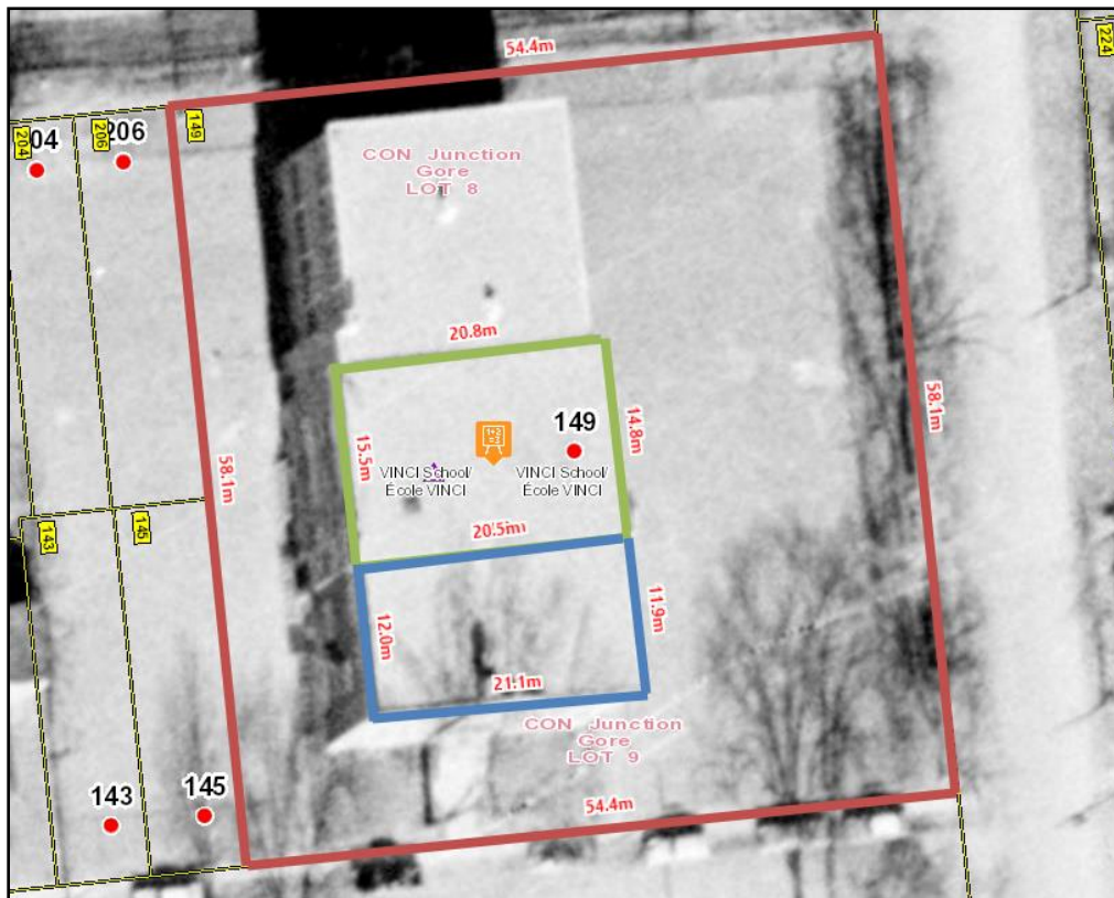
Figure 18. Former Overbrook Public School site with outlines of the original 1916 school building (in blue) and the 1947 addition (in green) as seen in a slightly oblique aerial view in 1958.