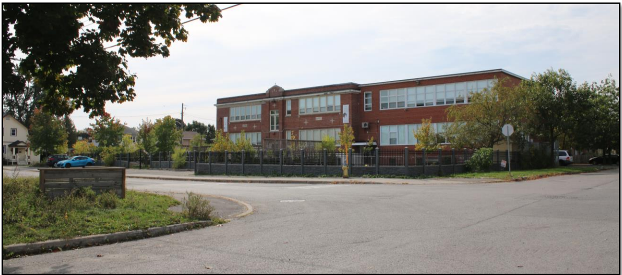
Figure 10. View of the development site along Quill Street, 6 Oct. 2023.