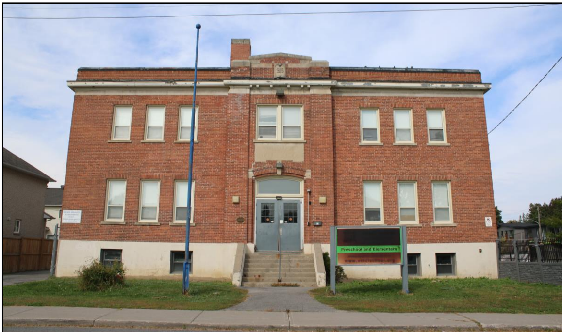
Figure 8. South façade, 149 King George Street, 6 Oct. 2023. This façade was the main elevation of the original school building erected in 1916. The development site is located on the right (east side) of the building.