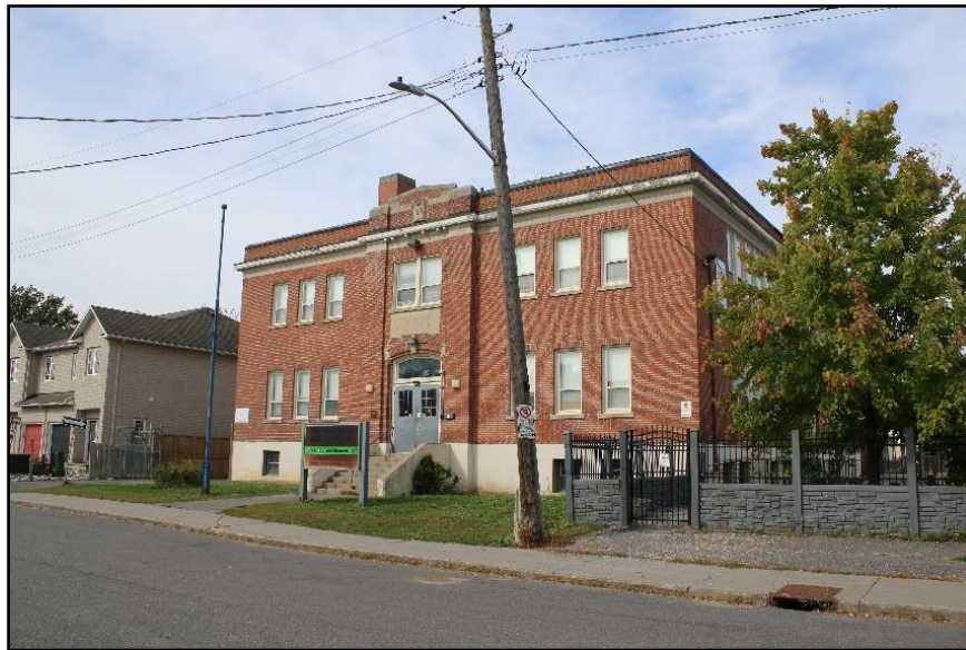
Figure 1. Former Overbrook Public School, a fully designated heritage property located at 149 King George Street, Ottawa, ON. South façade, facing King George Street.