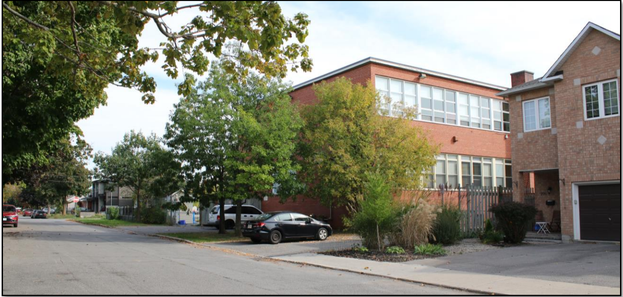
Figure 11. View of 149 King George Street, looking east on Glynn Avenue, 6 Oct. 2023.