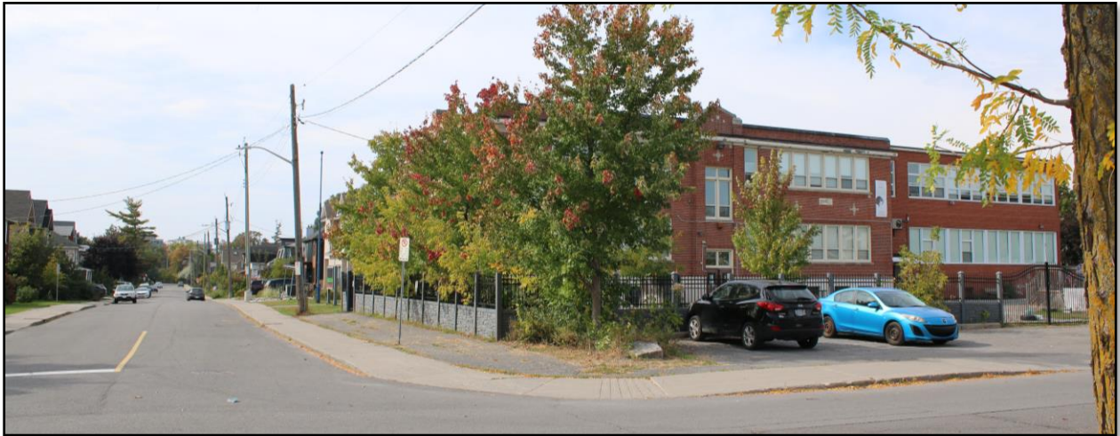
Figure 9. 149 King George Street, view from the southeast, looking towards the development site on Quill Street, 6 Oct. 2023.