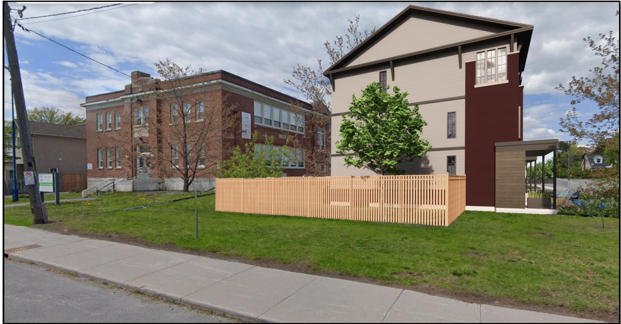
Figure 17. Rendering, south face of proposed development at 149 King George Street, with units set back to be almost in line with the front elevation of the school.