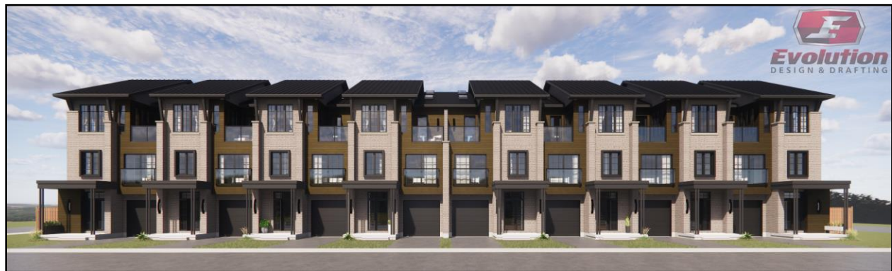
Figure 6. 149 King George Street, rendering of proposed development, facing Quill Street. NOTE: The selection of grey brick shown here has been amended to red brick.