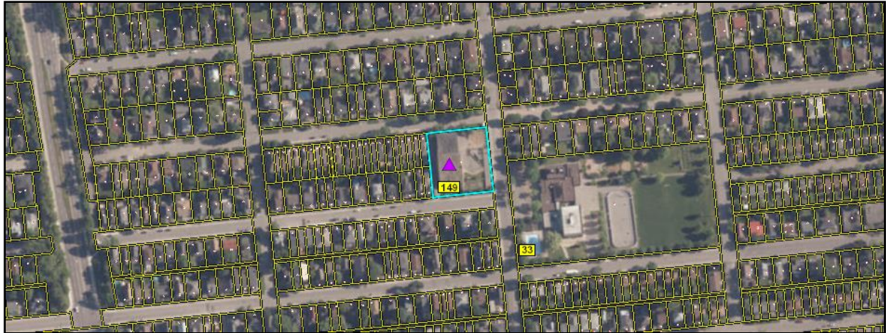
Figure 3. 149 King George Street, Ottawa, location.