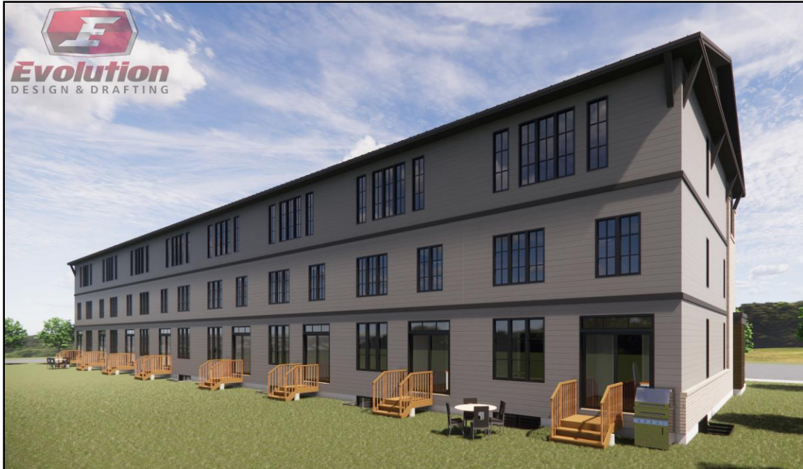
Figure 7. 149 King George Street, rendering of proposed development, west side, facing the east side of the former Overbrook Public School.