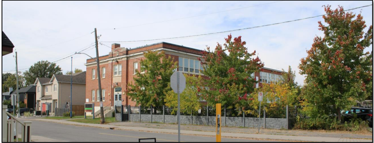
Figure 13. View of 149 King George Street from the south-west corner of Quill Street and King George Street, 6 Oct. 2023.