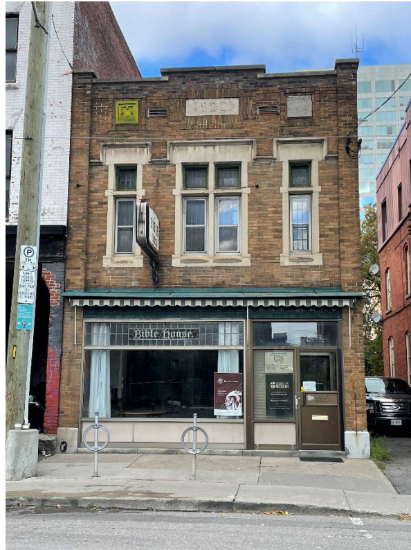
Figure 1: Bible House, 315 Lisgar Street, City of Ottawa 2023

Original Owner: Ottawa Auxiliary Bible Society