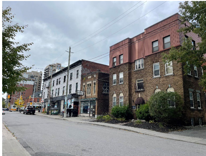
Lisgar Street Facing West.