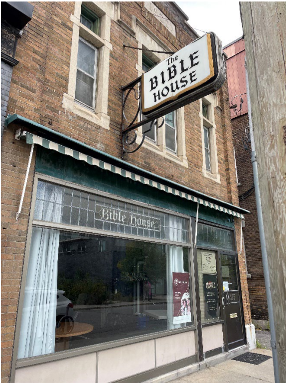
315 Lisgar Street Entrance.