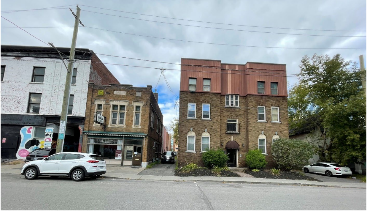
311 and 315 Lisgar Street Ottawa.