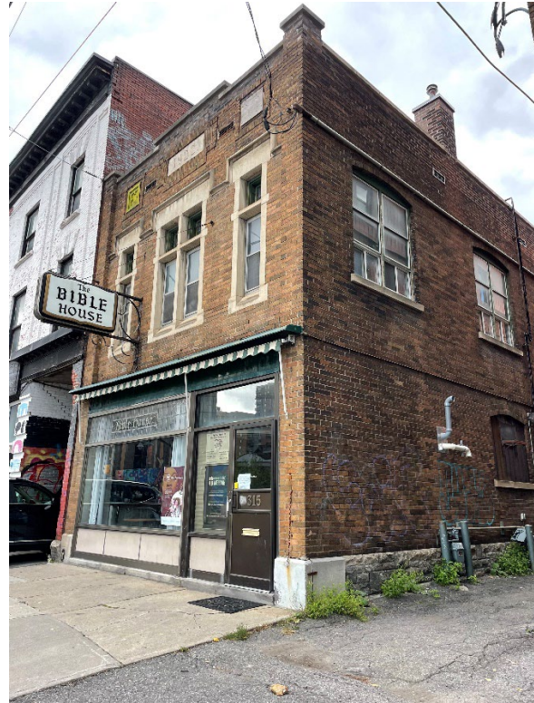
Bible House.