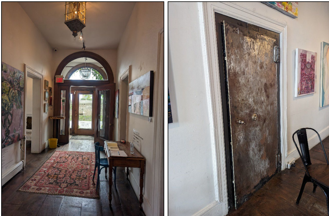
Top photo: Front elevation of 290 City Centre Avenue; bottom photos: Interior central hall plan and JJ Taylor vault.