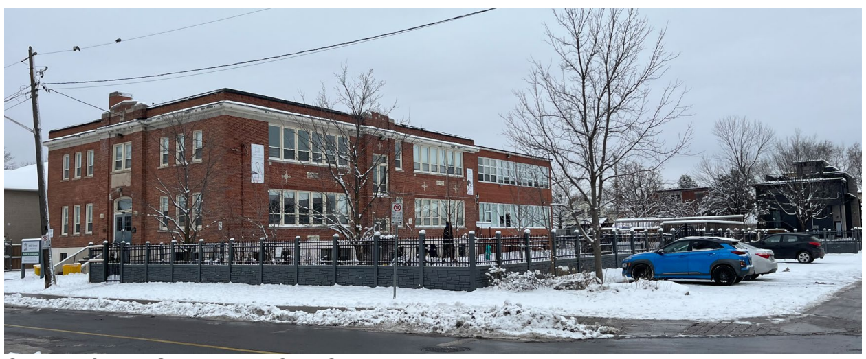
Corner of King George and Quill Streets