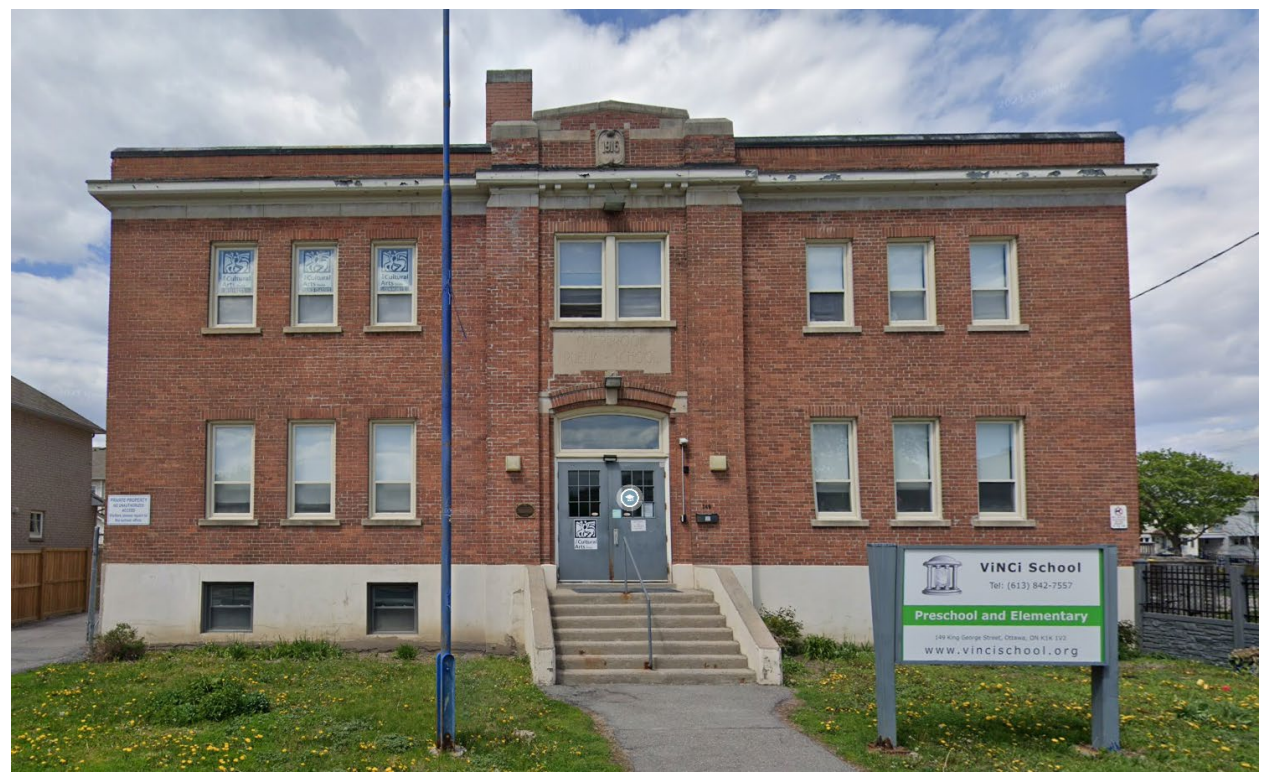
Front façade of 149 King George Street