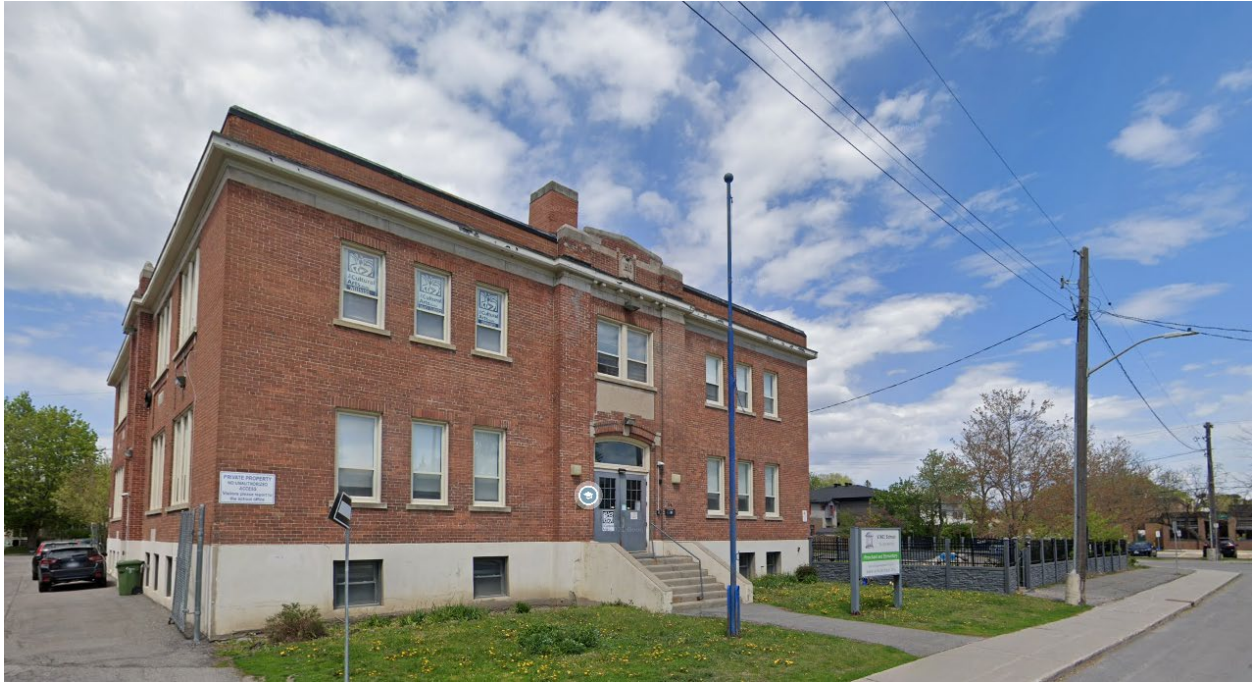
Front façade of 149 King George Street