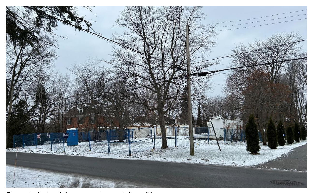
Current photo of the property, post demolition.