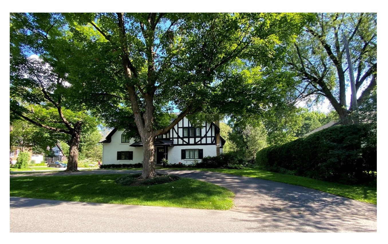
View of 240 Mariposa on the south side, across the street from the subject property.