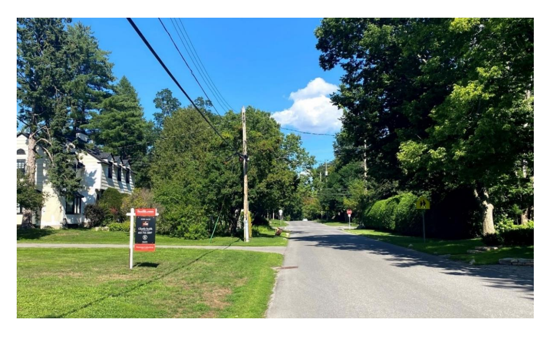
Streetscape looking east showing the house on the north side of Mariposa Avenue at the corner of Springfield Road