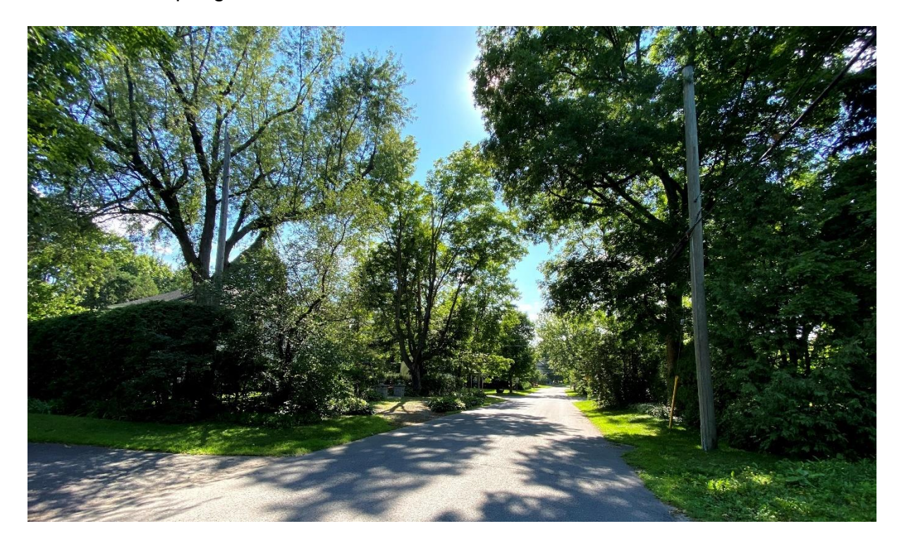
Streetscape looking west on Mariposa Avenue.