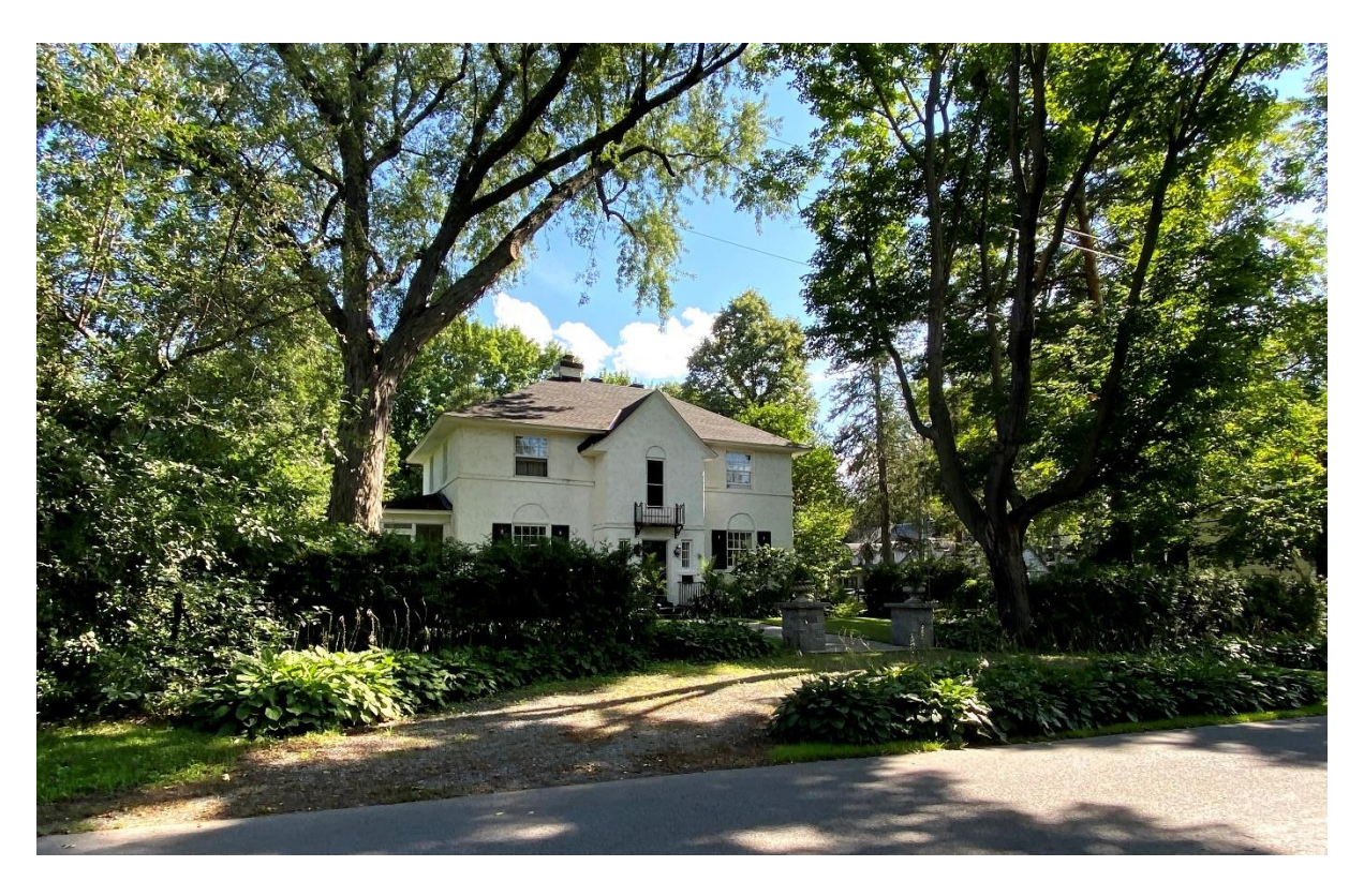
View of the 210 Mariposa on the south side, across the street from the subject property.