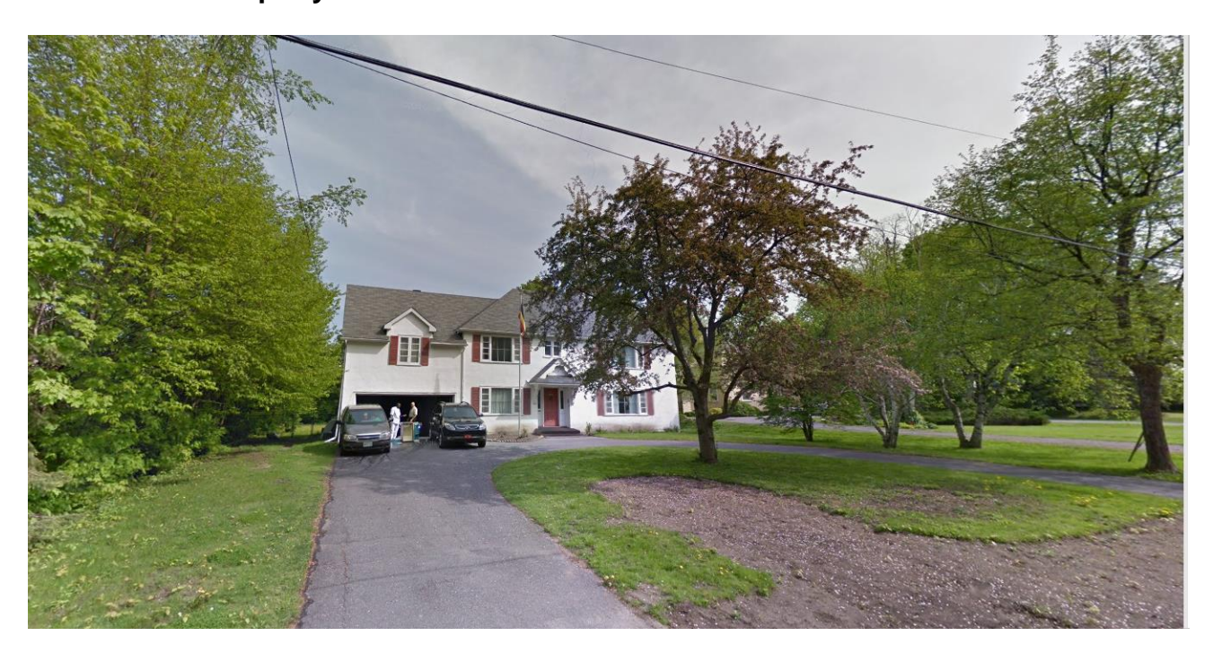
Previous house at 235 Mariposa Avenue