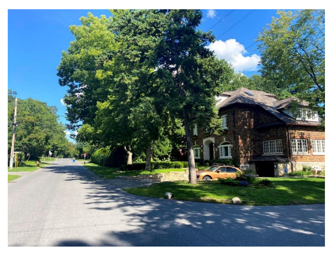
Streetscape looking east, showing the mature trees and house on the south side of Mariposa Avenue, at Sir Guy Carleton