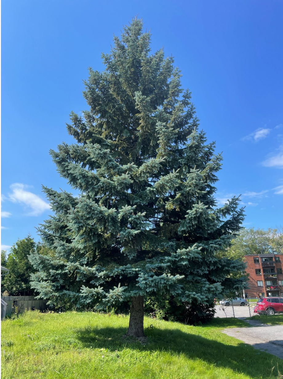
Figure 1: Tree 1, City-owned Colorado blue spruce to be retained