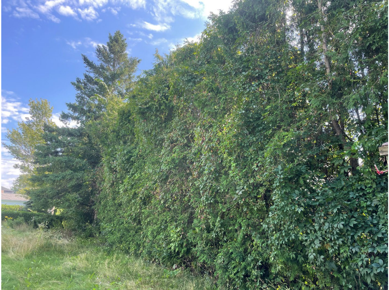
Figure 2: Cedar hedge along the rear property line with the white spruce (Tree 2) in the back