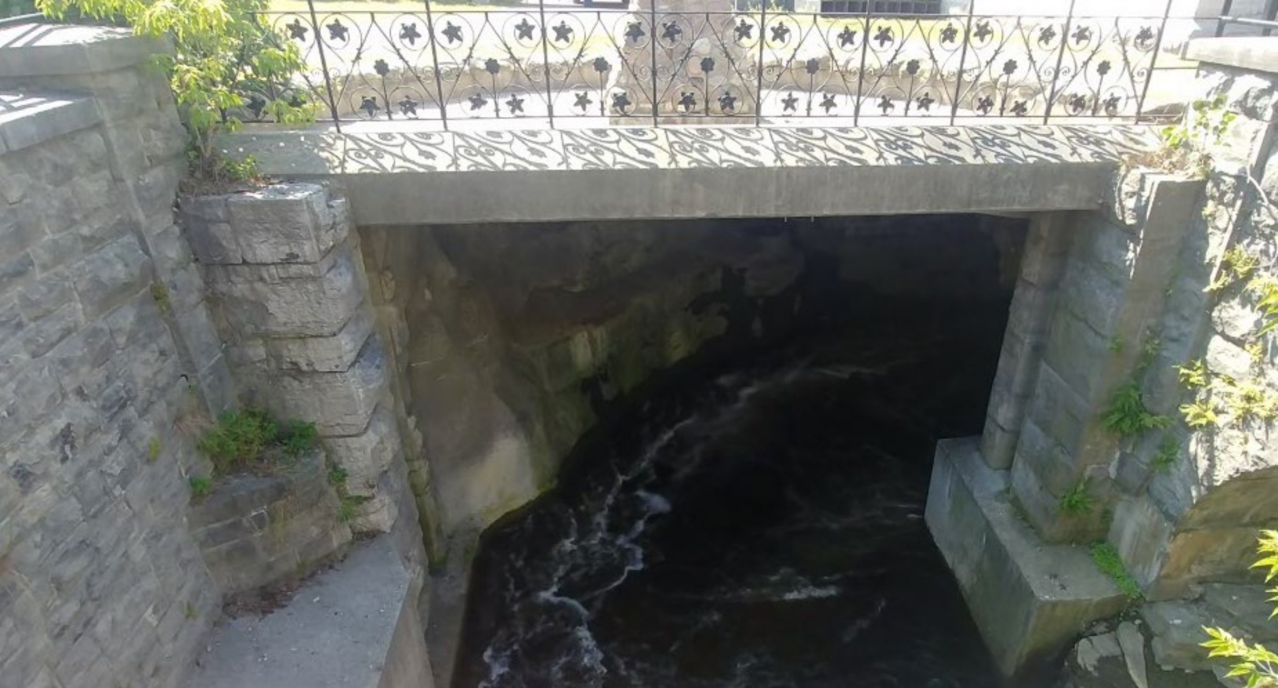
Ottawa Water Works Building (exterior), July 2018, City of Ottawa