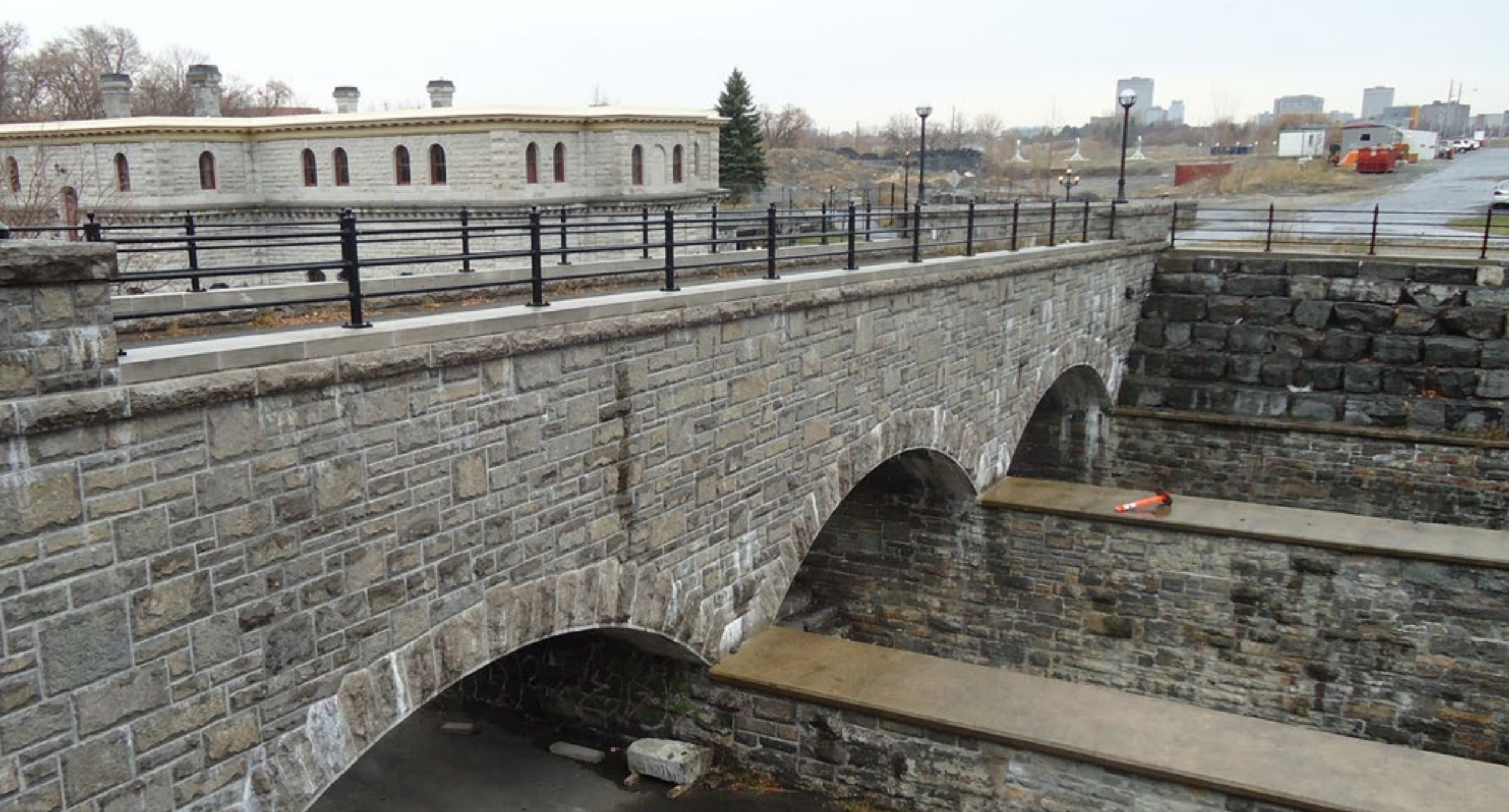
Pooley's Bridge and channeled tailrace. Jun 2016, City of Ottawa