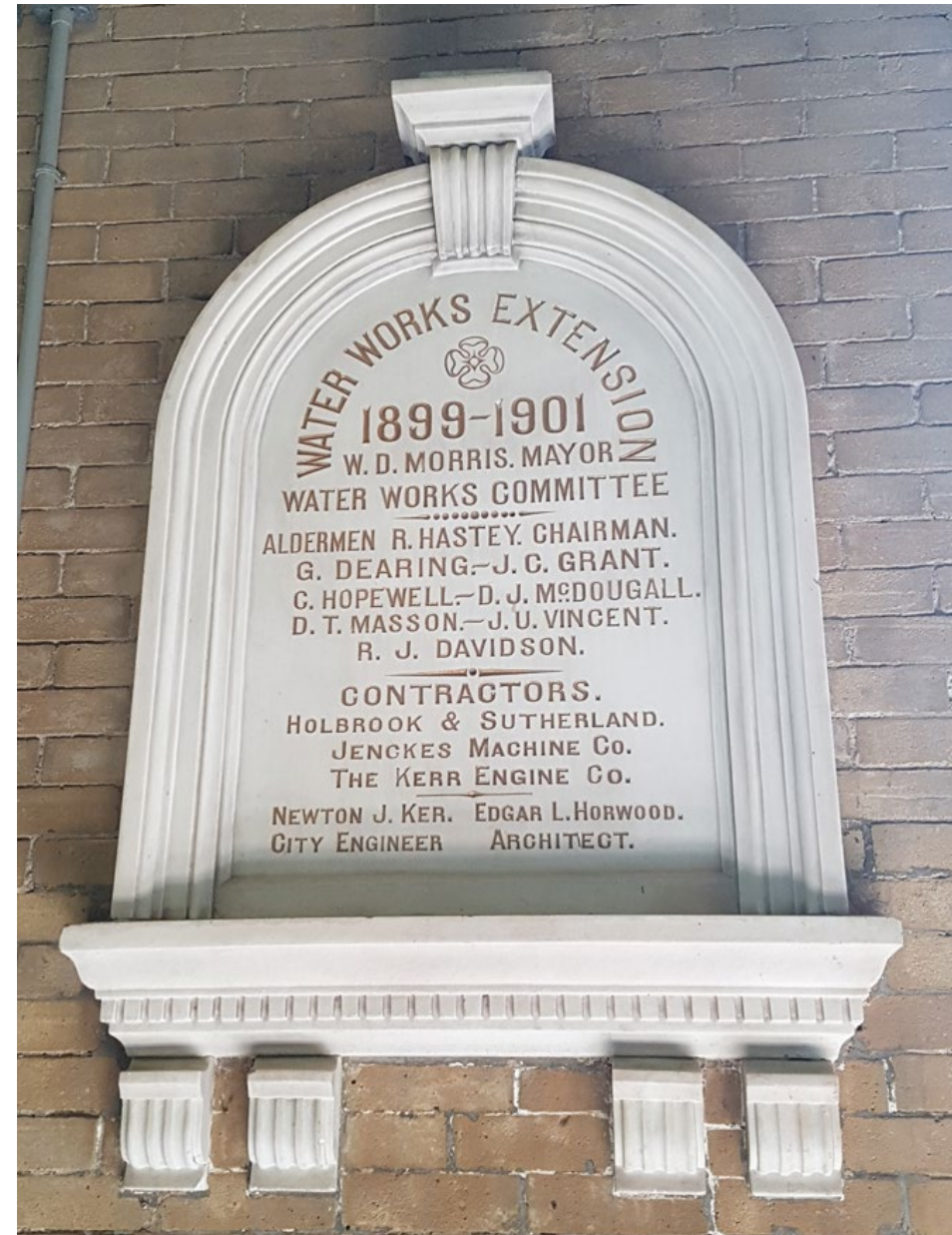
Ottawa Water Works Building (interior). Marble plaques. July 2018, City of Ottawa