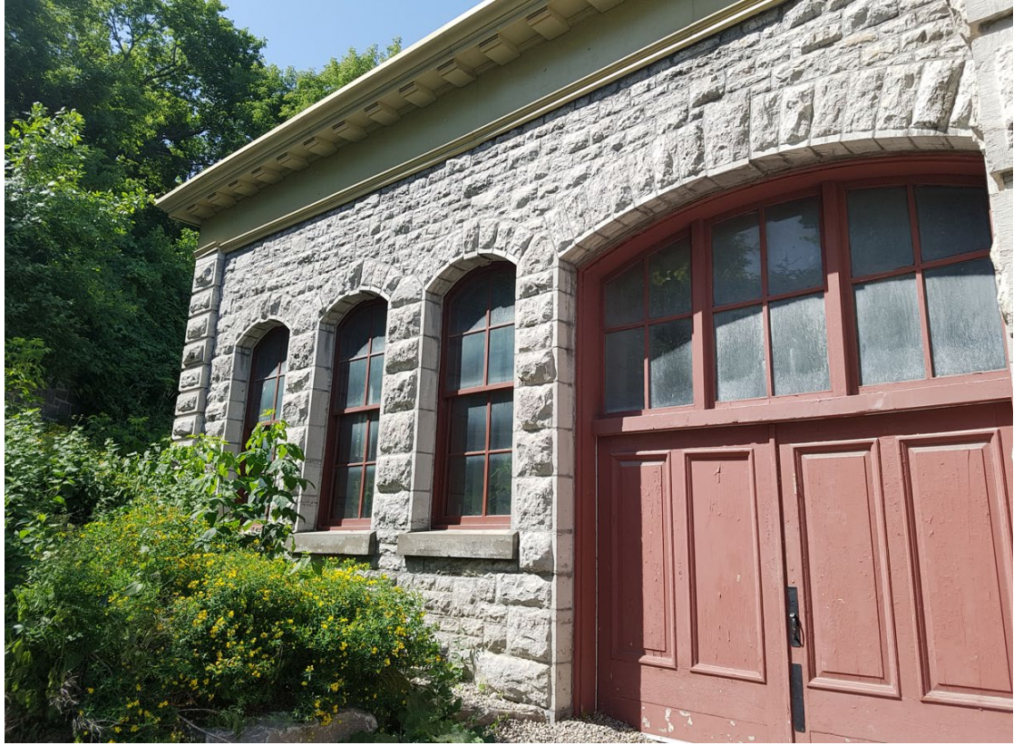
Ottawa Water Works Building (exterior), July 2018, City of Ottawa