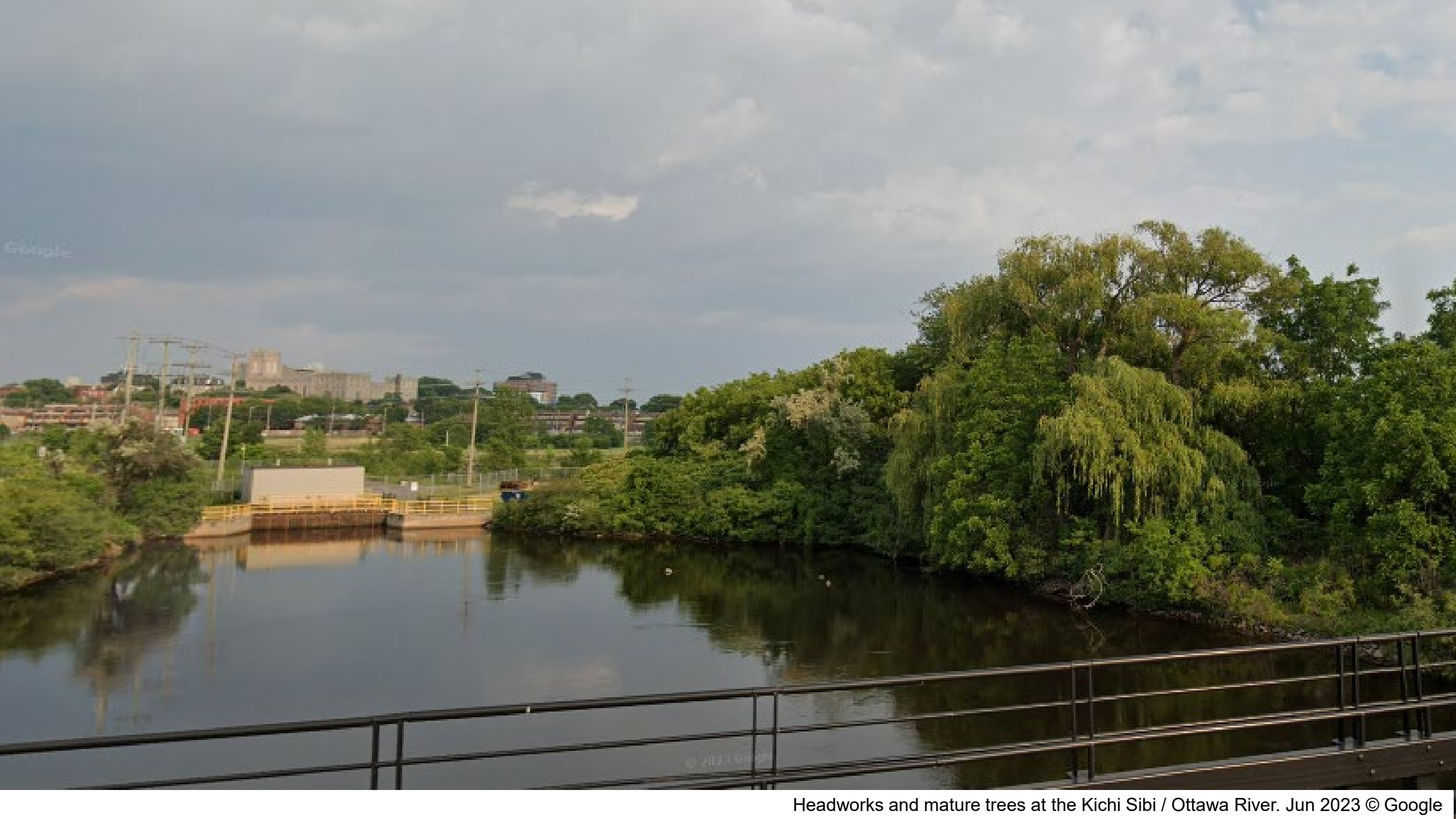
Headworks and mature trees at the Kichi Sibi / Ottawa River. Jun 2023