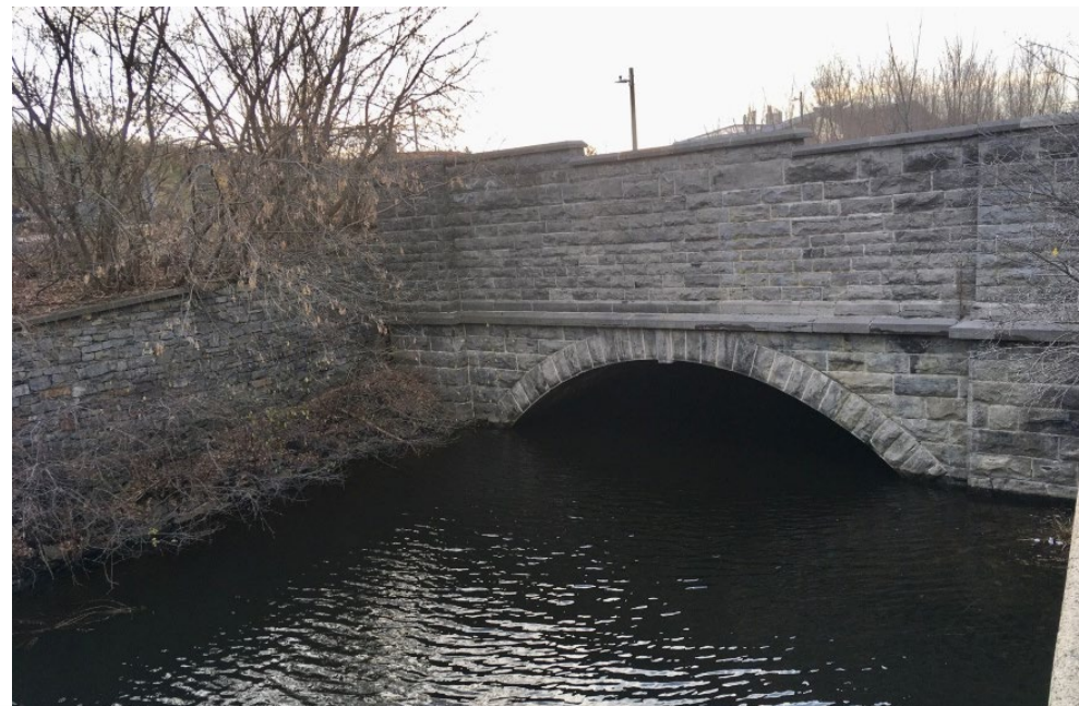
Three connected bridges: Lloyd Street Bridge (left), Grand Trunk Railway Bridge and Lett Street Bridge. Nov 2023, City of Ottawa and © 2023 Google, CNES / Airbus