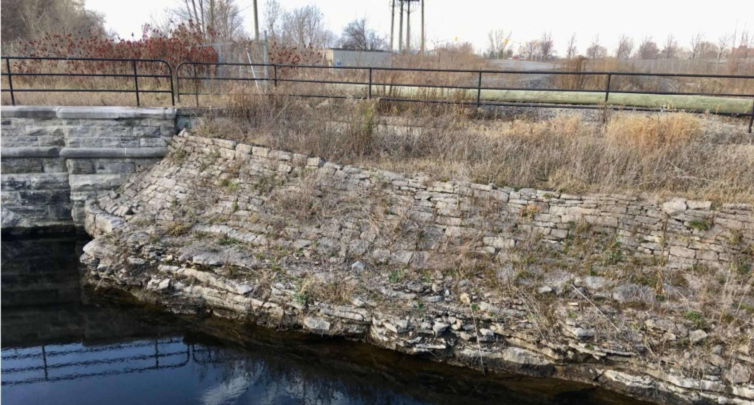
Open aqueduct, north wall meeting the Central Canada Railway Bridge. Nov 2023, City of Ottawa