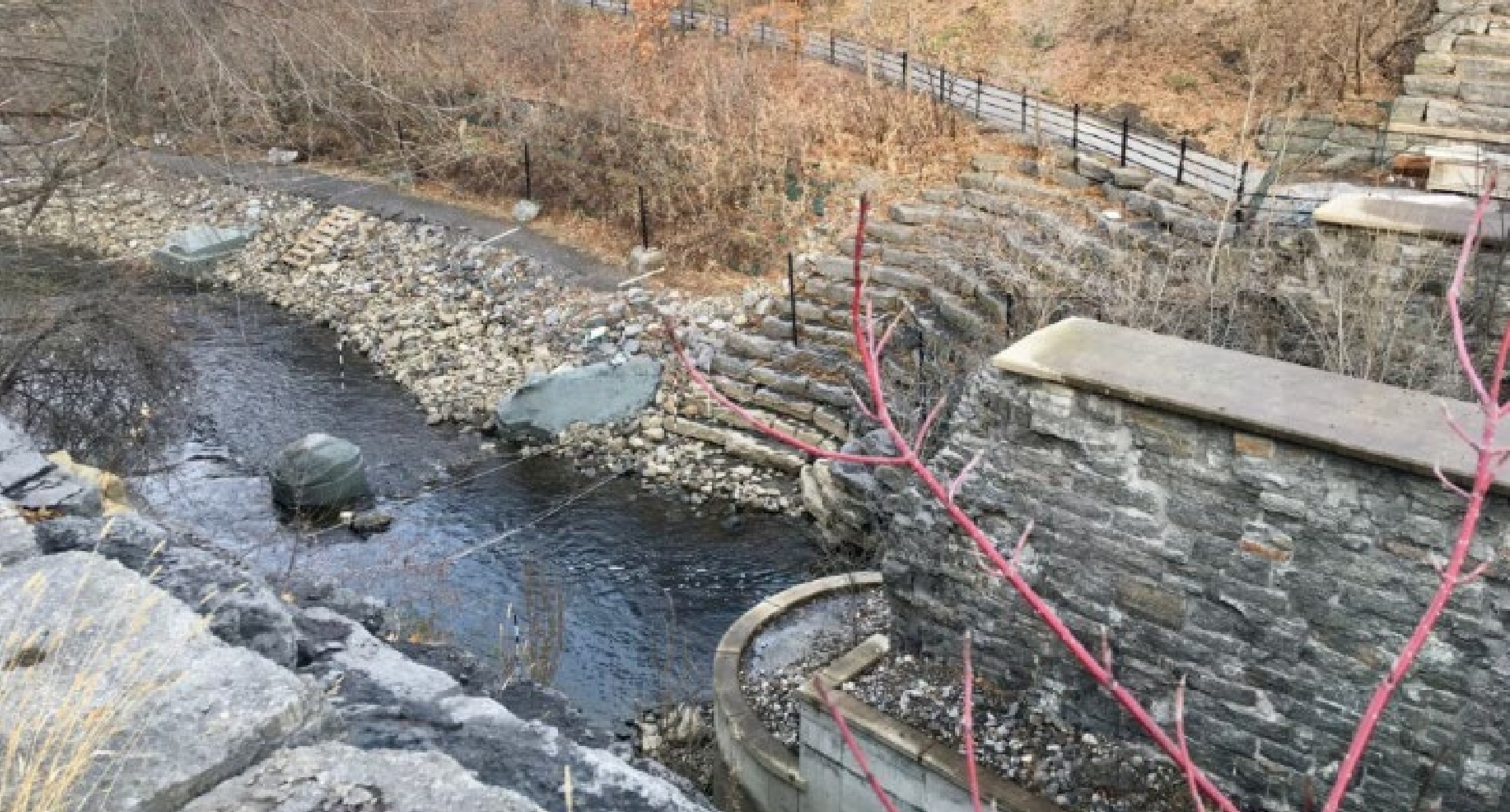
Tailrace, view looking northeast. Nov 2023, City of Ottawa