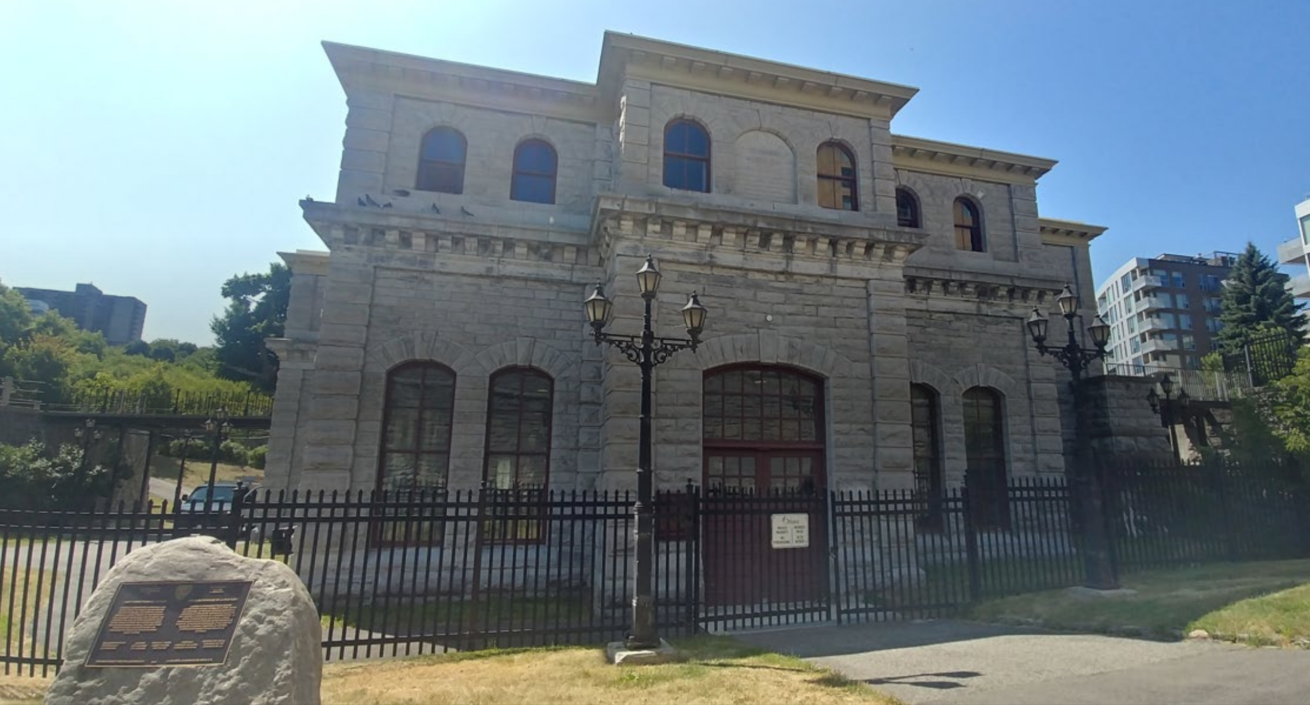
Ottawa Water Works Building (exterior), July 2018, City of Ottawa