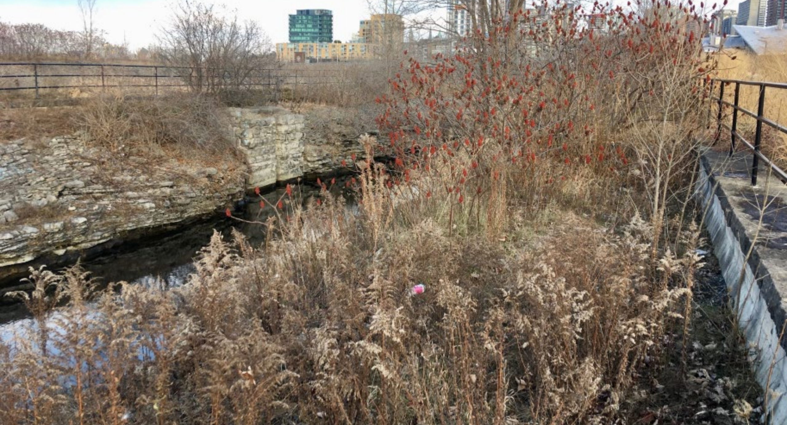
Open aqueduct looking northeast (remnant limestone abutments, sumac and other low shrubs). Nov 2023, City of Ottawa